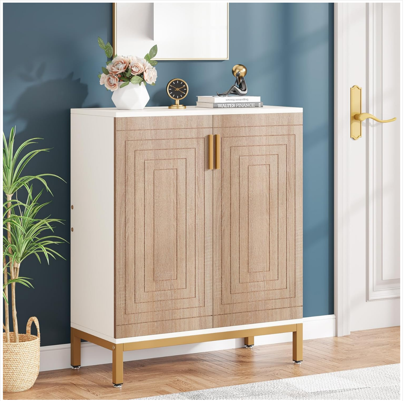
Figure 3.1: Adjustable feet for leveling the cabinet.