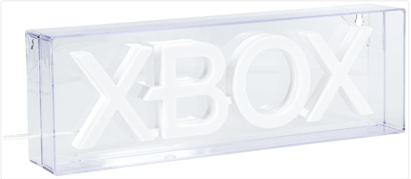
Image: The Paladone Xbox LED Neon Light unlit, highlighting its clear casing and the USB port for power connection.