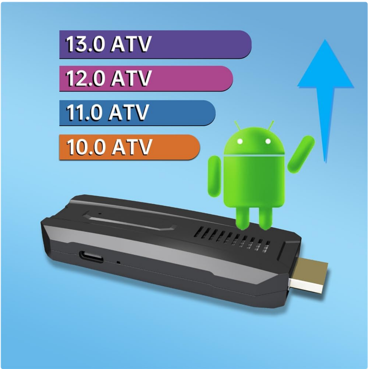
Figure 3.2: The device is powered by a low-power RK3528 Quad-Core 64-bit CPU and Mali-450 MP2 GPU.