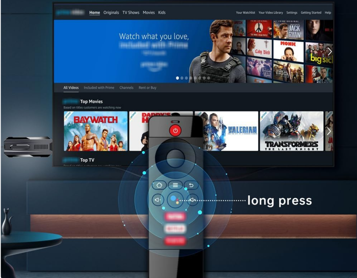
Figure 3.1: The X88-GK29 operates on Android 13.0, offering enhanced performance compared to earlier Android versions.

Press and hold the voice button for easy searching, control and Play. Search popular apps like: PrimeVideo, Netflix, Disney+, etc. Compatible with a variety of smart devices, including TVs, smart homes, etc.