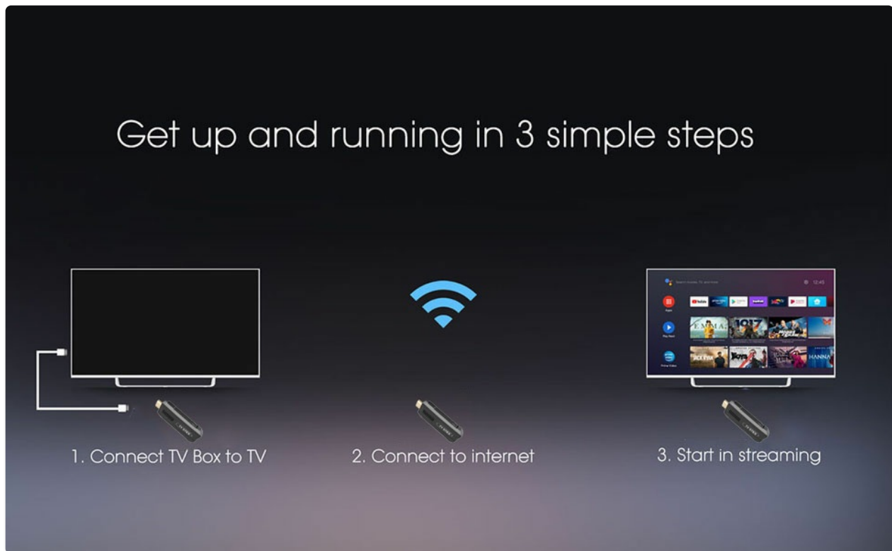
Figure 4.1: Visual representation of the three main setup steps for the X88-GK29 TV Stick.