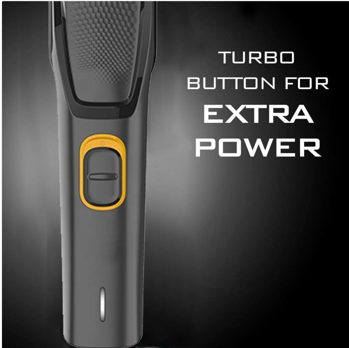
Image: A close-up of the trimmer's power button, which also functions as a turbo button for extra power when needed for thicker hair.