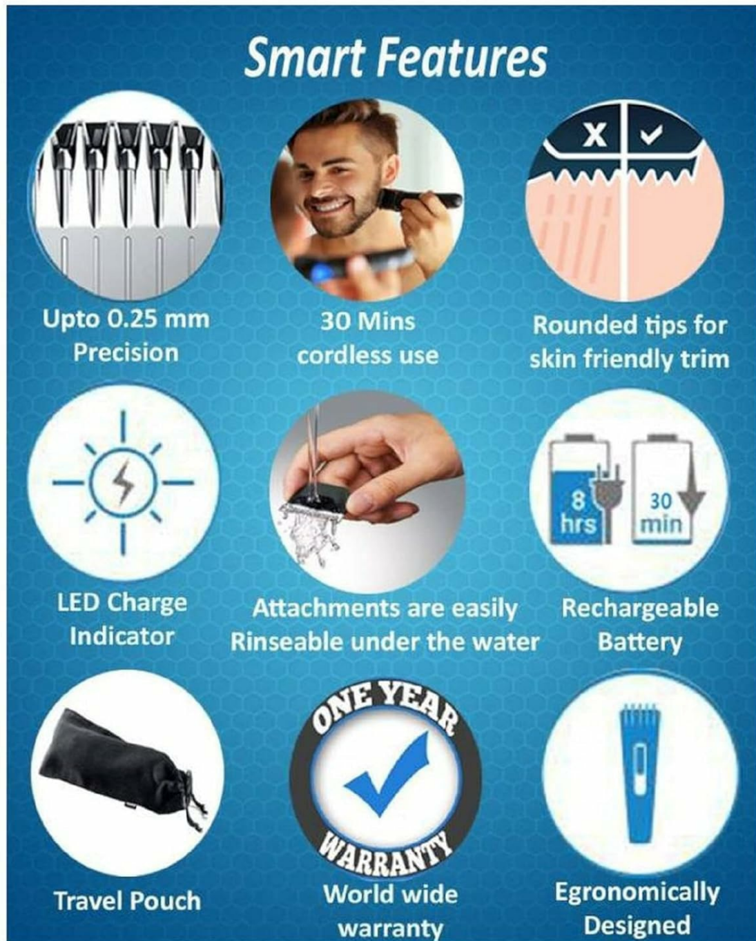
Image: An overview of smart features, including the 8-hour charging time for 30 minutes of cordless use and the LED charge indicator.