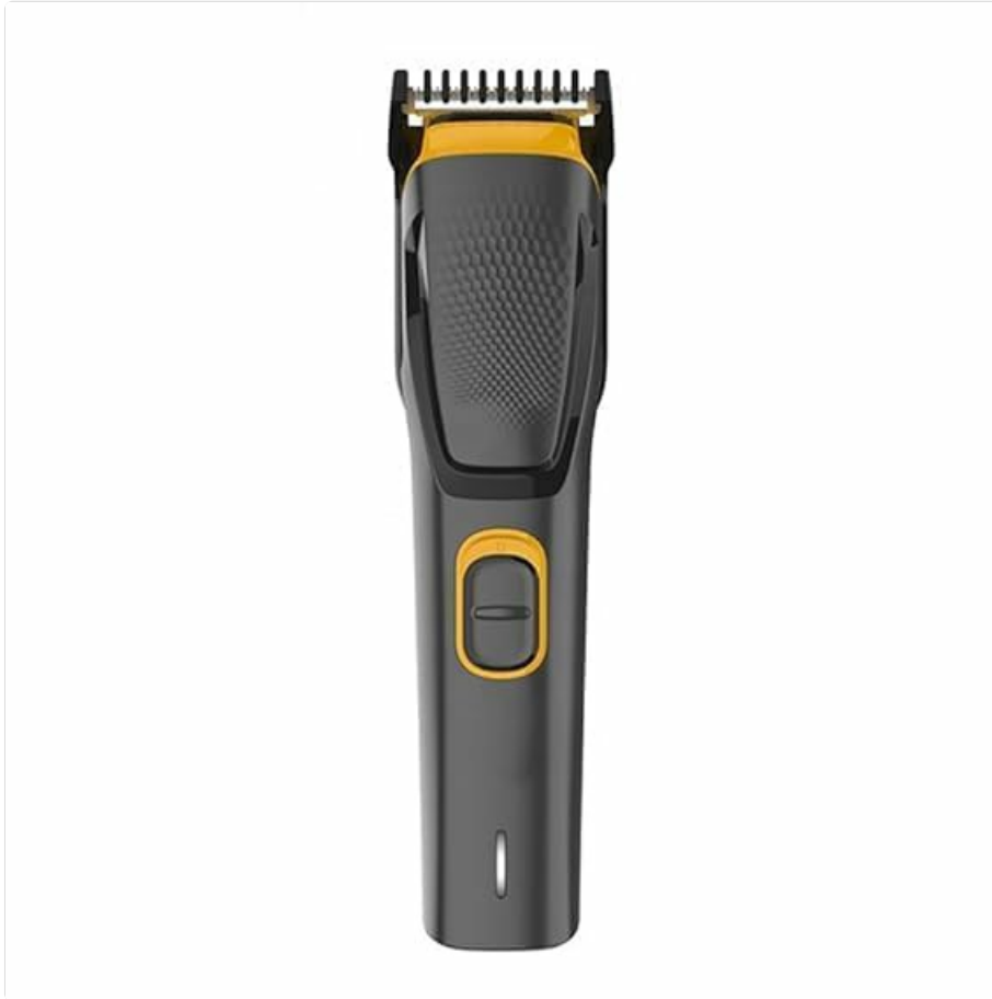
Image: The AANTAR HTC AT-509 Trimmer unit with its included accessories, such as comb guides, charging cable, and cleaning brush.