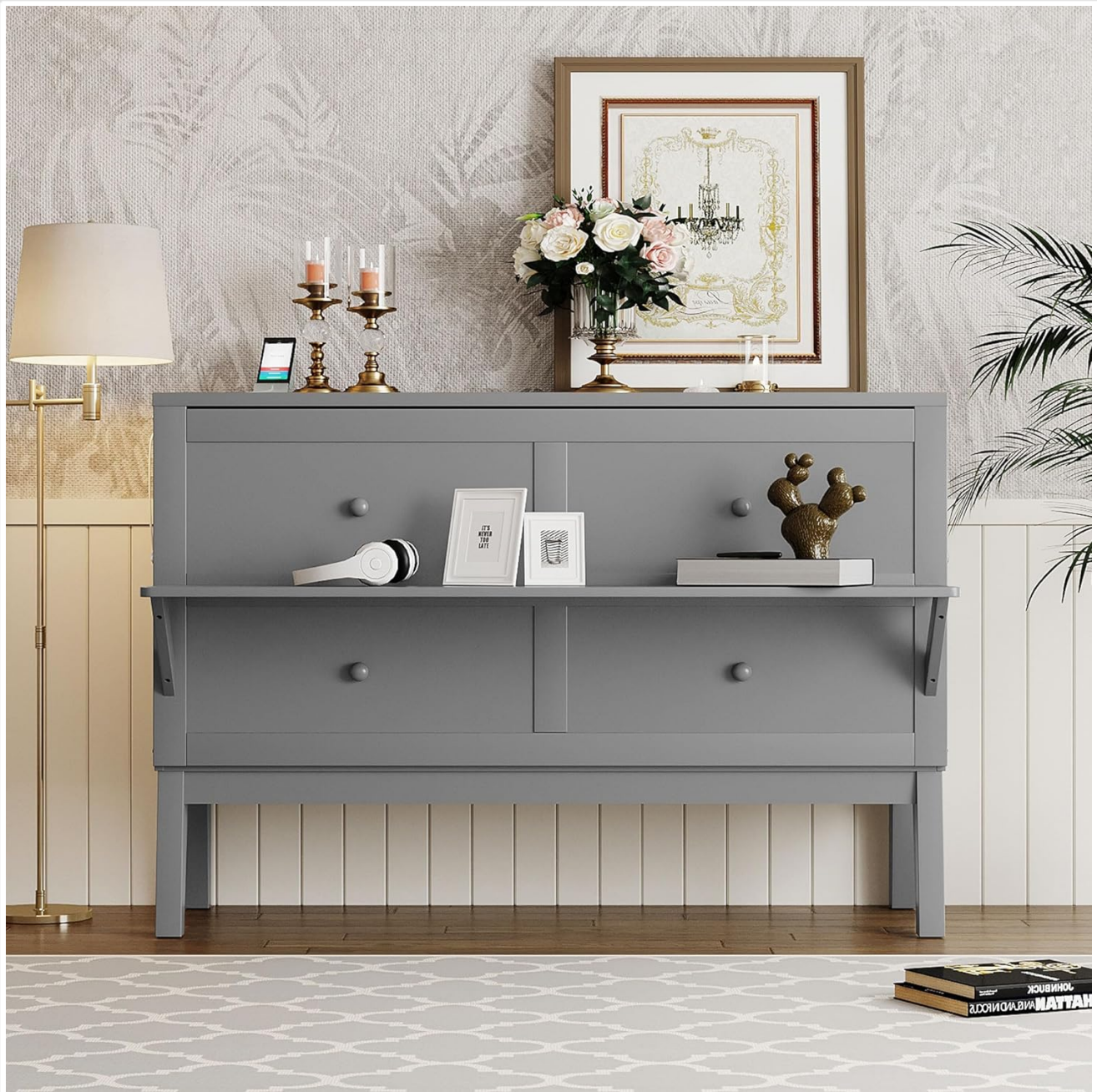
Image: The Linique Queen Size Murphy Bed in its compact cabinet configuration, showcasing its space-saving design. The bed is folded away, and the unit appears as a stylish cabinet.