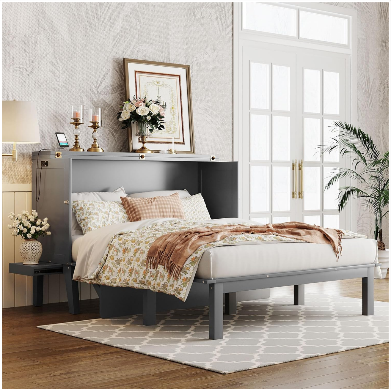
Image: The Linique Queen Size Murphy Bed fully extended in its bed configuration, ready for use. It shows the bed frame, mattress, and the cabinet acting as a headboard.