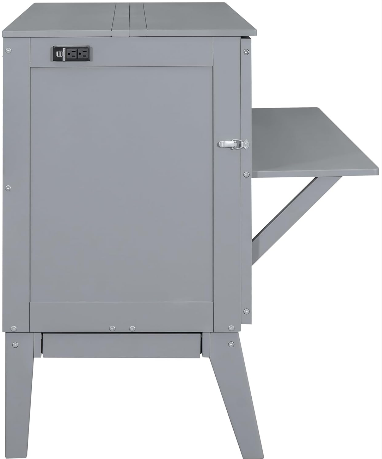
Image: A detailed side view of the Murphy bed cabinet, highlighting the integrated USB charging port and the pull-out sliding shelf. This demonstrates the convenient features for bedside use.