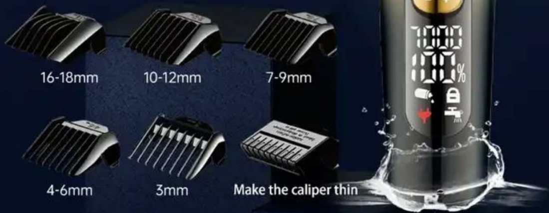
Image: The Hatteker RFC-695 hair clipper highlighting its LCD digital display, which shows battery percentage, speed, and other operational indicators.

Full body wash, ceramic blade, Powder metallurgy blade,