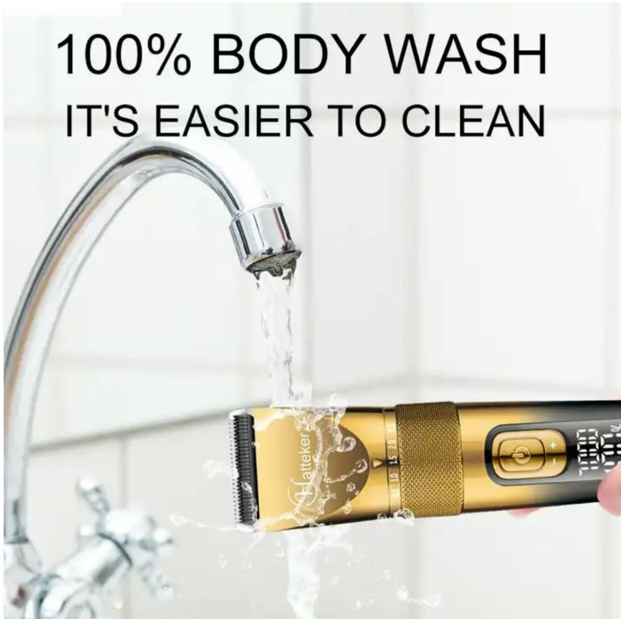
Image: The Hattaker RFC-695 hair clipper being cleaned under a running faucet, illustrating its 100% body wash capability for easy maintenance.