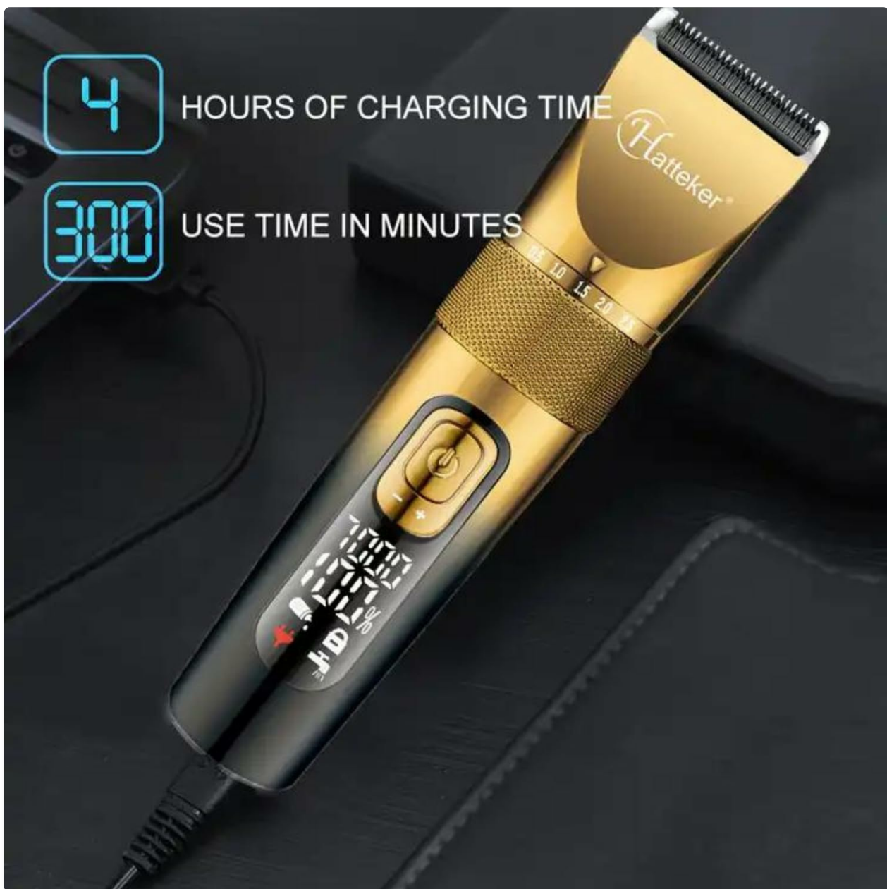
Image: The Hattaker RFC-695 hair clipper connected to a USB charging cable, illustrating the 4-hour charging time required for 300 minutes of cordless operation.