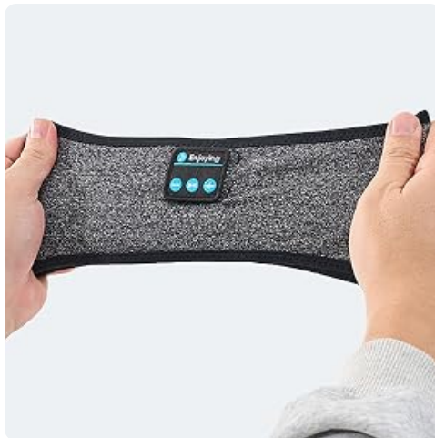
Image: A close-up shot of the control panel embedded in the headband, clearly showing the three distinct buttons for media and call management.

The built-in microphone allows for hands-free calling when connected to your phone. You can answer, hang up, or reject calls directly from the control panel.