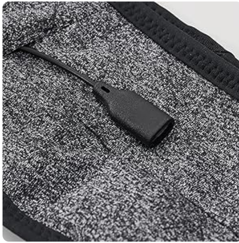
Image: A detailed view of the thin speaker module, demonstrating its placement within the headband's fabric and its adjustability.