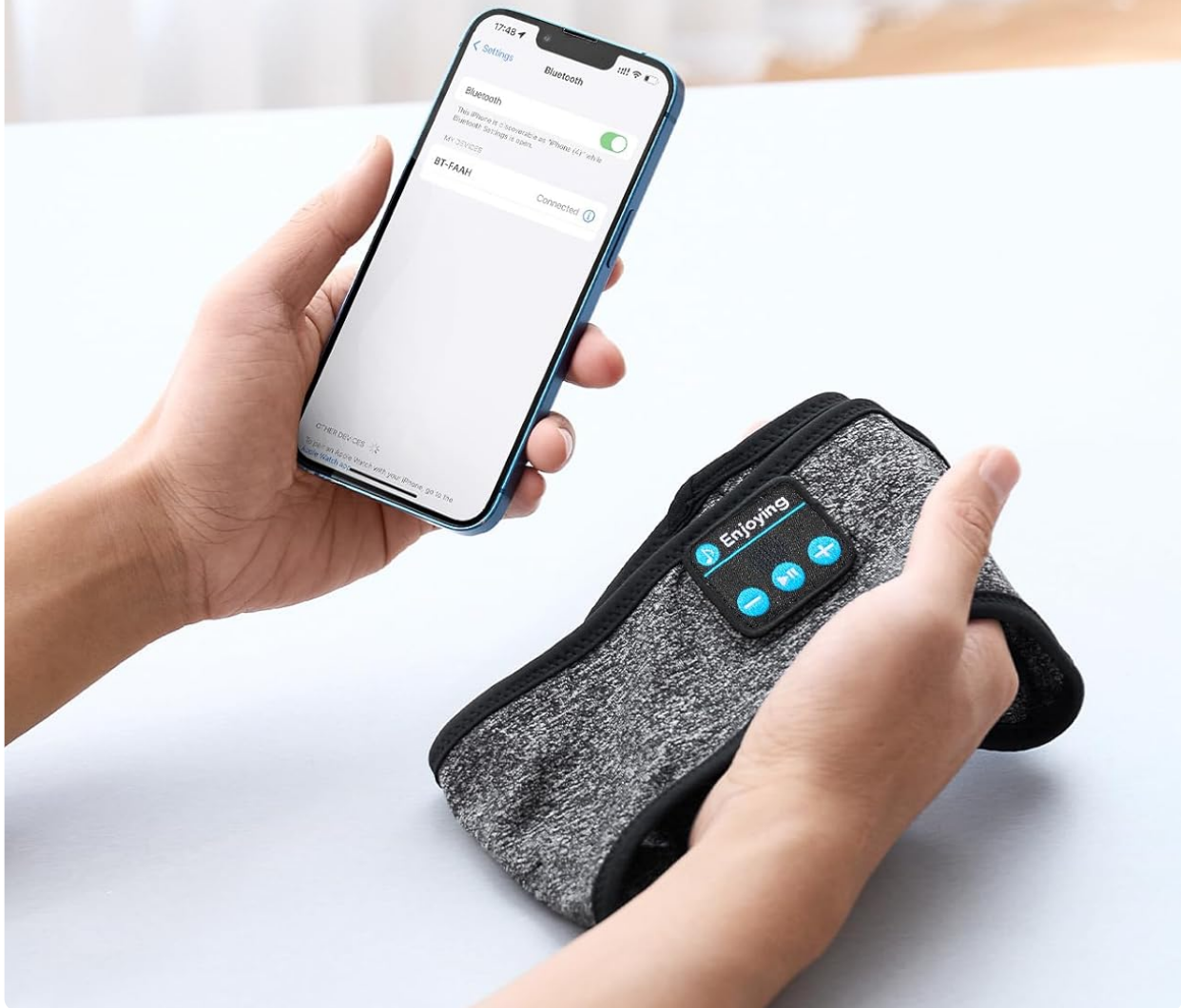
Image: This image displays the wireless Bluetooth pairing process, showing a user's hand holding a smartphone with its Bluetooth settings open, alongside the Enjoying ENJ01 headband, ready for connection.