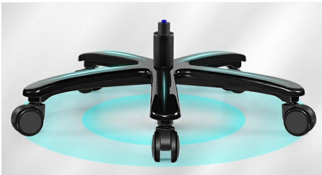
Image 4.1: Illustration of the chair base and gas lift cylinder components.