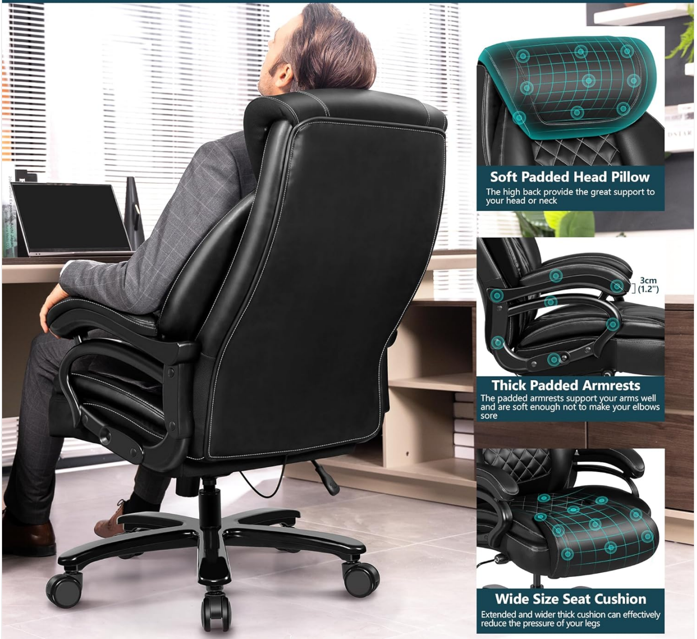
Image 5.2: Illustration of the chair's rocking and recline capabilities.