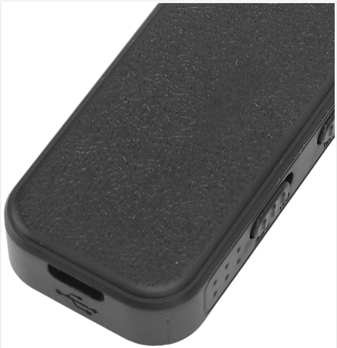
Figure 4.3: Opposite side view of the camera, showing the Micro USB charging port.