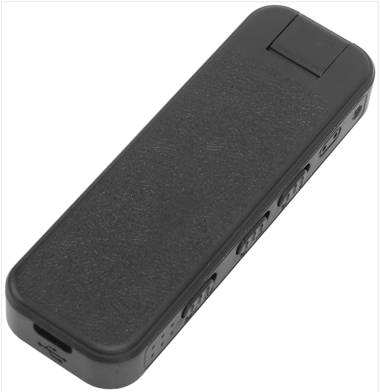
Figure 4.2: Side view of the camera, indicating the TF card slot, reset button, and the power/mode switch.