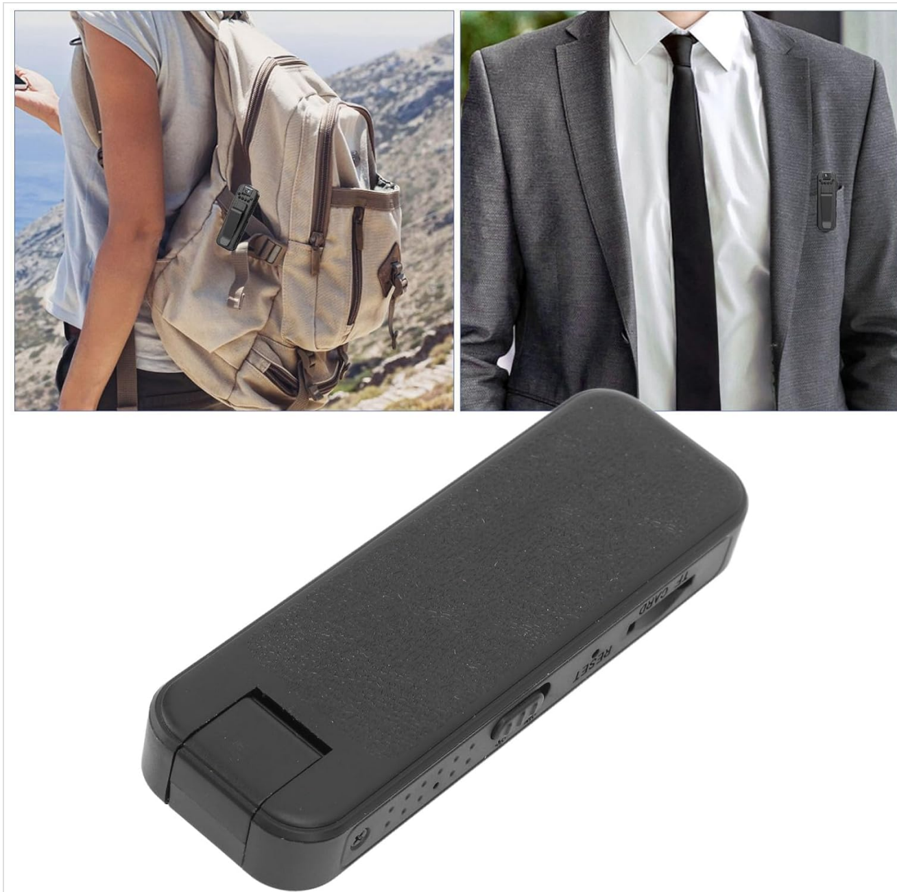
Figure 6.2: The camera's clip design allows for versatile attachment to clothing or bags, making it discreet and convenient for on-the-go recording.