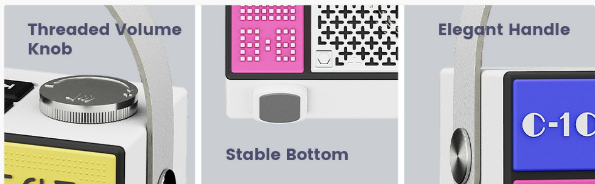
Image 2.2: Top panel controls of the heetipuk C10 speaker, including the power button.

To power on the speaker, press and hold the power button located on the top panel until you hear an audible prompt or see the indicator light illuminate. To power off, press and hold the power button again.