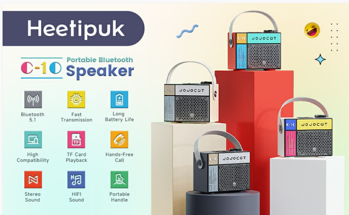
Image 1.1: The heetipuk C10 Portable Speaker, highlighting its compact size (4.2 x 2.1 x 3.3 inches, 0.5 lbs).

The heetipuk C10 Retro Mini Bluetooth Speaker is a compact and lightweight portable audio device designed for wireless music playback and hands-free calling. It features Bluetooth 5.1 connectivity, TF card support, and a rechargeable battery for extended use.