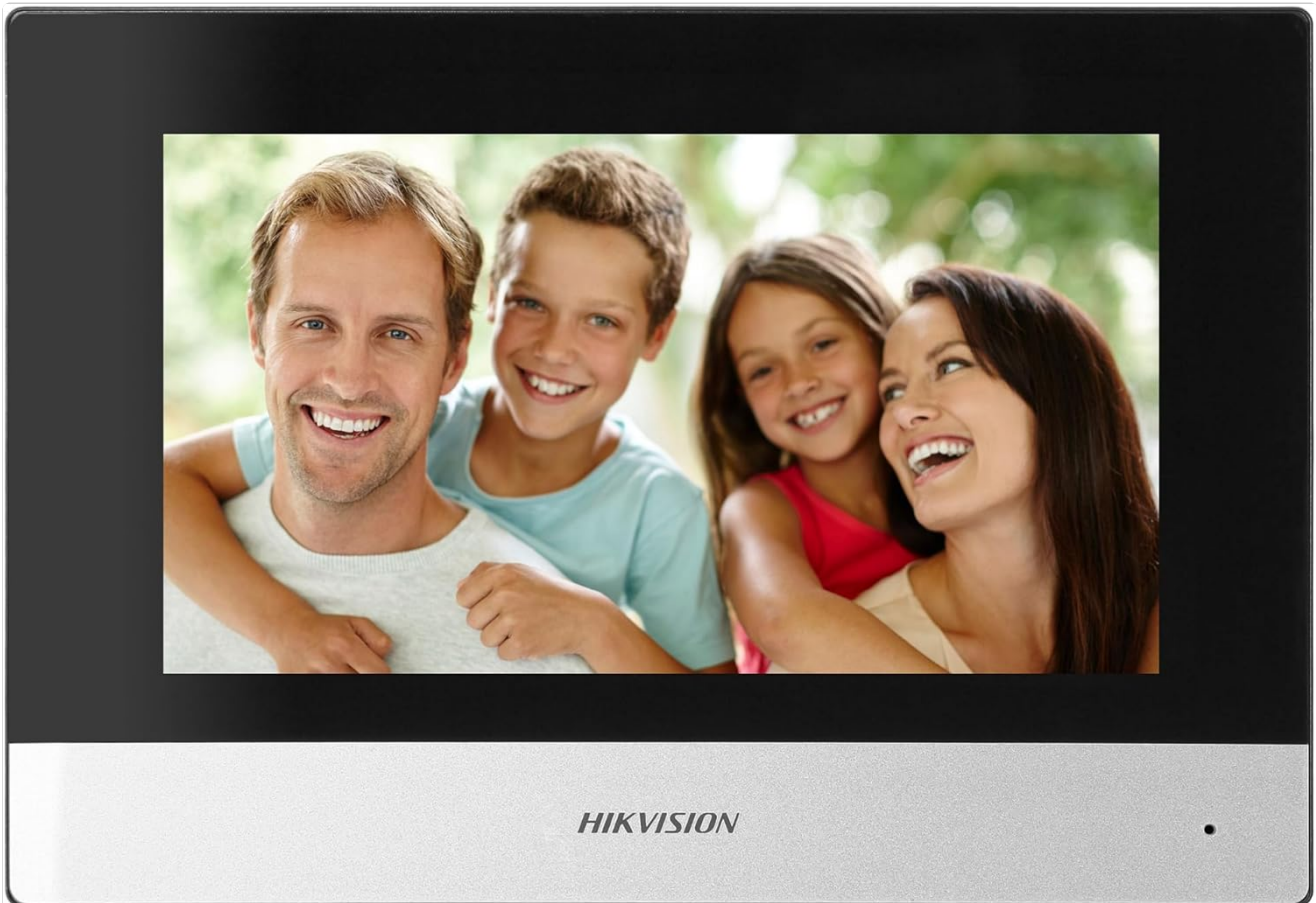
Figure 5: Hikvision Indoor Monitor (Front View)

This image shows the Hikvision 7-inch indoor monitor from the front, highlighting its sleek design and large display area.