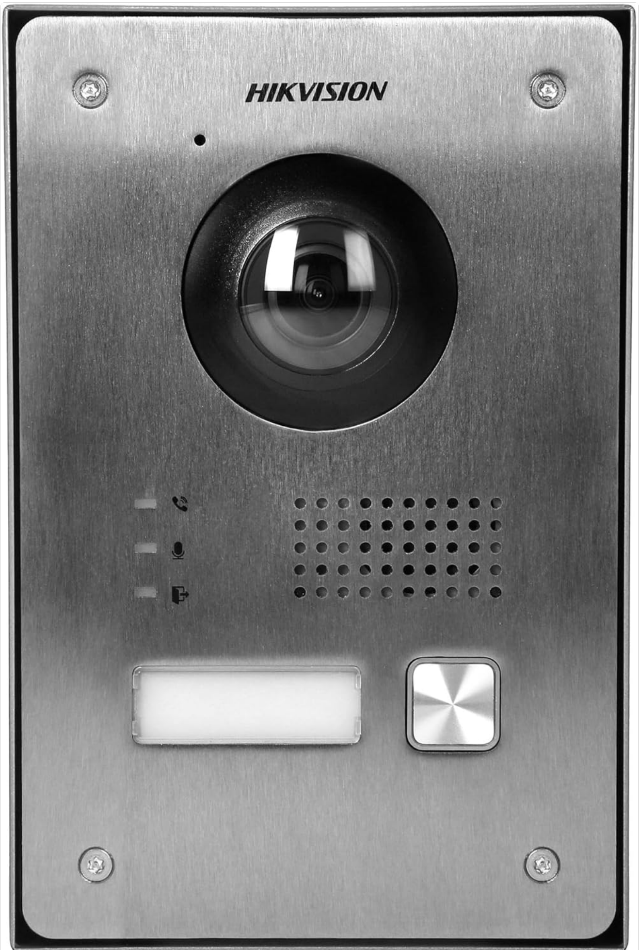
Figure 3: Hikvision Outdoor Panel (Front View)

This image shows the front of the Hikvision outdoor panel, featuring the FullHD camera, speaker grille, call button, and nameplate area.