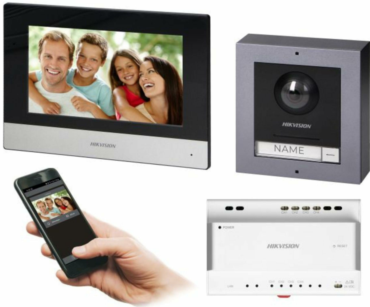
Figure 1: Hikvision 7-inch Video Intercom Monitor (Front View)

The image displays the front view of the Hikvision 7-inch video intercom monitor, featuring a large screen and the Hikvision logo at the bottom.