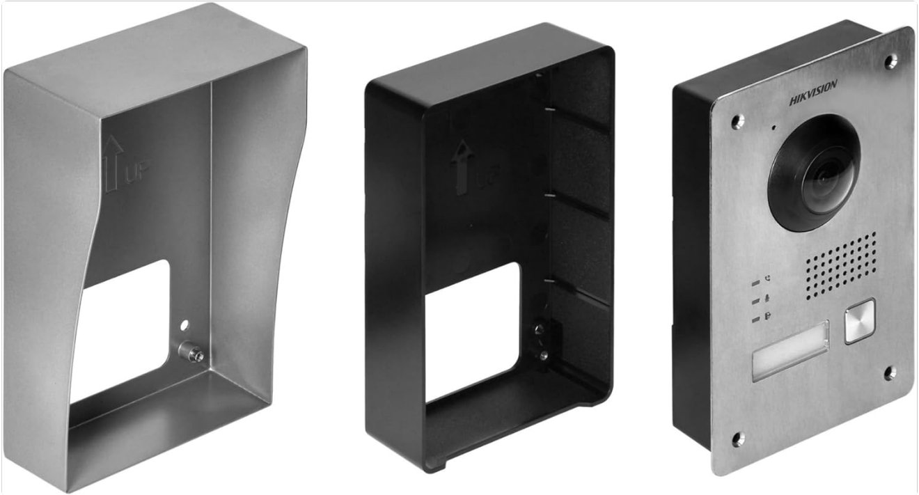
Figure 2: Hikvision Outdoor Panel and Mounting Accessories

This image shows the Hikvision outdoor panel alongside its rain shield and a flush-mount box, illustrating the various mounting options available.