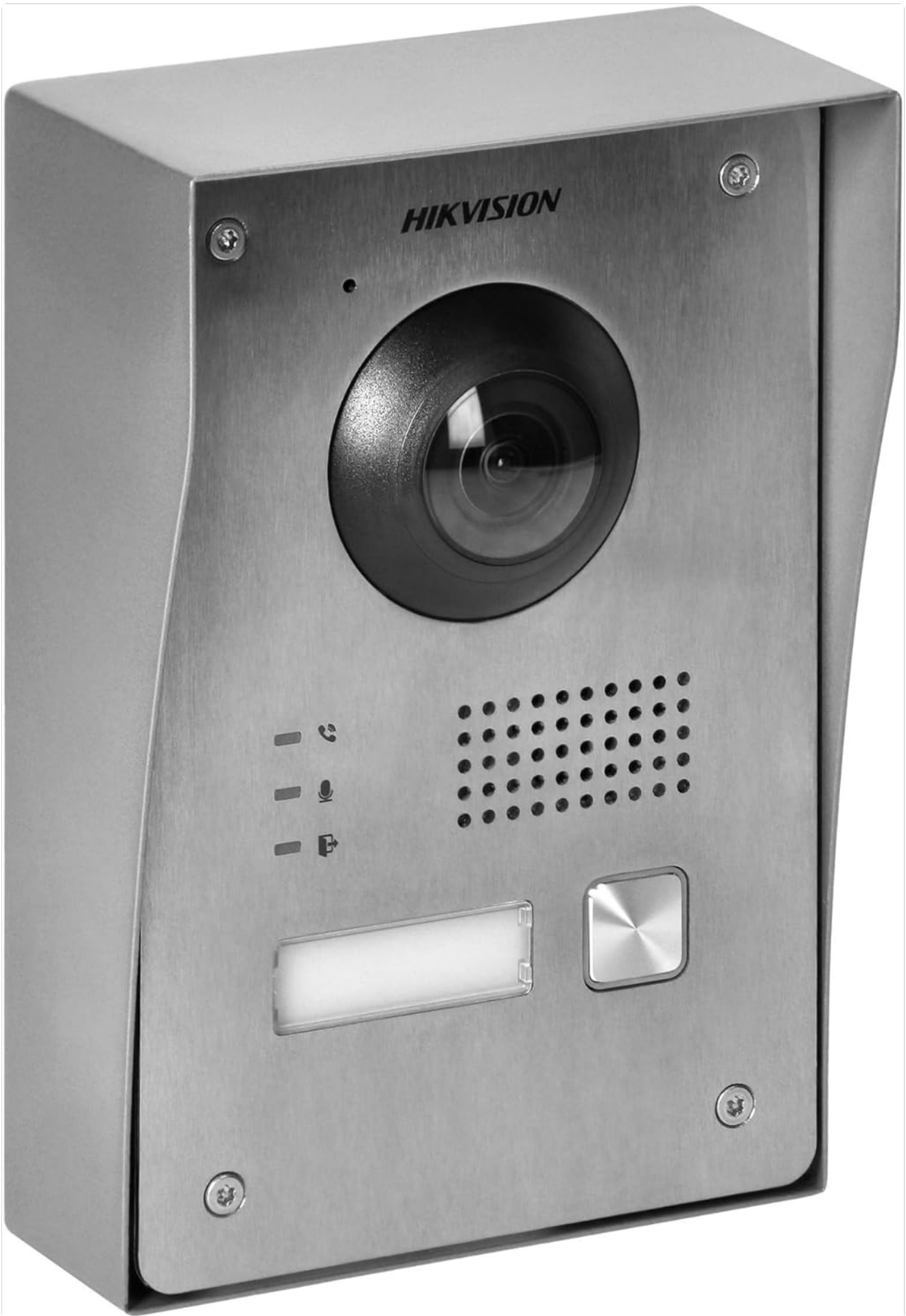
Figure 6: Hikvision Outdoor Panel (Angled View)

An angled view of the Hikvision outdoor panel, showcasing its robust construction and integrated camera and call button.