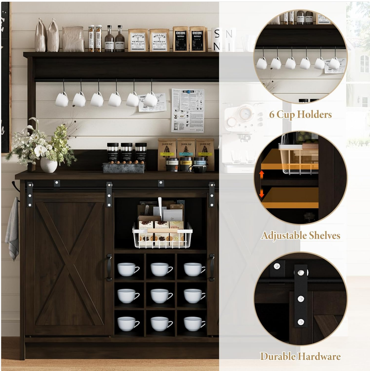
Image: Details of cup holders, adjustable shelves, and hardware.