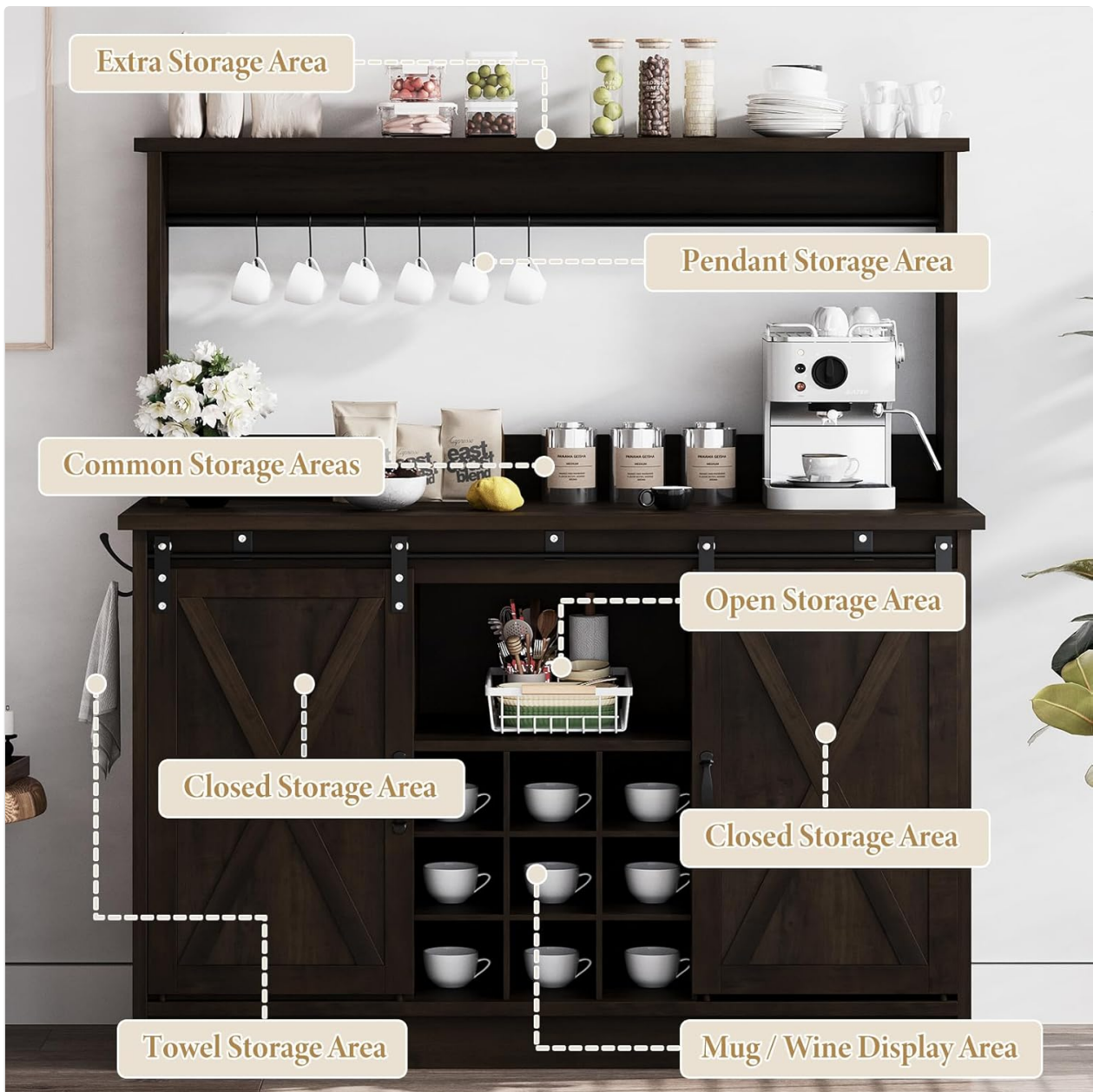
Image: Overview of the cabinet's diverse storage zones.