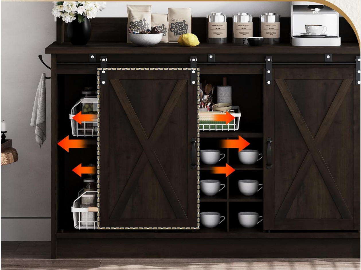
Image: Sliding barn doors in action.