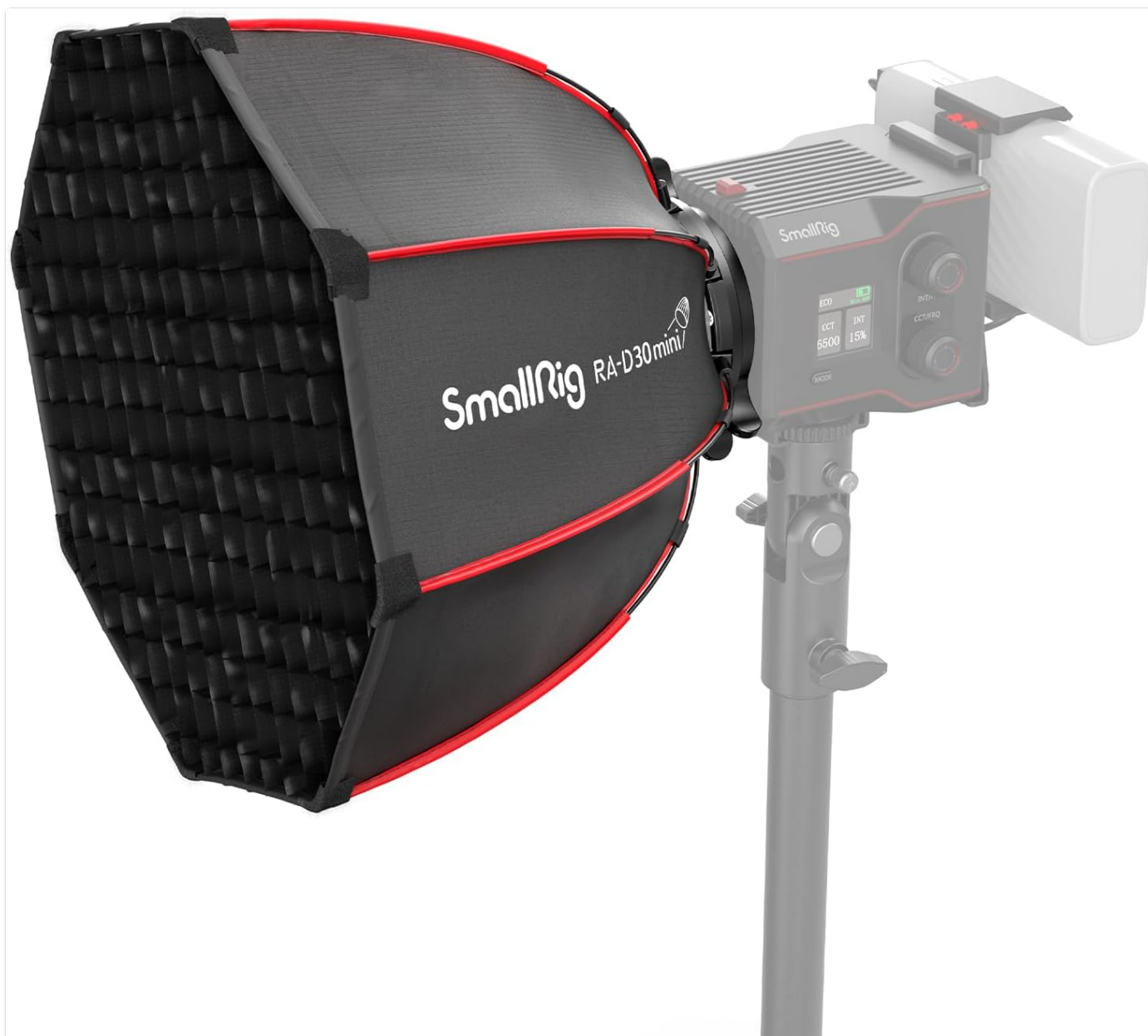
Image: The SmallRig Mini Parabolic Softbox RA-D30 mounted on a compatible COB LED light.