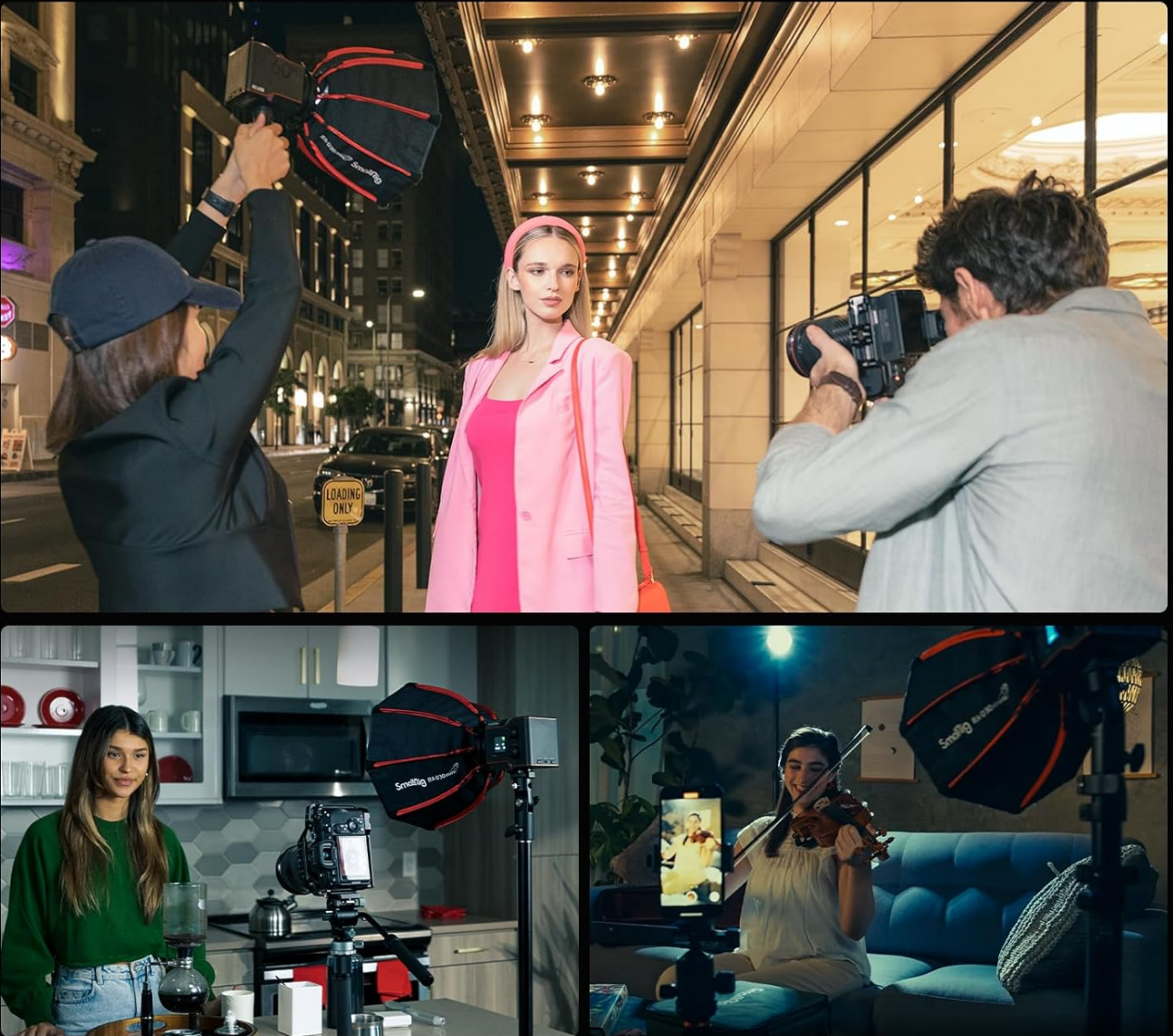
Image: Visual representation of the softbox's dimensions and compatible SmallRig lighting equipment.