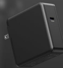
100W PD Charger for RC 60B (ID: 4315)

Image: The softbox in its folded, portable state, demonstrating its compact size.