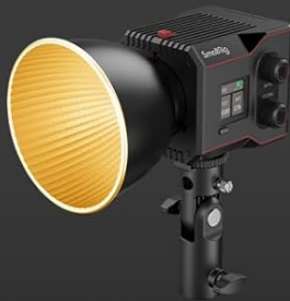
RC 60B COB Light (ID: 4376)