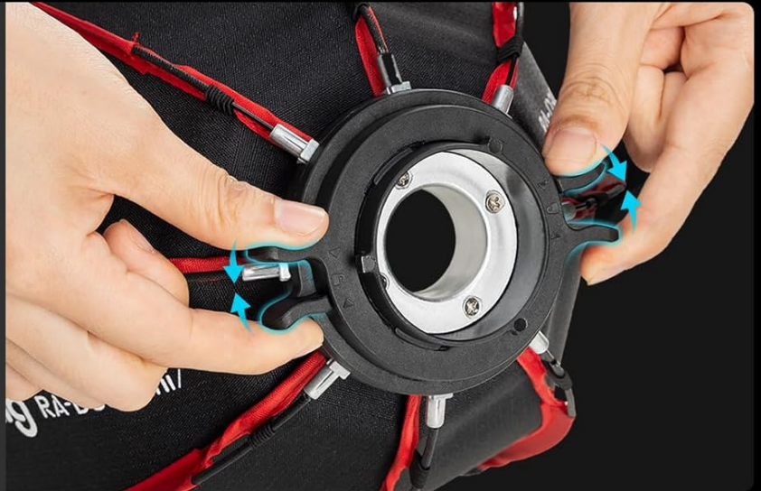
Image: Illustration of the quick-release installation and detachment process.

Just click the quick release buttons to fold it back