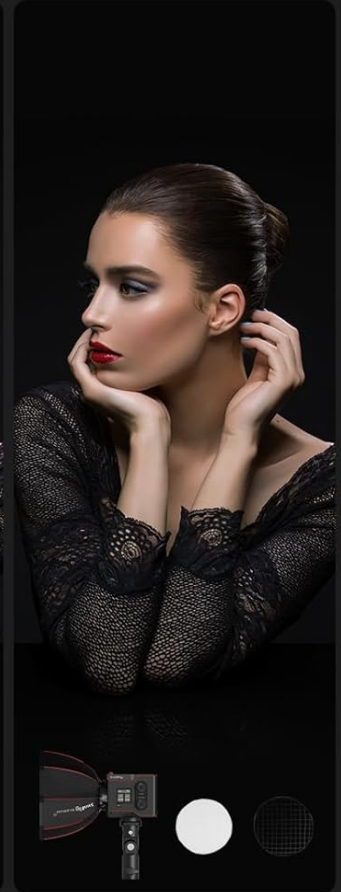
With Diffuser and Grid

Image: All components included in the SmallRig Mini Parabolic Softbox package.