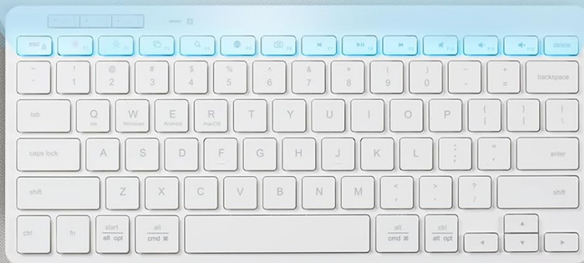
Image: Detailed view of the keyboard keys, illustrating the scissor mechanism for quiet and comfortable typing.