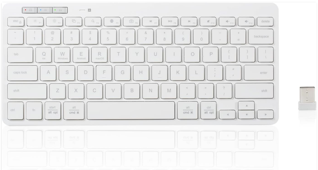
Image: Front view of the Bnnwa Multi-Device Wireless Bluetooth Keyboard, showcasing its compact design and white color.

The Bnnwa Multi-Device Wireless Bluetooth Keyboard (Model D817) is a compact and slim keyboard designed for seamless compatibility across various operating systems and devices. It offers dual-mode connectivity (2.4G USB and Bluetooth) and allows for easy switching between up to three connected devices, enhancing productivity and comfort for everyday use.