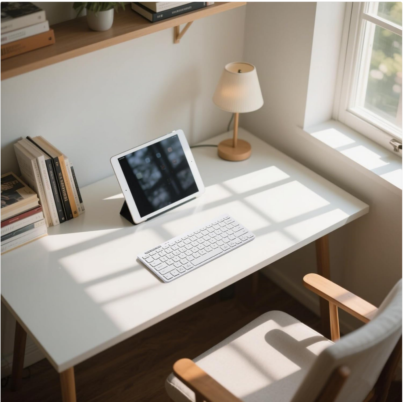
Image: The keyboard positioned on a desk next to an iPad, demonstrating its slim and portable design.