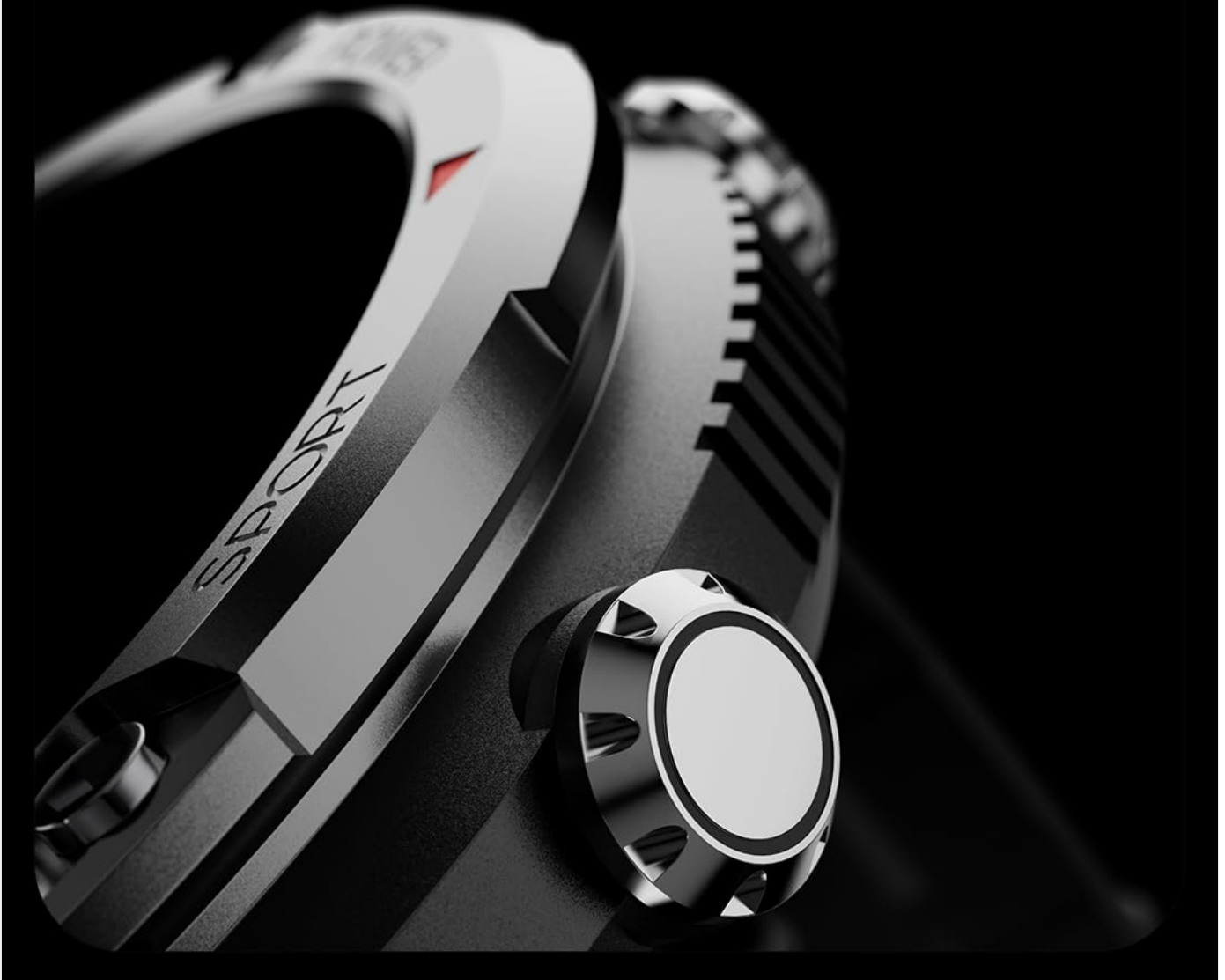
Figure 3.2: Shockproof Dual Chamfered Crown. This close-up image highlights the robust construction of the smartwatch's crown, emphasizing its shockproof design for enhanced durability.