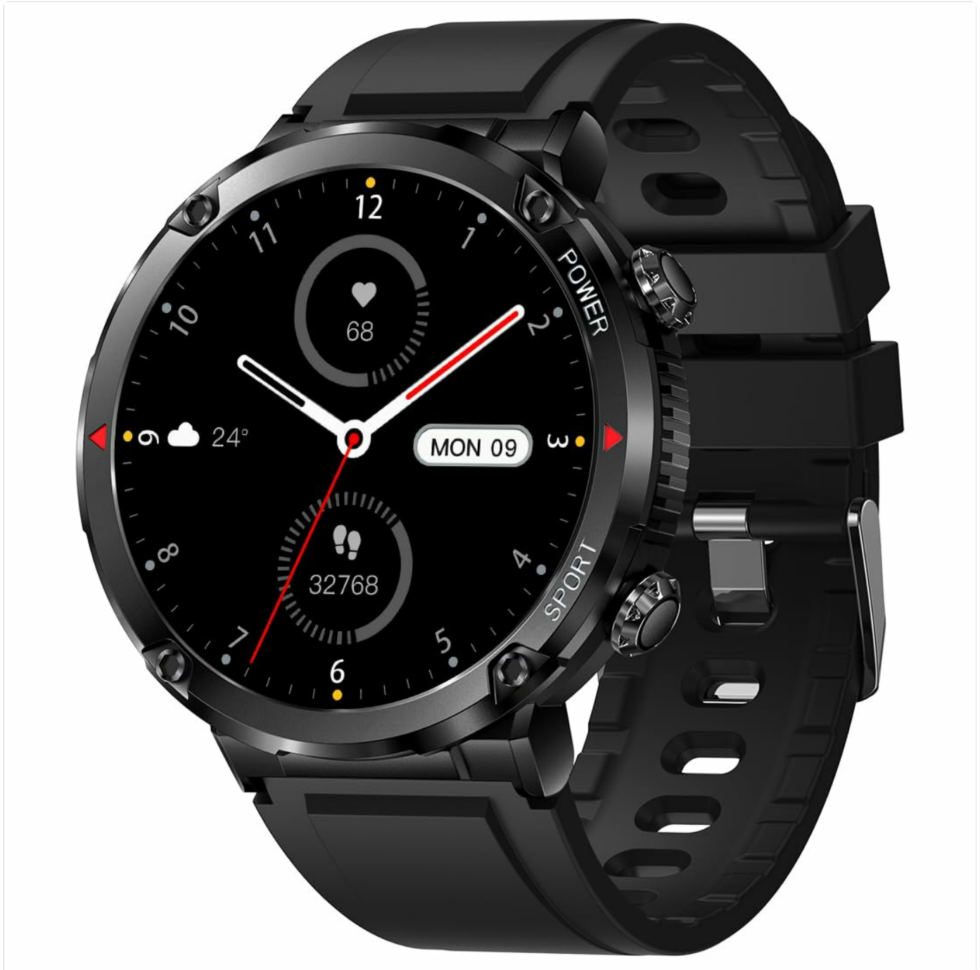
Figure 1.1: Fire-Boltt Sphere Smartwatch. This image displays the main view of the smartwatch, highlighting its round display and rugged design, essential for initial setup and identification.