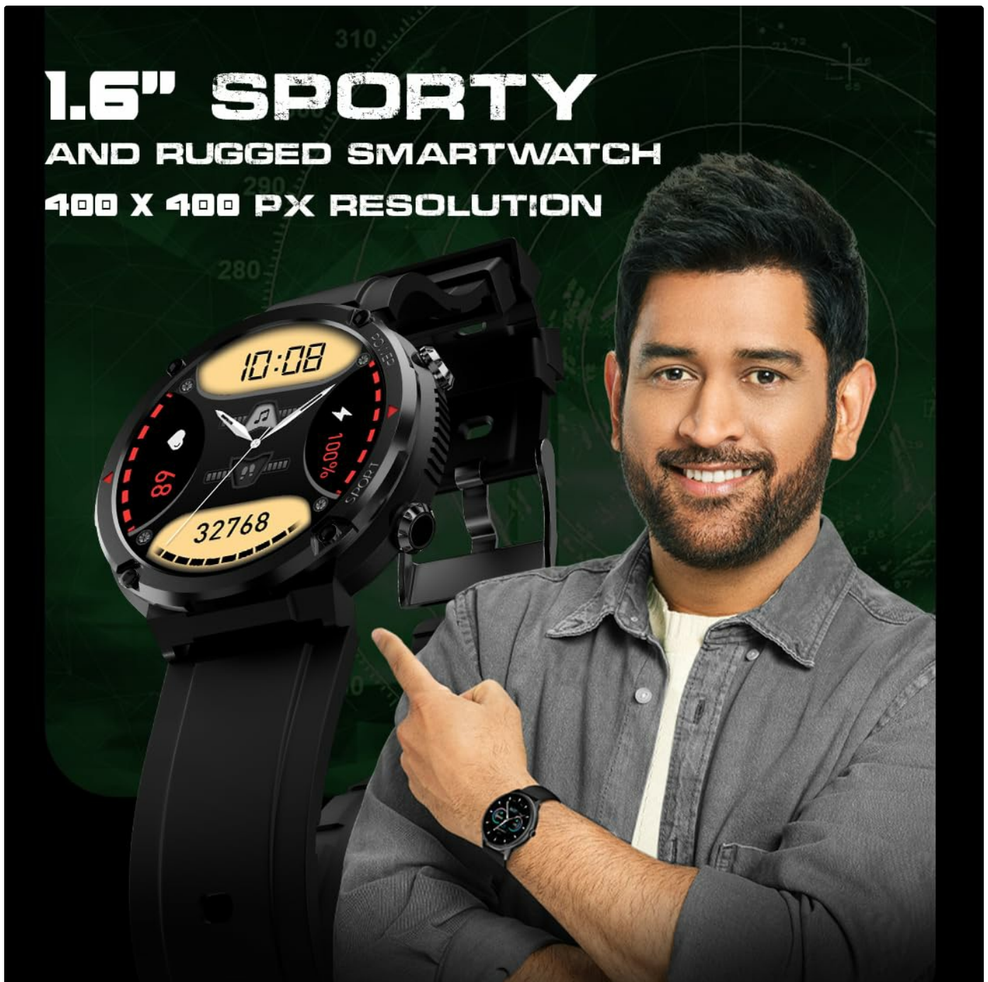
Figure 2.1: Quick View of Display and Bluetooth Calling. This image illustrates the smartwatch's high-resolution display specifications and its capability for Bluetooth calls, demonstrating key operational features.