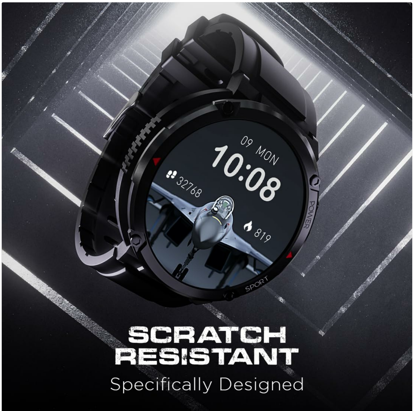
Figure 3.3: Scratch Resistant Display. This image illustrates the scratch-resistant quality of the smartwatch's display, ensuring long-term clarity and protection for the screen.