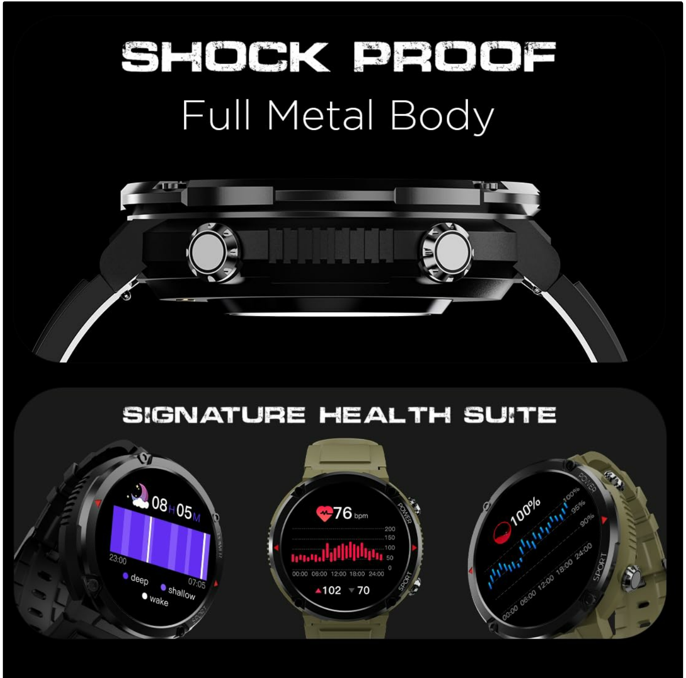
Figure 3.1: IP68 Water Resistance. This image visually confirms the smartwatch's IP68 rating, demonstrating its resistance to water, which is crucial for outdoor and active use.

The Fire-Boltt Sphere is rated IP68, meaning it is resistant to dust and can withstand immersion in water up to 1.5 meters for 30 minutes. While it offers robust protection, avoid prolonged exposure to water, hot water, or steam. It is not suitable for diving or high-pressure water activities.