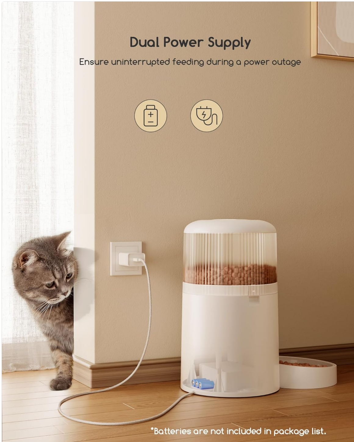
Image: The pet feeder connected to a wall outlet, illustrating its dual power supply capability with an icon for battery backup.