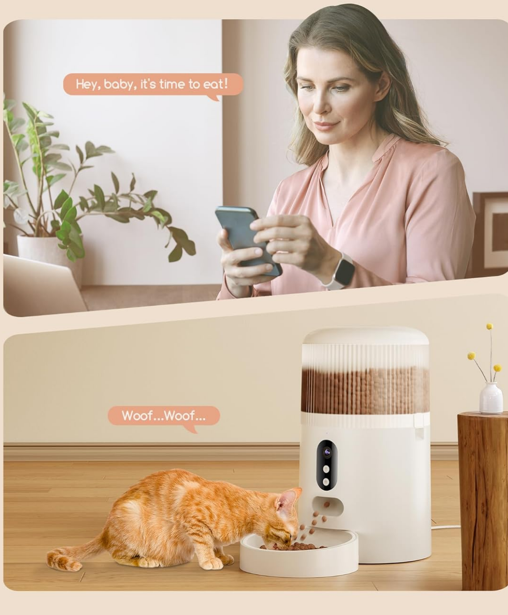
Image: A woman speaking into her phone, with a thought bubble "Hey, baby, it's time to eat!", and a cat at the feeder with a "Woof...Woof..." thought bubble, illustrating the two-way audio feature.