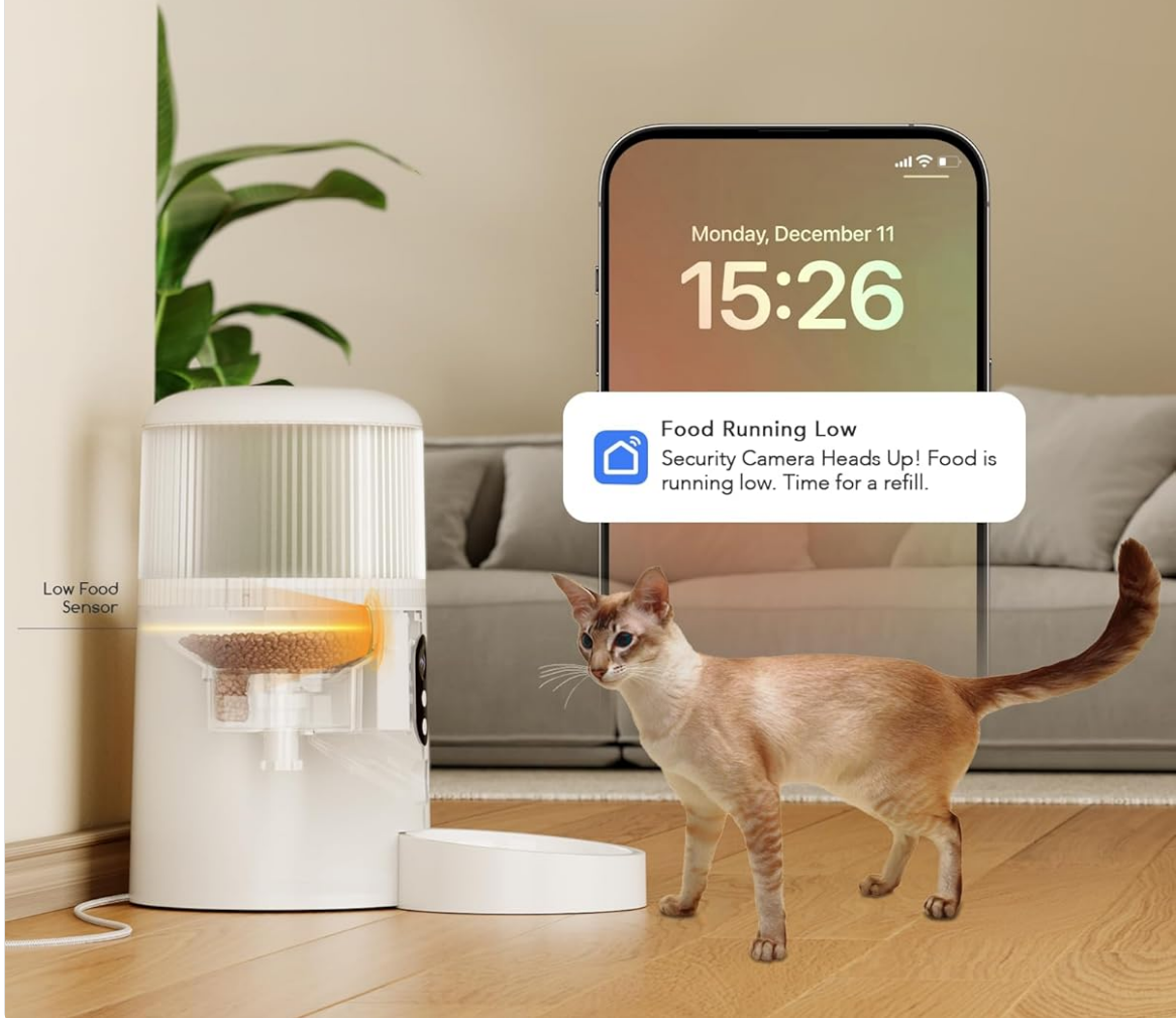
Image: A smartphone showing pop-up notifications for "Food Running Low" and "Security Camera Heads Up!", with a cat next to the feeder.