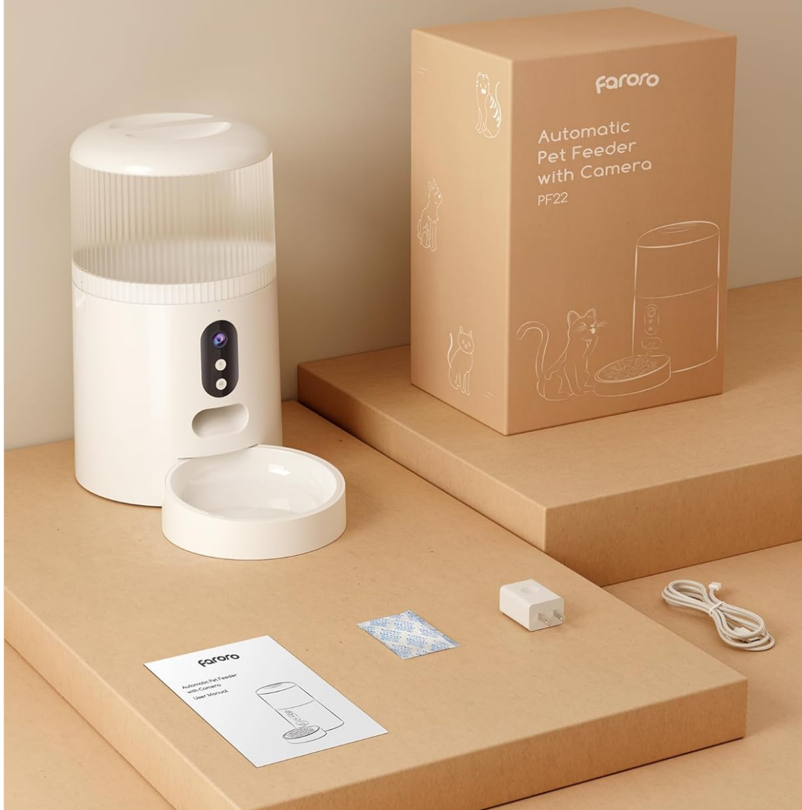
Image: The Faroro Automatic Pet Feeder, its packaging box, power adapter, USB cable, user manual, and desiccant bag, illustrating the complete package contents.