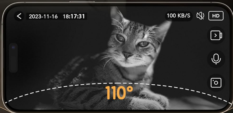
Image: A smartphone screen showing a cat in black and white night vision mode, with a 110° wide-angle view, demonstrating the feeder's night vision capability.