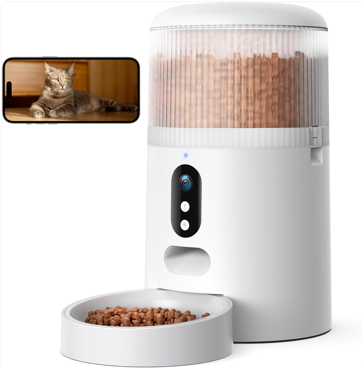
Image: The Faroro Automatic Pet Feeder, showing its sleek white design, transparent food reservoir, camera, and feeding bowl. A smartphone screen displaying a cat is superimposed next to the feeder.