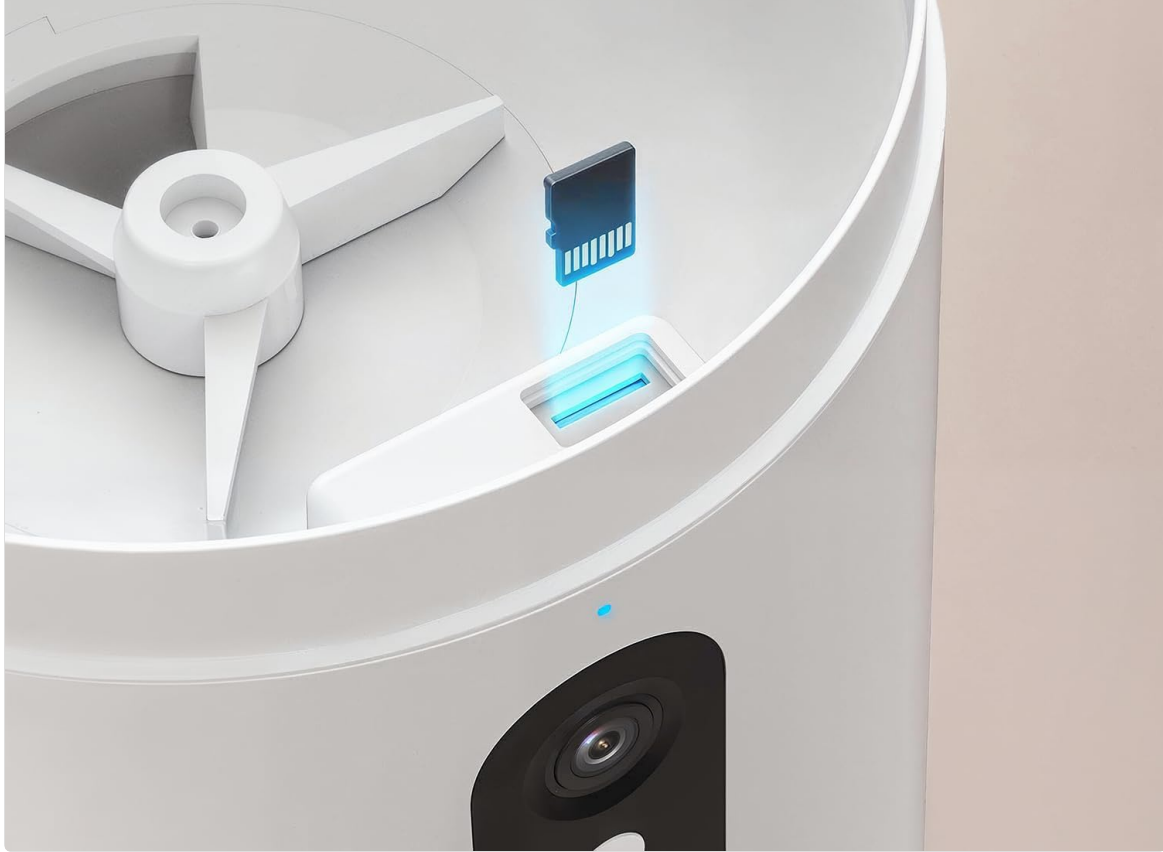
Image: A close-up view of the inside of the feeder, highlighting the MicroSD card slot.

Note: Supports MicroSD cards of Class 10 or higher, ranging from 8GB to 256GB.