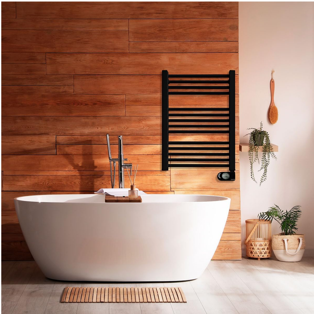
Image: The HJM Noor 500 Towel Warmer, black, mounted on a wooden wall in a bathroom setting, next to a white bathtub.