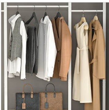
Heavy Duty Metal Frame: Ensures structural integrity and durability.