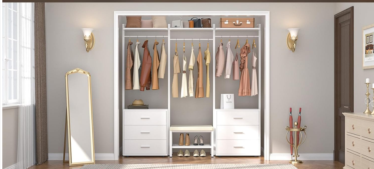
Figure 6: Adjustable width configurations of the closet organizer.

Maximum Closet Width: 95.8in. / Minimum Closet Width:68.7in. ( left/right shelves can be installed on one side or trimmed )