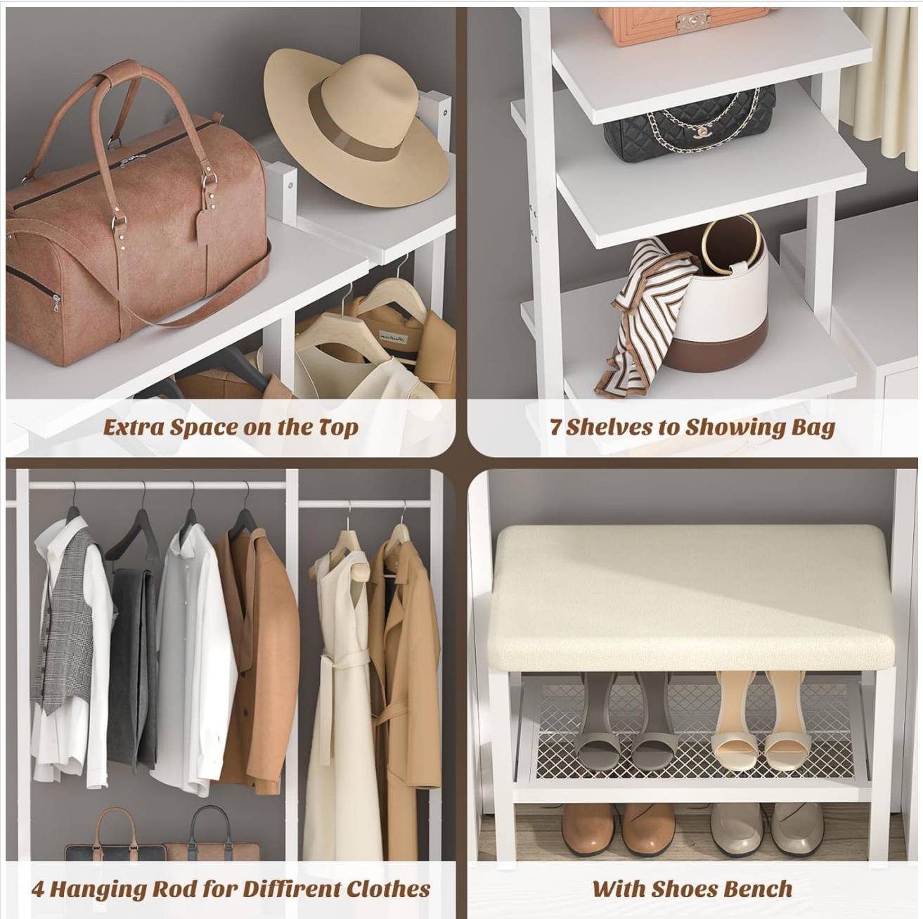
Figure 4: Detailed features including top storage, display shelves, hanging rods, and shoe bench.