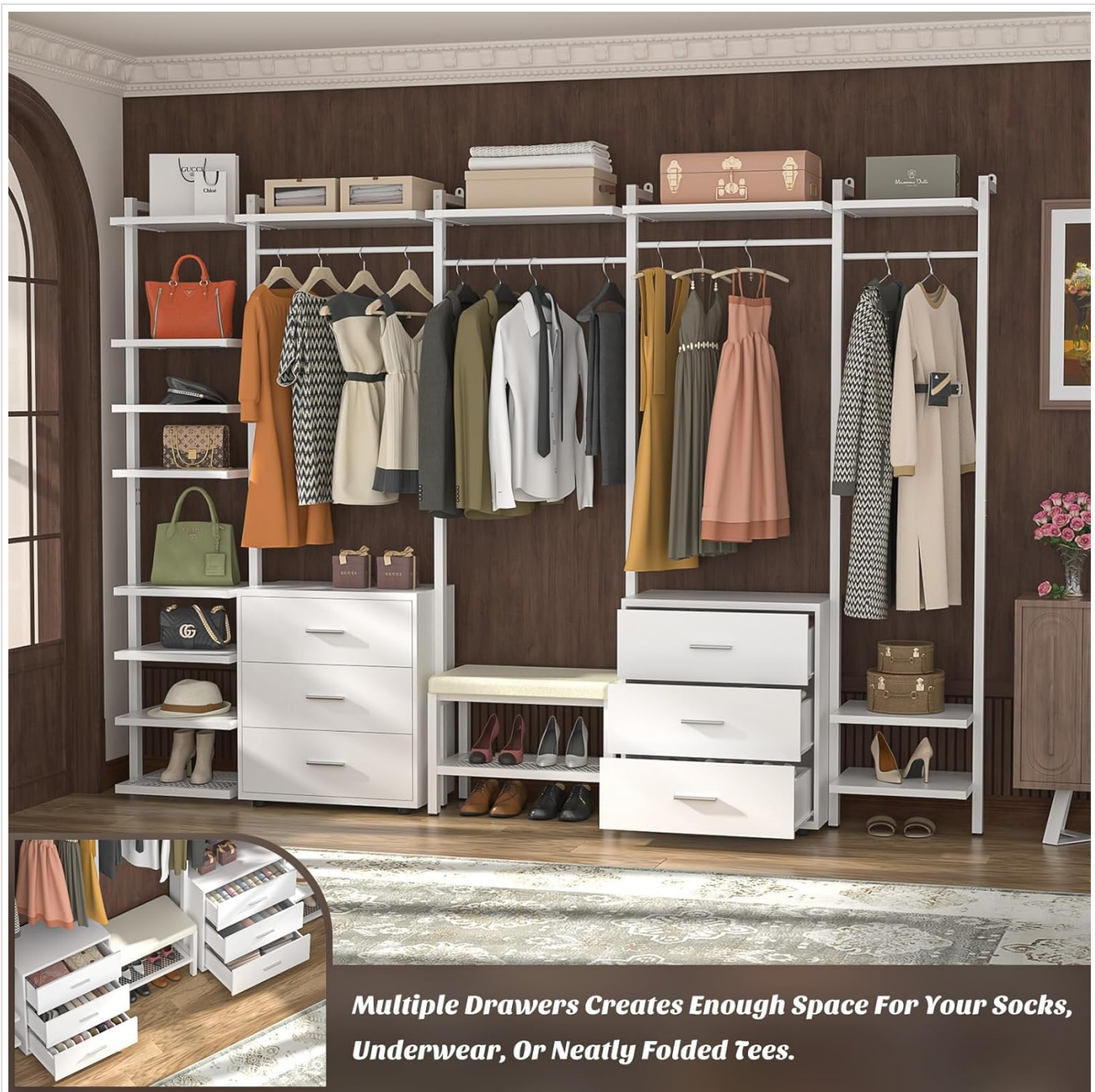
Figure 3: The closet organizer integrated into a room, demonstrating its storage capabilities.

If you encounter any difficulties or missing parts, please contact customer support.