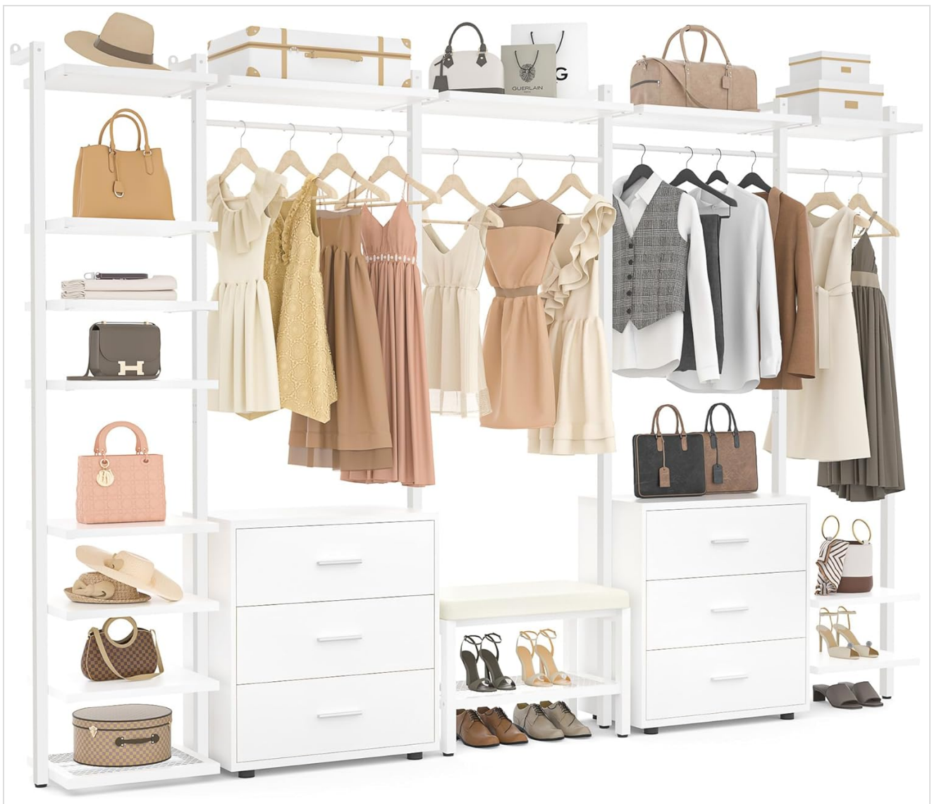
Figure 1: Fully assembled Aheaplus 8FT Closet Organizer.