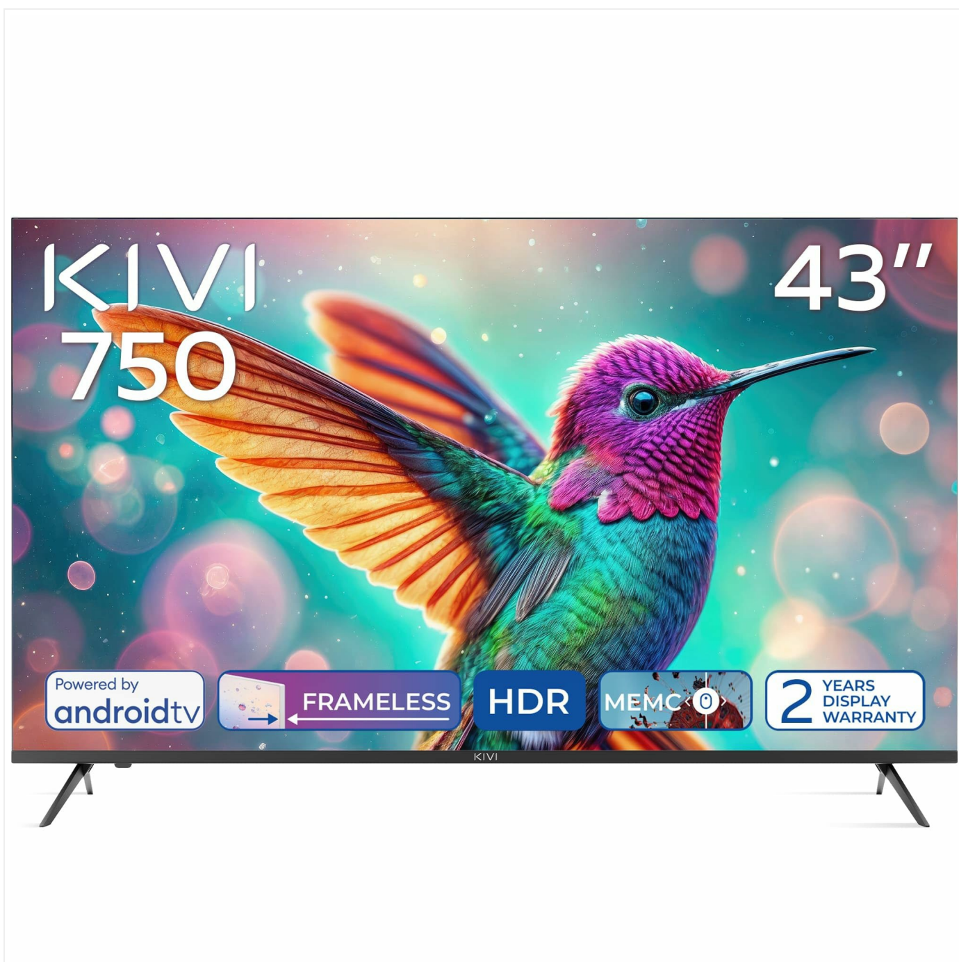
Front view of the KIVI 43U750NB 43-inch UHD 4K Smart TV.