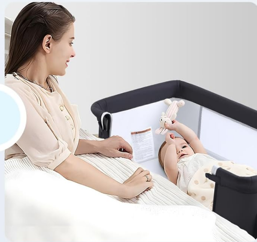
Figure 5.3: Bassinet and Bedside Sleeper configurations.