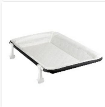
Figure 5.5: Detailed view of the changing pad.