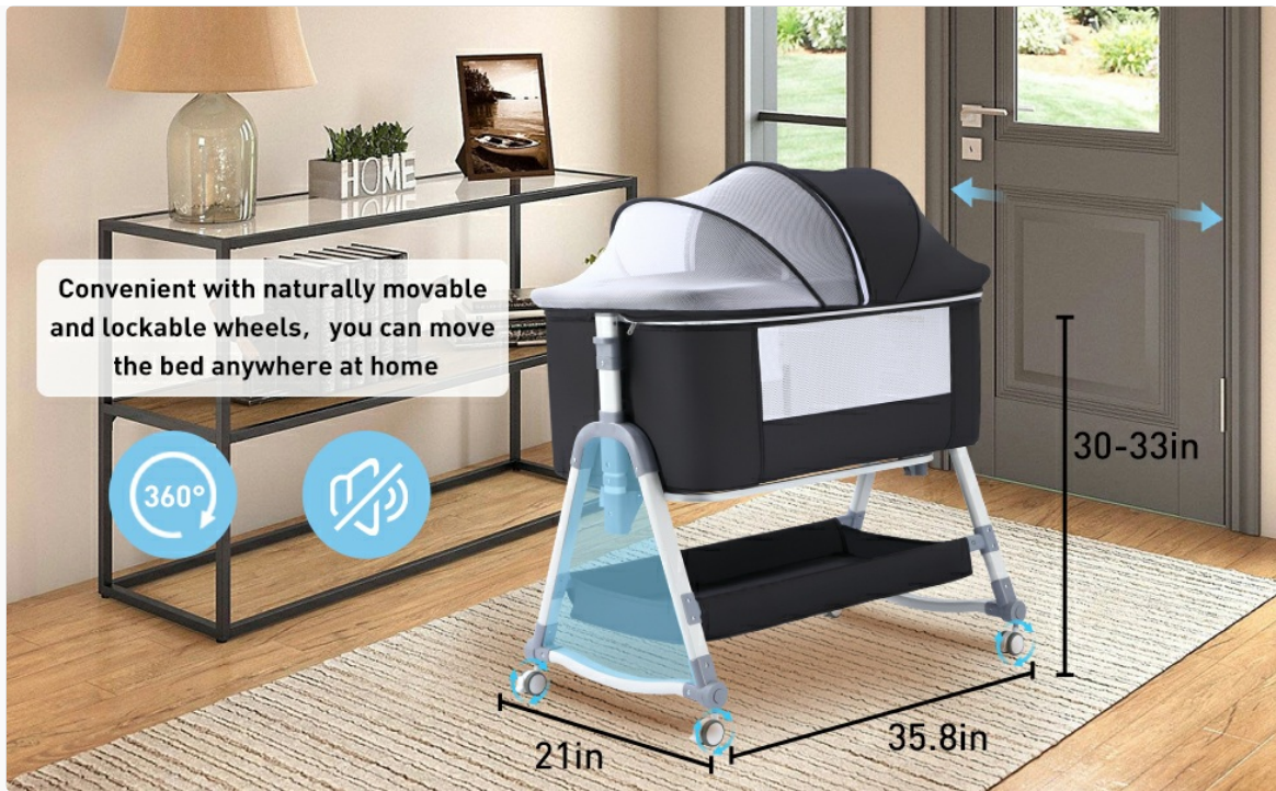
Figure 5.7: Portability with movable and lockable wheels.