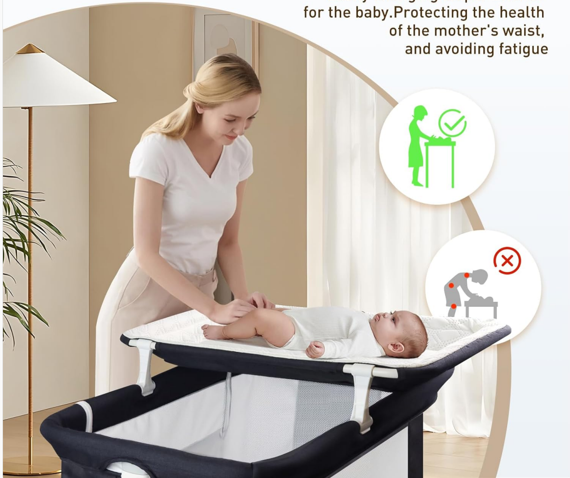
Figure 5.4: Using the integrated Changing Table for convenience.

Easily changing diaper clothes for the baby. Protecting the health of the mother's waist, and avoiding fatigue