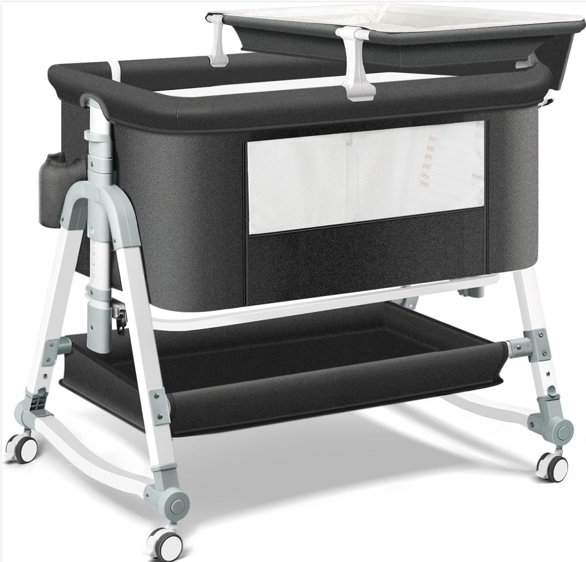
Figure 5.1: Bassinet with Mosquito Net, offering a protected sleeping environment.

This mode provides a secure and enclosed sleeping space for your baby, protecting them from insects with the integrated mosquito net. The main image shows the bassinet in this configuration.