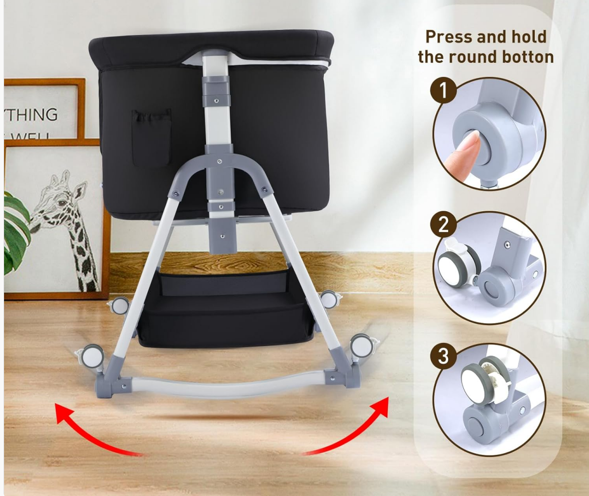
Figure 5.6: Converting to Cradle Mode for gentle rocking.