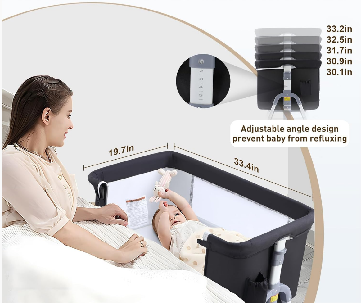
Figure 5.2: Bedside Sleeper mode demonstrating height adjustability for seamless co-sleeping.