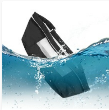
Figure 6.2: Convenient large storage basket for baby essentials.