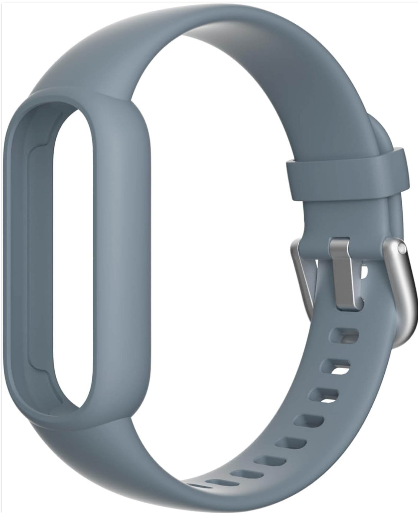
Image 1: TOOBUR Replacement Strap. This image displays the TOOBUR replacement strap, designed for the A200/Band 8 activity tracker. The strap is made of flexible silicone, featuring a classic buckle closure and multiple adjustment holes for a secure fit. The color shown is a blue-grey.