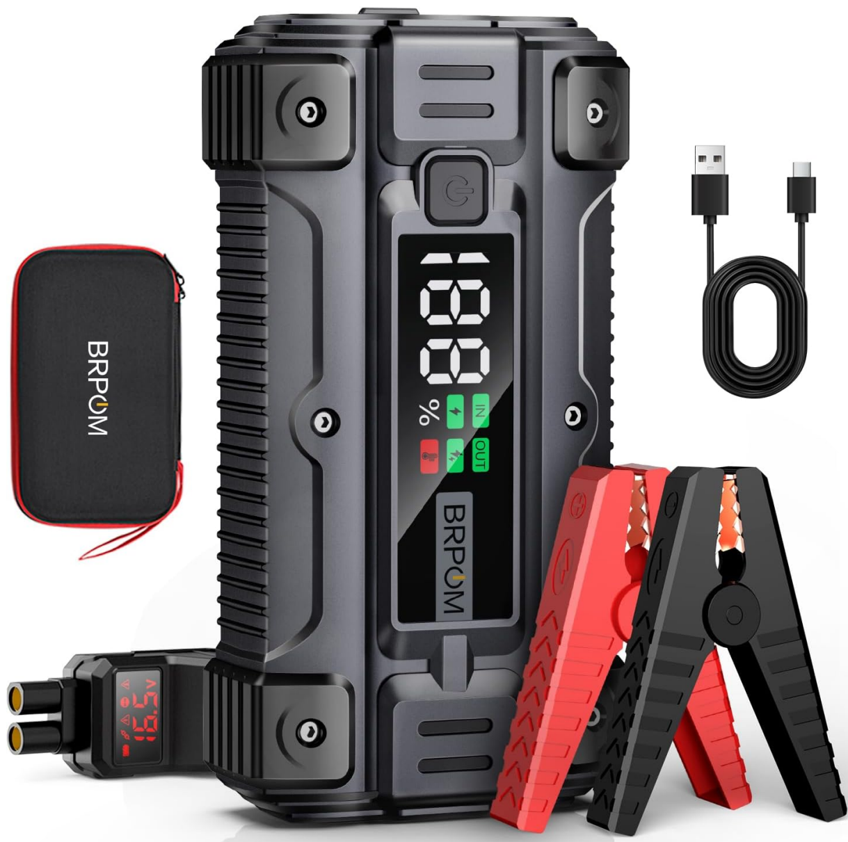
This image displays the BRPOM BM502 jump starter unit, its smart jumper cables (red and black clamps), a USB charging cable, and a black zippered carrying case, showcasing the complete product package.