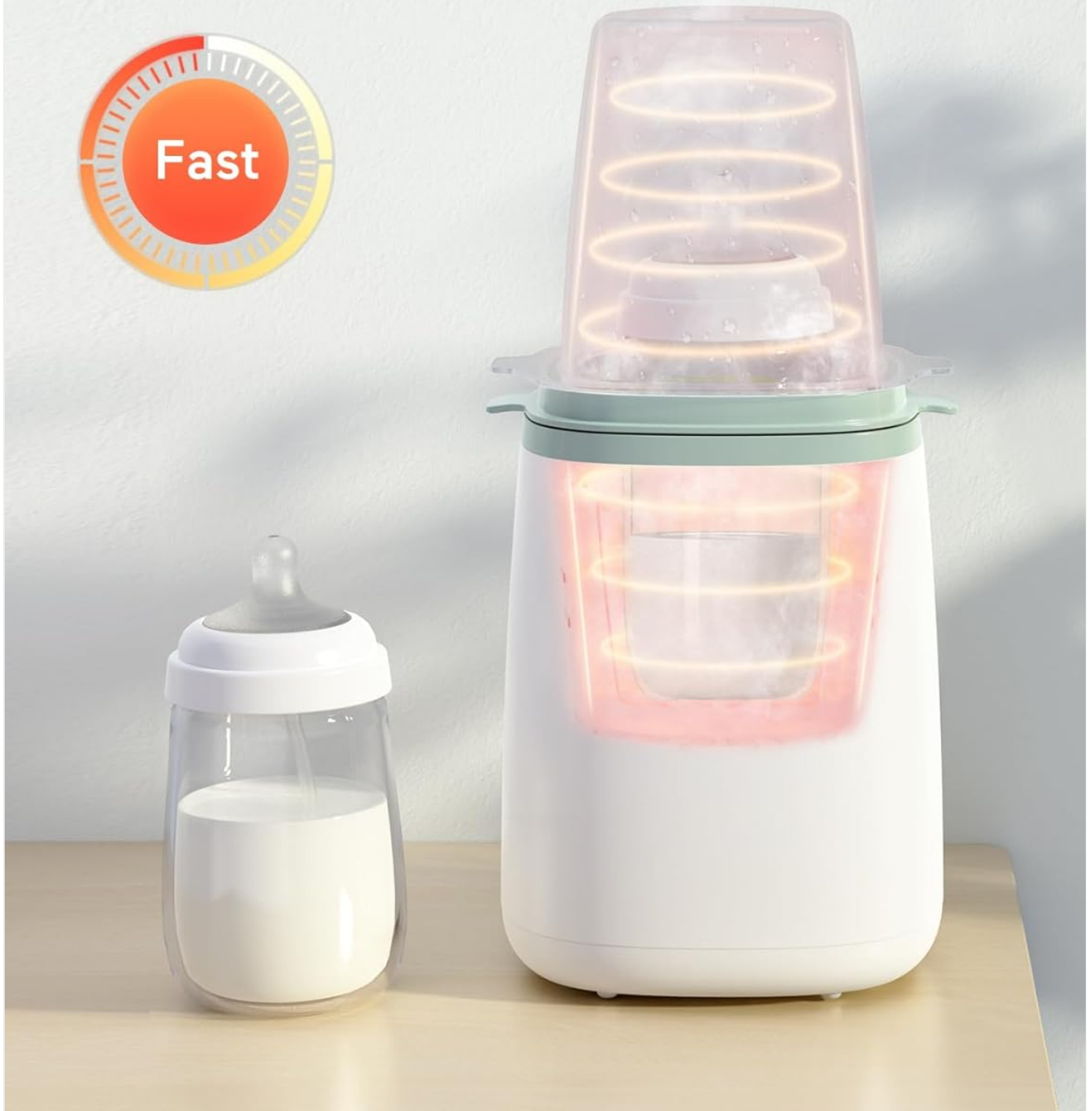
Image: The Momcozy Bottle Warmer with a baby bottle inside, illustrating its fast warming capability, indicated by a "Fast" graphic and heat lines.