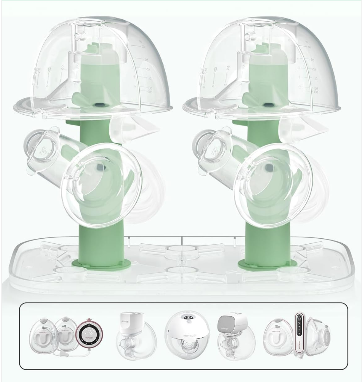
Image: Close-up view of the Momcozy 3-Layer Bottle Sterilizer and Dryer showing specialized holders designed for breast pump parts, ensuring efficient sterilization and drying.

Help sterilize and dry pump accessories more efficiently