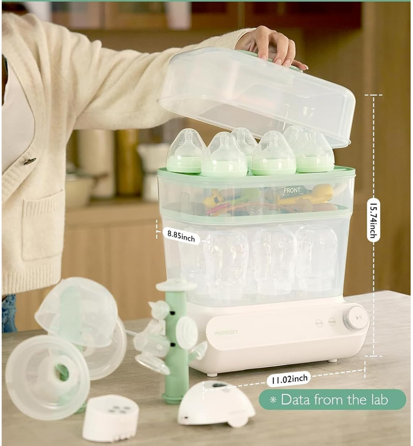
Image: The Momcozy 3-Layer Bottle Sterilizer and Dryer, illustrating its large capacity and dimensions (15.74 inches height, 8.85 inches width, 11.02 inches depth). It shows multiple bottles and accessories placed within its three layers.