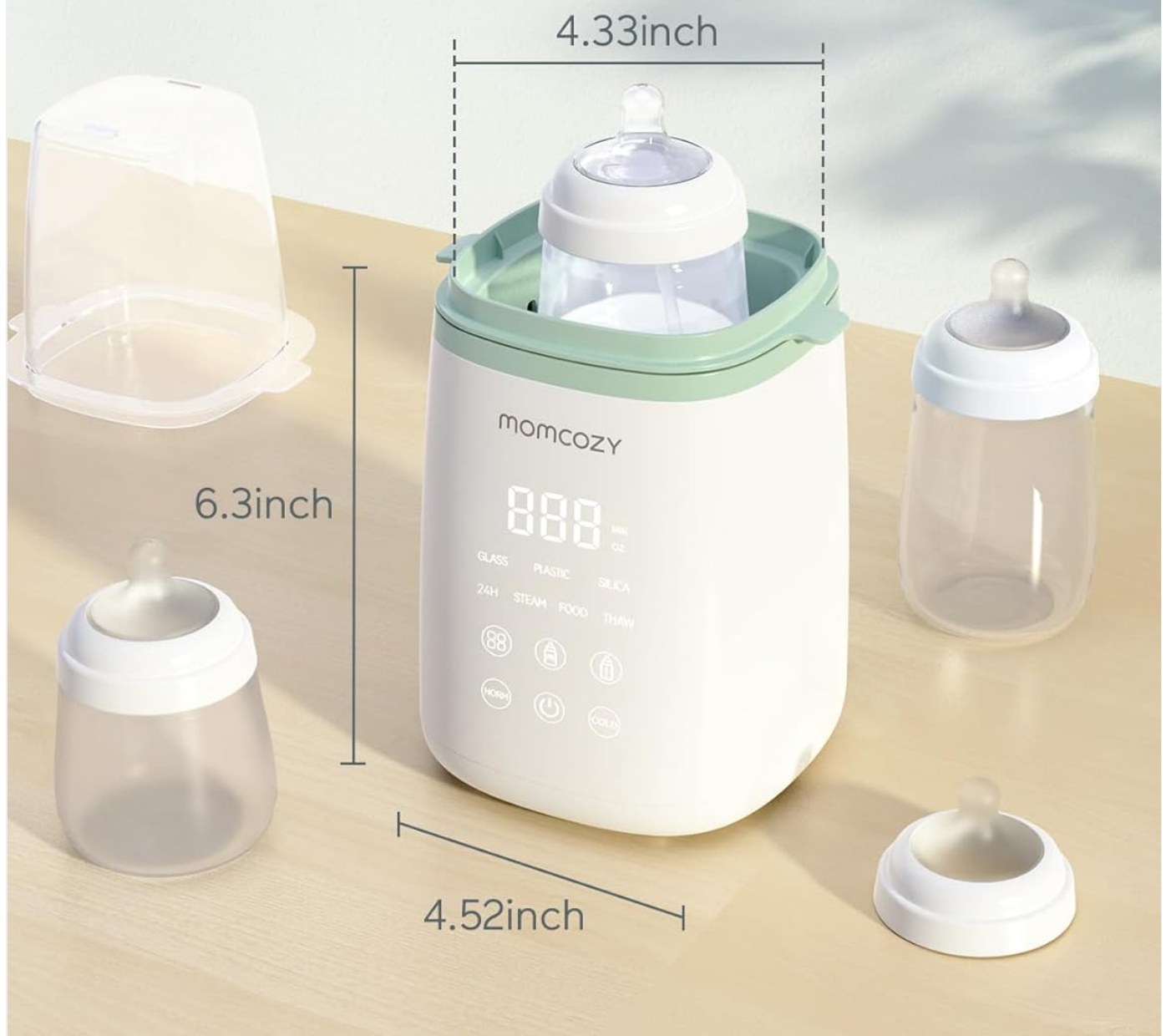
Image: The Momcozy Bottle Warmer displaying its multifunctionality, including Fast Warming, Thaw, Food Heating, Steaming, Intelligent Timer, Capacity Option, Material Option, Anti-Scald Basket, 24hrs Keep-Warm, and Memory Function. Dimensions are also shown (6.3 inches height, 4.52 inches width).