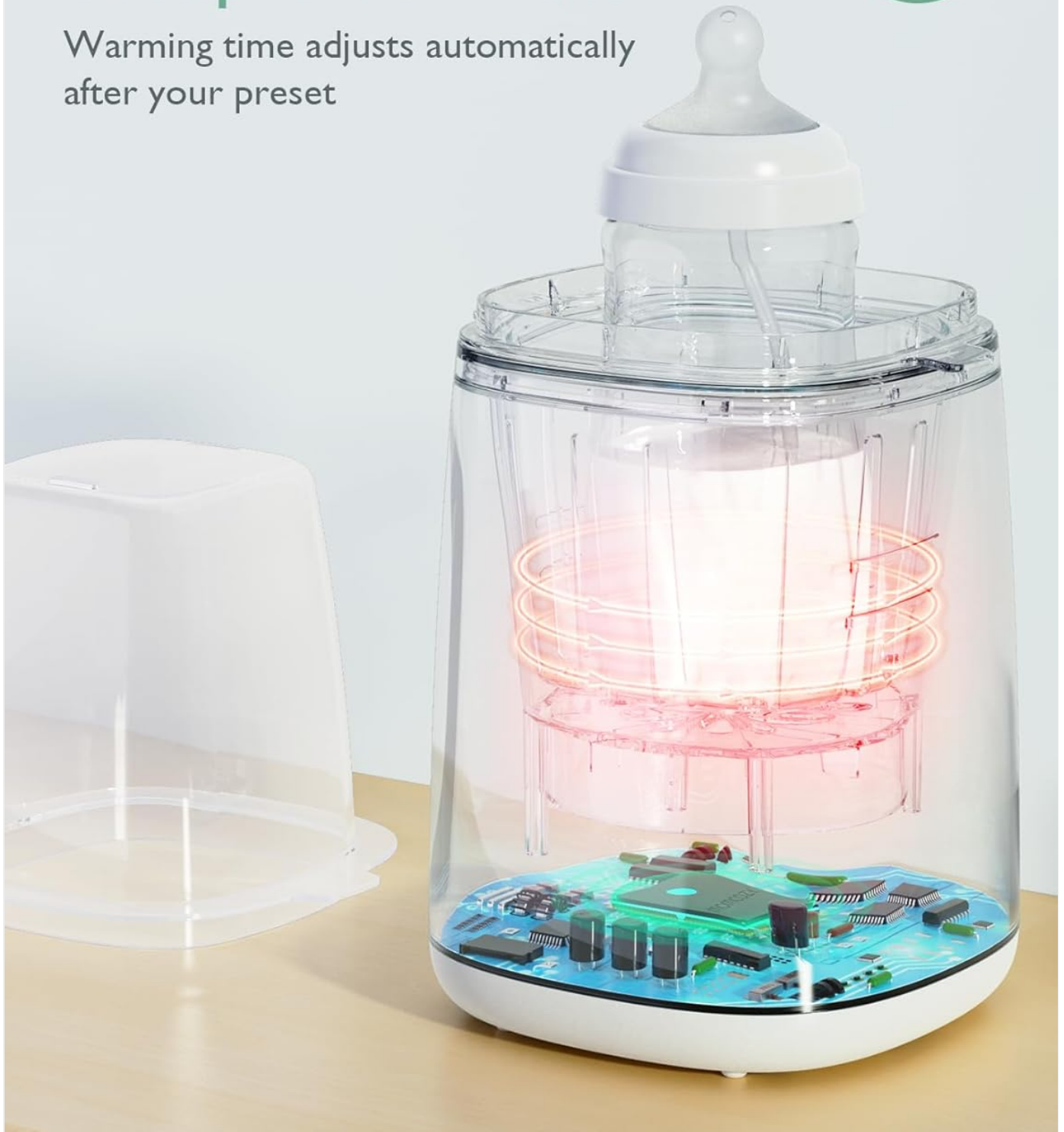
Image: A transparent view of the Momcozy Bottle Warmer, highlighting its intelligent heating design and internal components that ensure precise temperature control for warming.

Warming time adjusts automatically after your preset