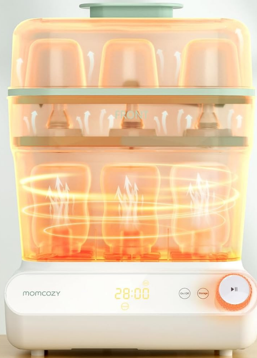
Image: The Momcozy 3-Layer Bottle Sterilizer and Dryer illustrating its 360-degree full circle drying function, with warm air circulating around bottles and accessories. The display shows "28:00".