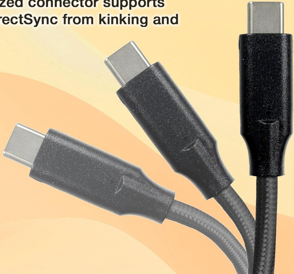
Image: An illustration demonstrating the reinforced strain relief design at the cable's connectors, which helps prevent damage from bending.

Rubberized connector supports keep DirectSync from kinking and tearing.