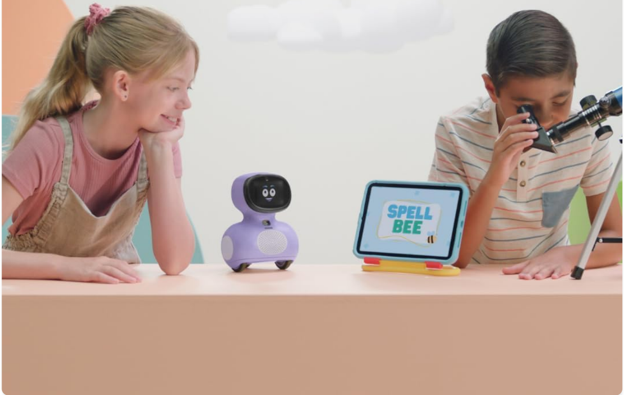
Image: Children engaging with Miko Mini and the Spell Bee App on a tablet, highlighting educational interaction.