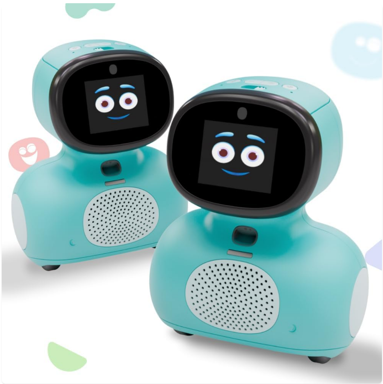
Image: Two Miko Mini robots, showcasing their design and friendly digital faces.