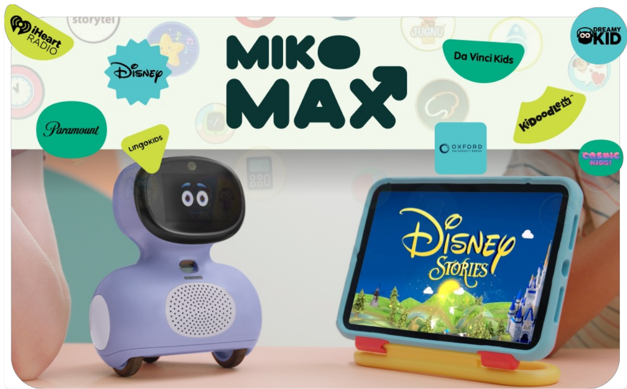
Image: Miko Mini showcasing integration with Miko Max content, including Disney Stories and other educational apps.