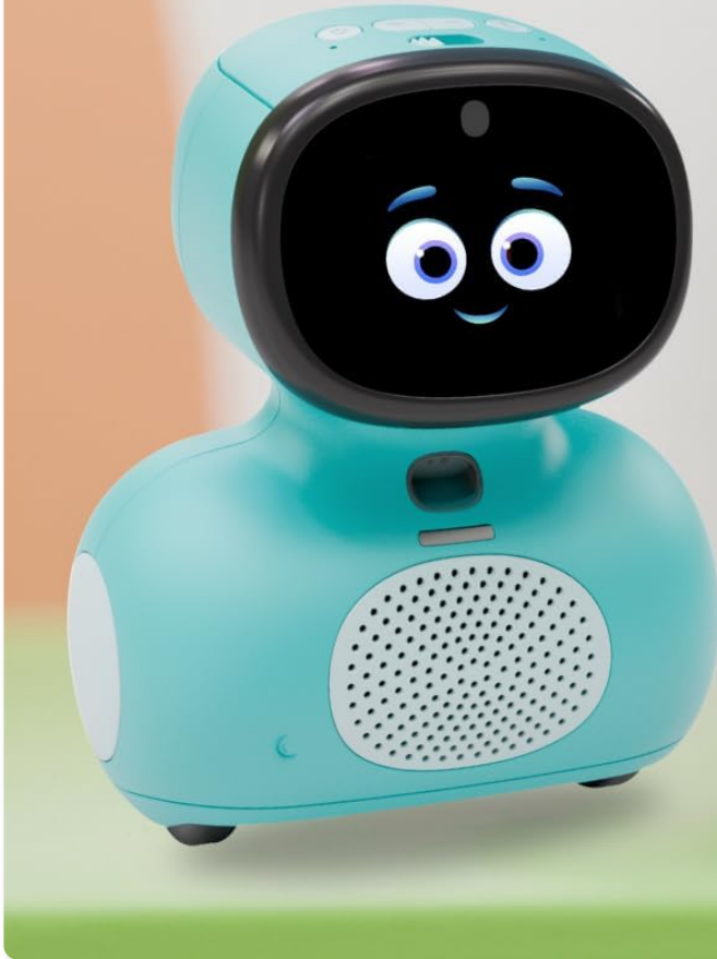
Image: Miko Mini highlighting its secure, ad-free, and closed internet access environment.