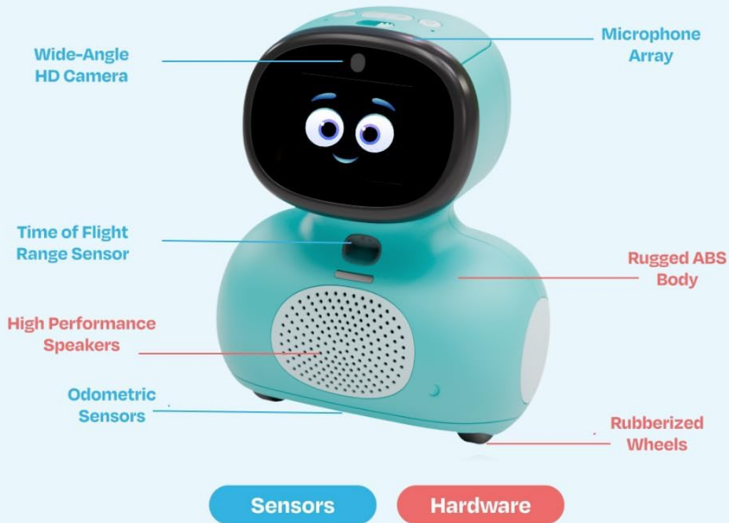
Image: Detailed view of Miko Mini's hardware and sensor components.