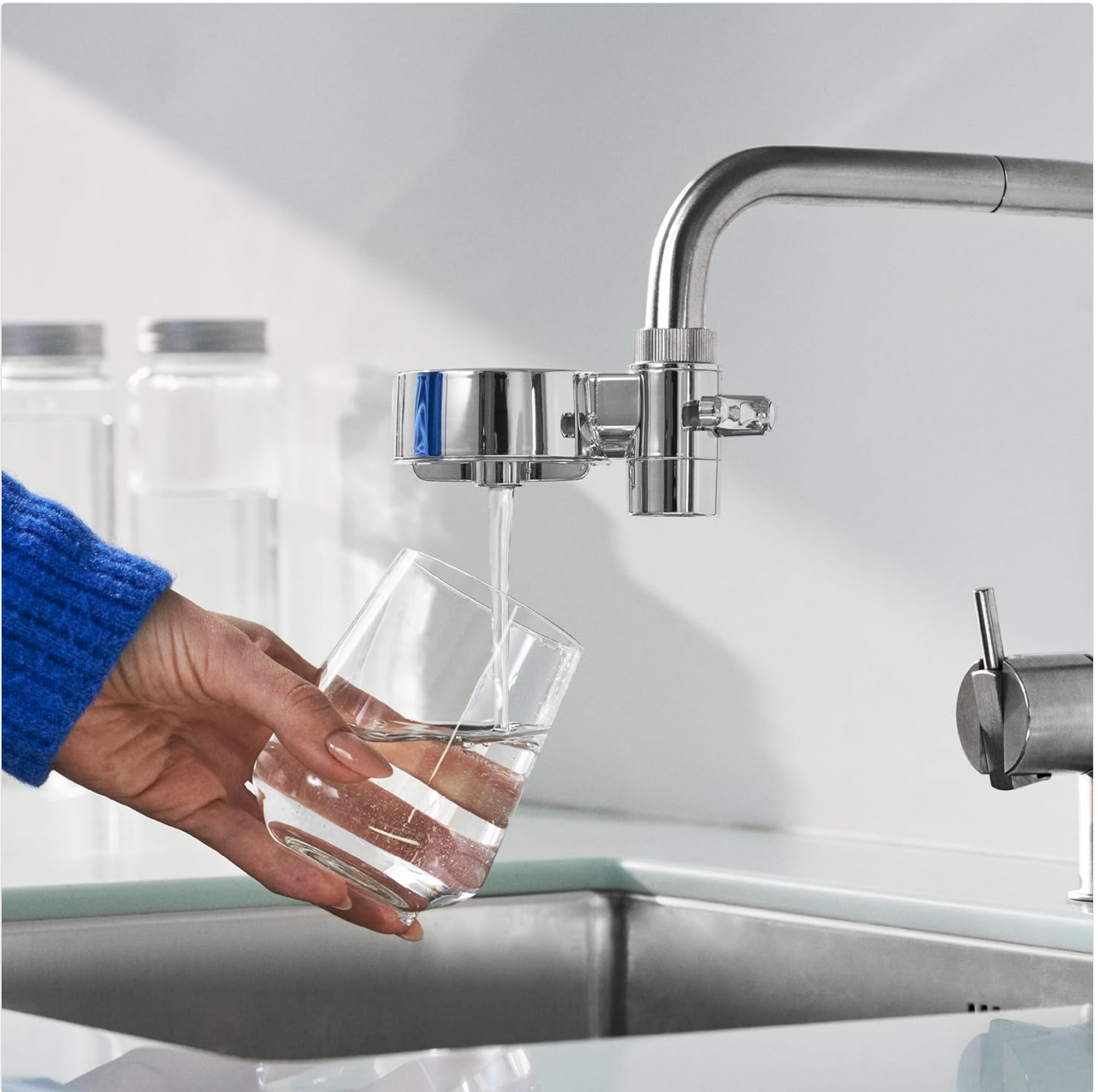
Image: A hand holding a glass under the faucet, collecting filtered water.