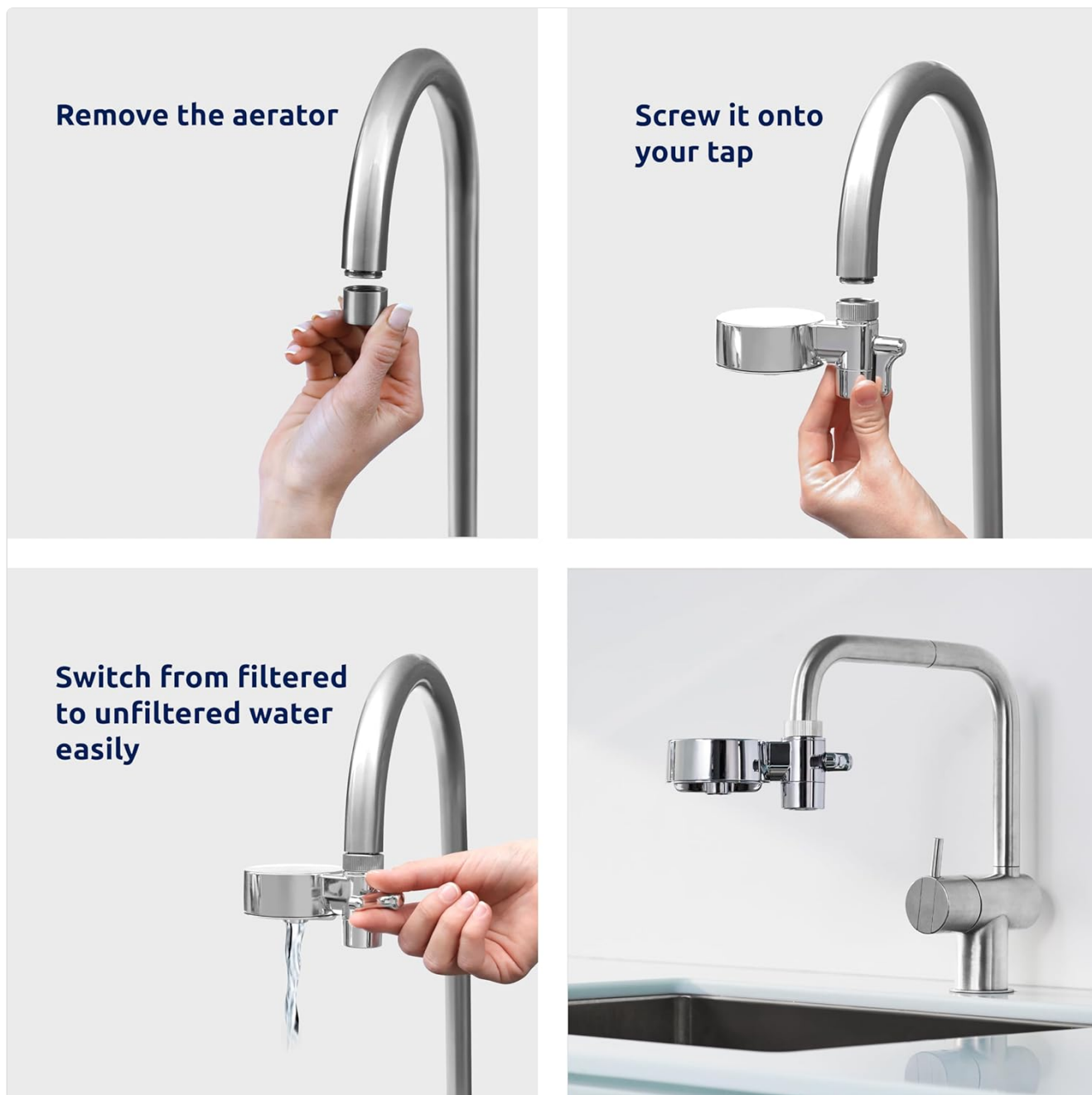
Image: Visual guide showing how to remove the aerator and screw the filter onto the tap.

Video: A detailed demonstration of how to install the Tapp Water EcoPro Compact filter on a kitchen faucet.