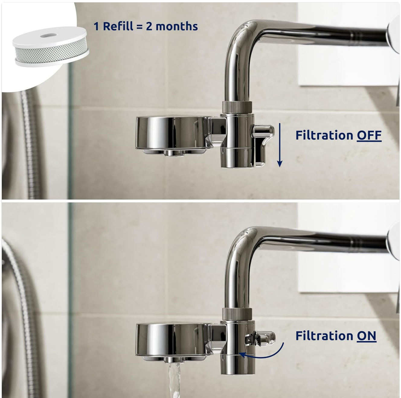
Image: Demonstrates the lever to switch between filtered (ON) and unfiltered (OFF) water flow.

'OFF' position. Water will bypass the filter.