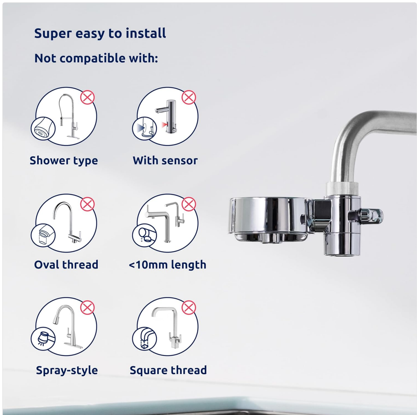
Image: Visual guide showing faucet types that are not compatible with the EcoPro Compact filter.

For further assistance, please refer to the Warranty and Support section.