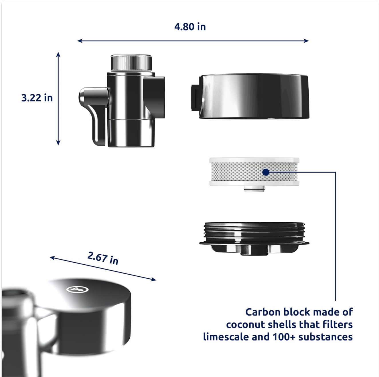
Image: Exploded view showing the filter components, including the carbon block cartridge made from coconut shells.