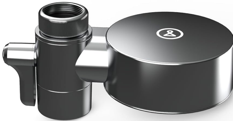
Image: The Tappwater EcoPro Compact filter in chrome finish.

Video: An overview of the Tappwater EcoPro Compact faucet filter, highlighting its benefits for clean water and environmental impact.