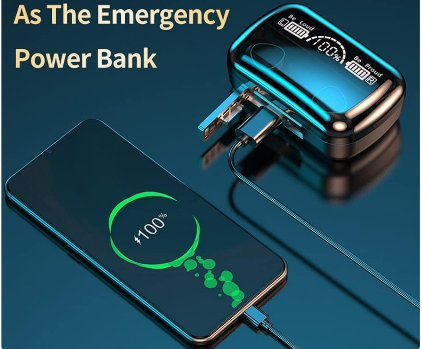
Figure 3.3: The charging case connected via USB-C to a smartphone, demonstrating its capability to function as an emergency power bank for other devices.