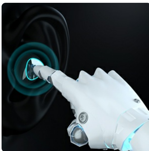
Figure 5.2: An illustration depicting the touch-sensitive area on the earbud, highlighting the ease of interaction for control commands.