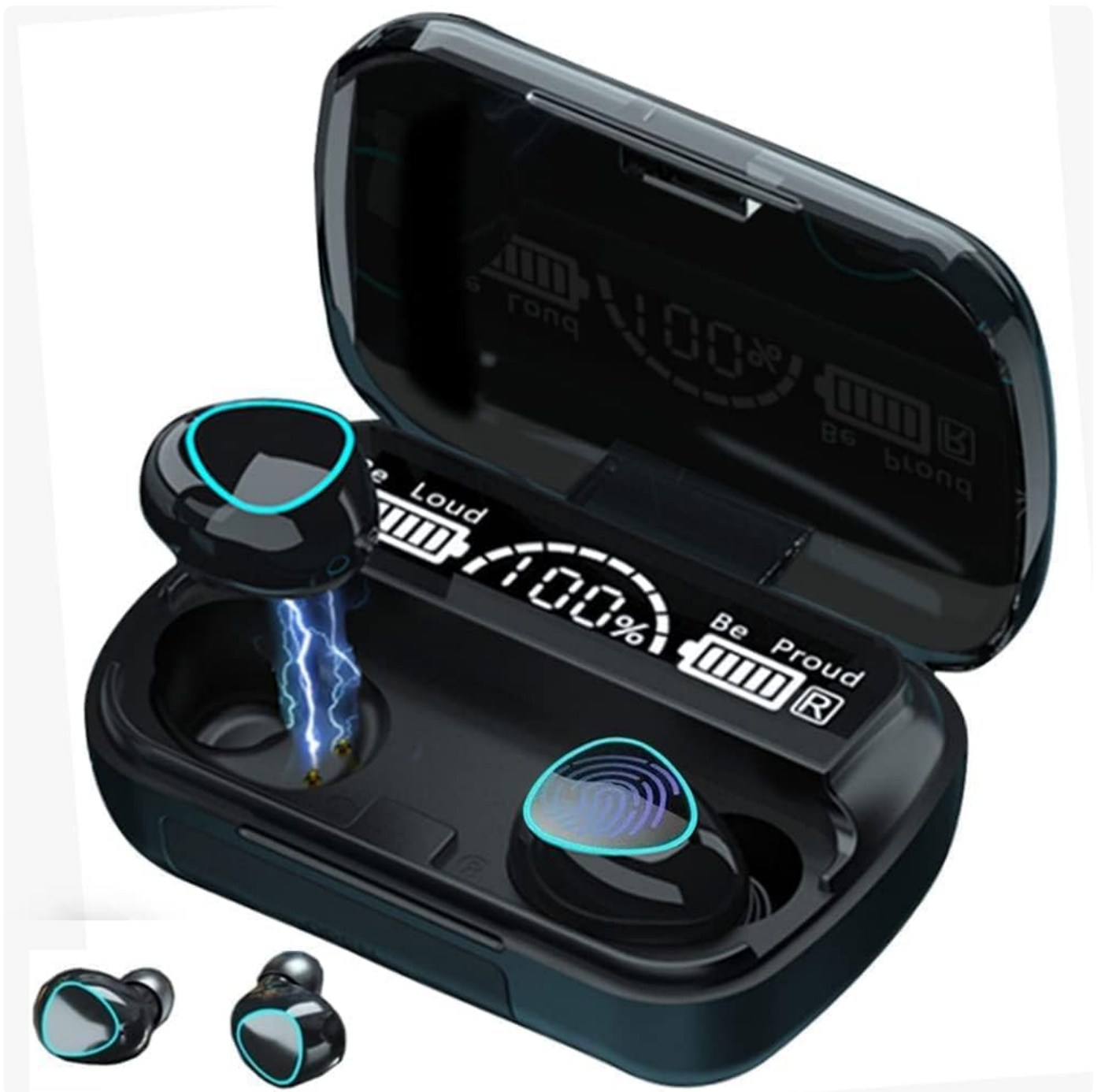
Figure 3.1: NIUTA Wireless Earbuds in their charging case. The case features a digital LED display showing battery percentages for both the case and individual earbuds.