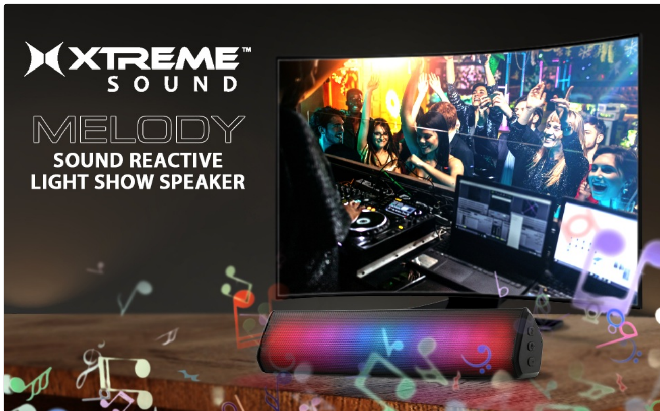
Image 1.1: The XTREME XBS9-1068-BLK speaker, designed to complement various entertainment setups.

Thank you for purchasing the XTREME XBS9-1068-BLK Wireless Bluetooth Rechargeable Multi-Color LED Light Sound Bar Speaker. This device combines high-quality audio with dynamic LED lighting to enhance your listening experience. It features Bluetooth connectivity for wireless audio streaming, a built-in rechargeable battery for portability, and an auxiliary input for wired connections. Please read this manual thoroughly to ensure proper use and care of your speaker.