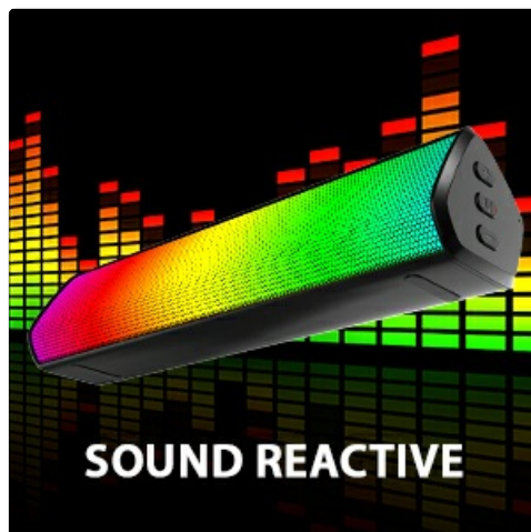
Image 6.1: The speaker's sound-reactive LED lights creating a visual display.

The XBS9-1068-BLK speaker features multi-color LED lights that are sound-reactive, meaning they will flash and change patterns in sync with your music. This creates a dynamic visual experience.