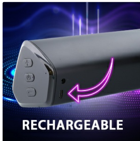
Image 5.1: Illustration of the rechargeable feature, showing the charging port.