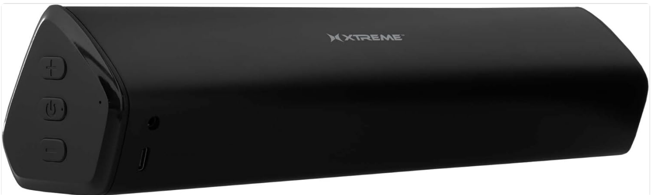
Image 4.2: Rear view of the speaker, detailing the Micro USB charging port and AUX input.

For a visual demonstration of the speaker's features, you may refer to this product video .