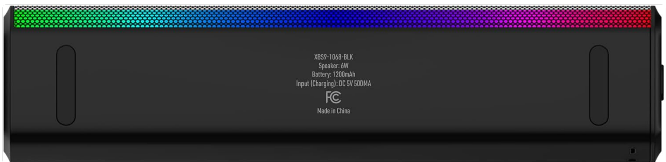
Image 3.1: The XTREME XBS9-1068-BLK speaker and its packaging, indicating included accessories.