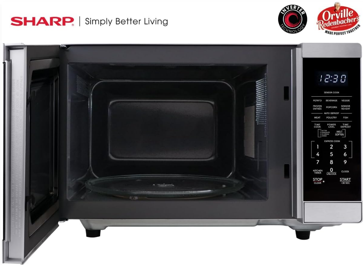
Image 3.3: Interior view showing the removable 12.4-inch Carousel turntable.

Place the roller stay in the center of the microwave cavity. Ensure it is properly aligned. Then, place the glass turntable plate on top of the roller stay, ensuring it sits securely in the center.