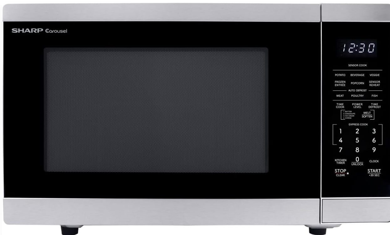
Image 1.1: Front view of the SHARP ZSMC1464KS Countertop Microwave Oven.

The SHARP ZSMC1464KS is a family-sized 1.4 cubic foot, 1100-watt countertop microwave oven designed for reheating and everyday cooking. It features a removable 12.4-inch Carousel turntable for even cooking, one-touch controls, Auto Defrost, and Inverter Cooking Technology for consistent power delivery. This model also includes a Child Lock function for enhanced safety.