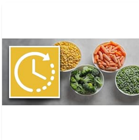
Image 4.3: Frozen foods ready for defrosting using the Auto Defrost feature.

Choose between "Time Defrost" for manual time input or "Auto Defrost" for automatic defrosting based on food type and weight.