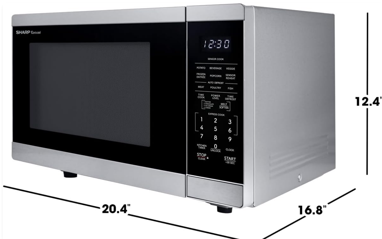
Image 3.1: SHARP ZSMC1464KS Microwave Oven dimensions for proper placement.

Remove all packaging materials and accessories. Inspect the oven for any damage such as dents or a broken door. Do not install if the oven is damaged. Place the microwave oven on a flat, stable surface that can support its weight and the heaviest food item likely to be cooked in it. Ensure adequate ventilation space around the unit.