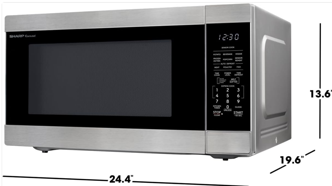
Figure 6.1: Key dimensions of the SHARP Countertop Microwave Oven SMC2266KS.