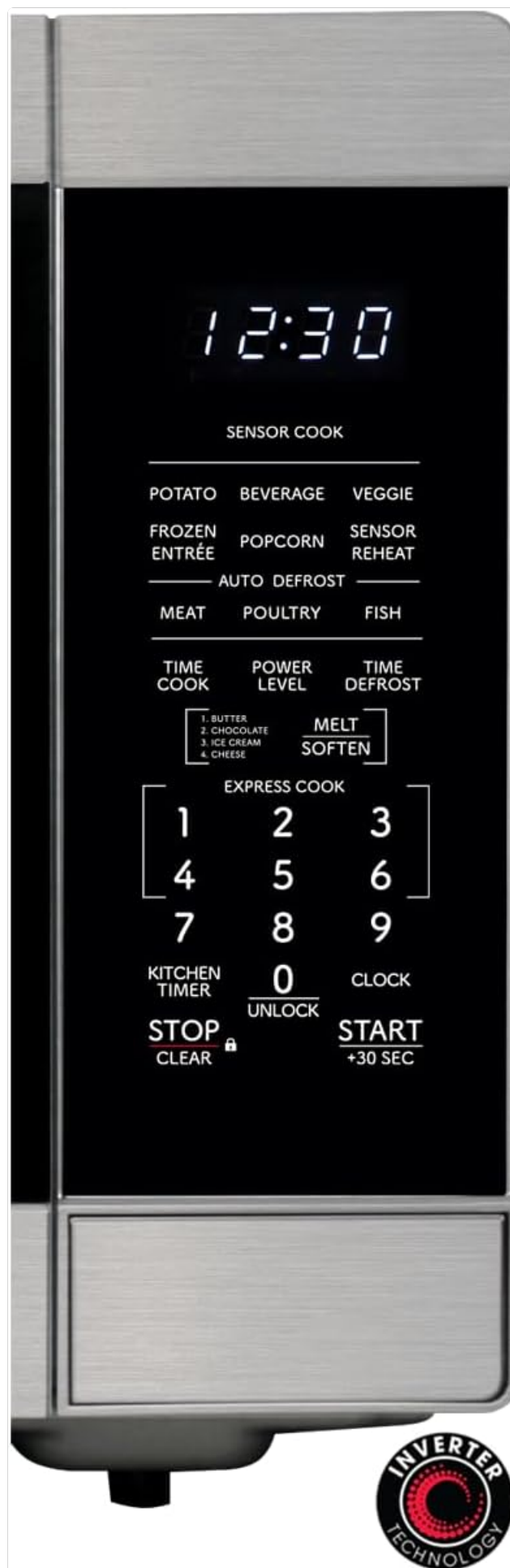
Figure 3.1: Detailed view of the control panel, highlighting the various cooking options and numerical keypad.