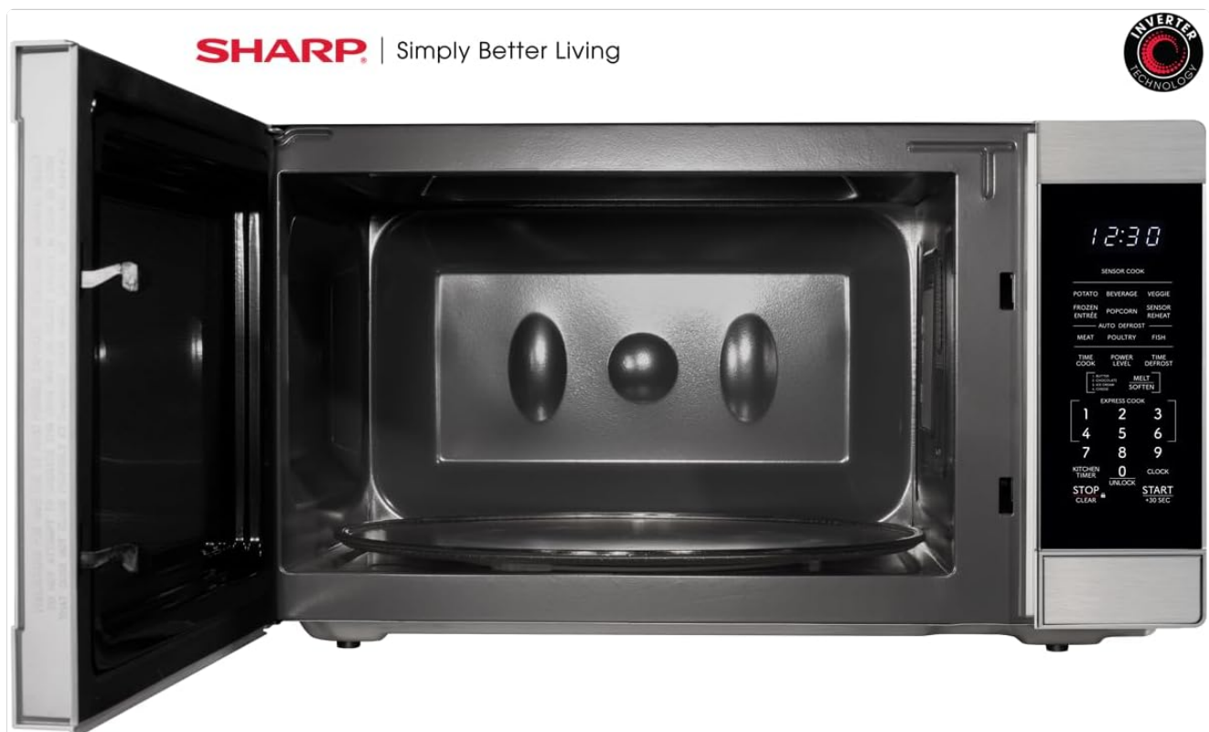
Figure 2.1: Interior of the microwave showing the glass turntable and roller ring correctly installed.

Place the roller ring in the center of the oven cavity. Position the glass turntable securely on top of the roller ring, ensuring it sits correctly on the center hub.