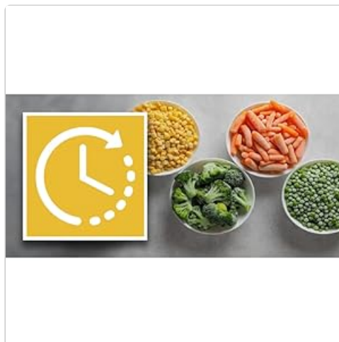
Figure 3.2: Illustration of food items suitable for the Auto Defrost function.