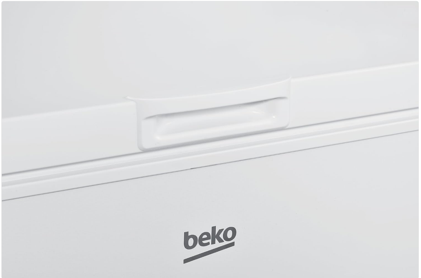
Figure 2: Front angle view of the Beko CF200EWN Horizontal Static Freezer. This perspective helps visualize the overall size and design for placement considerations.