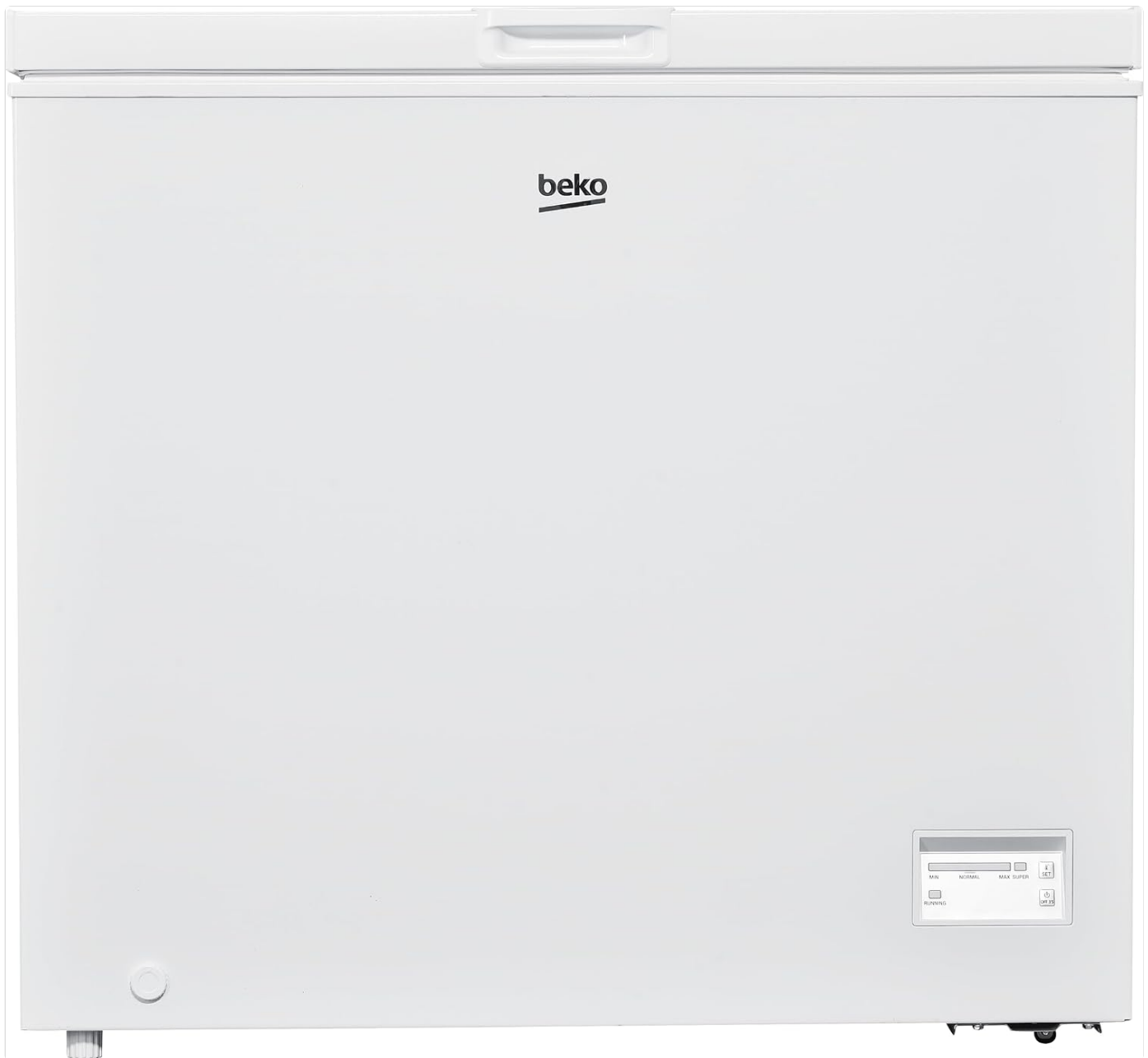
Figure 1: Front view of the Beko CF200EWN Horizontal Static Freezer. This image shows the overall design of the freezer, highlighting its compact and functional form factor.