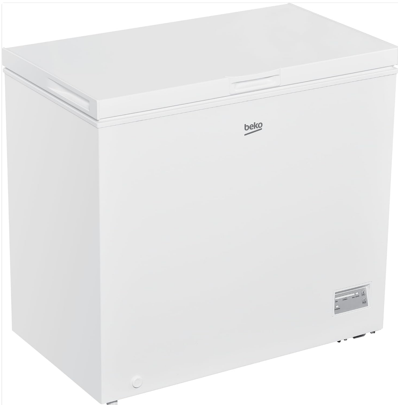
Figure 3: Detailed view of the electronic control panel on the Beko CF200EWN freezer. It features indicators for MIN, NORMAL, MAX, SUPER modes, a RUNNING light, and buttons for SET and OFF/3'S.

The electronic control panel allows you to manage the freezer's temperature settings and monitor its status.