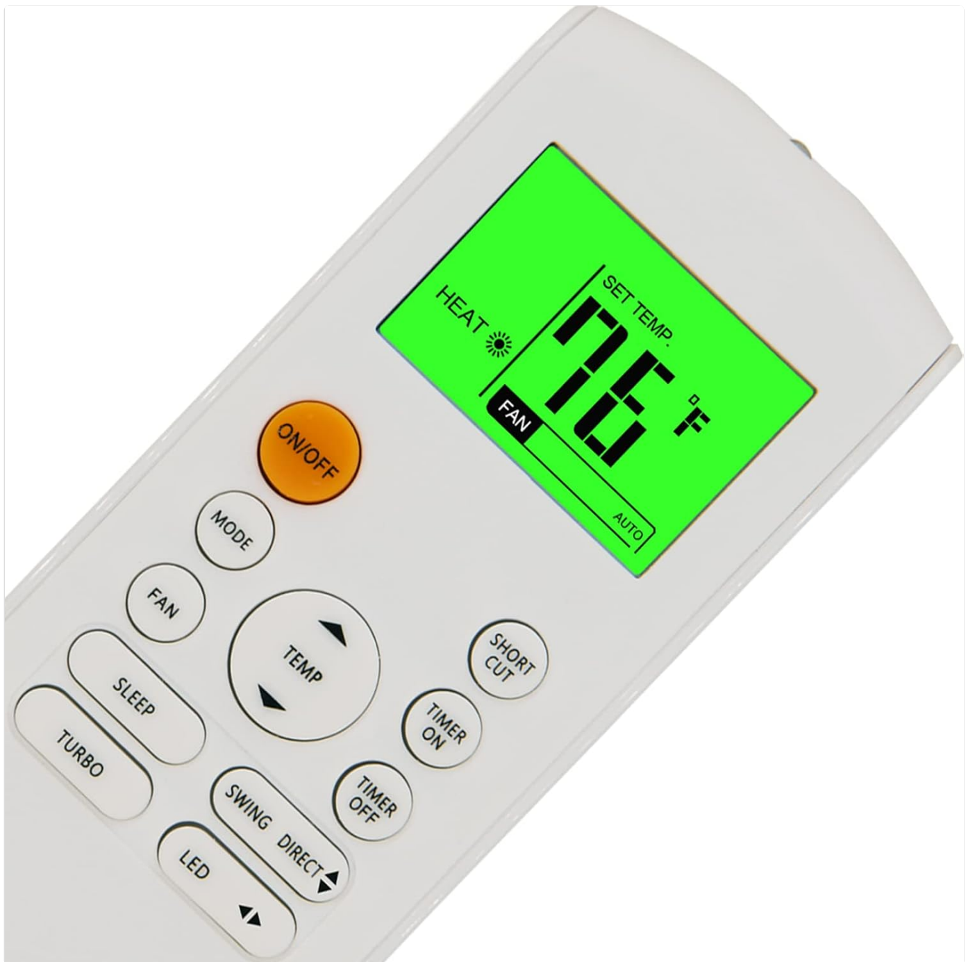
Image 4.1: Front view of the remote control, showing button layout.

Point the remote control directly at the indoor unit of your air conditioner. Ensure there are no obstructions between the remote and the unit.