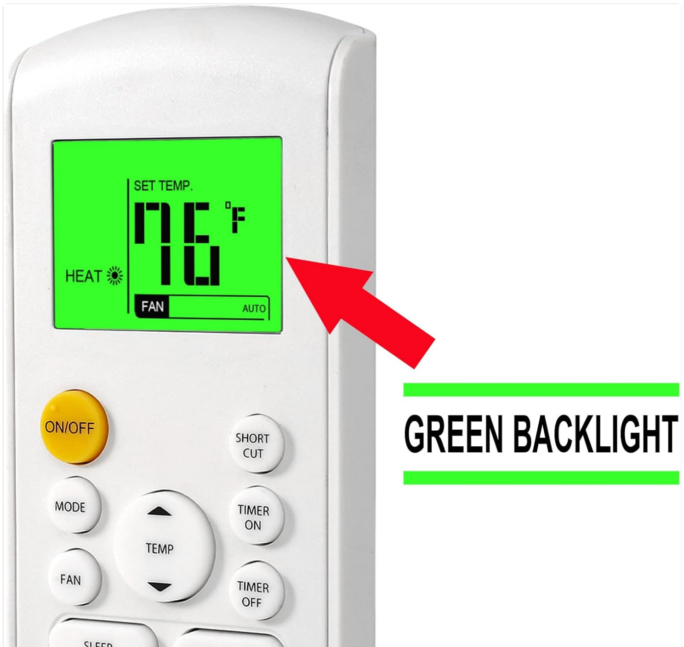
Image 2.4: A close-up view of the remote control's display, showing the green backlight feature.