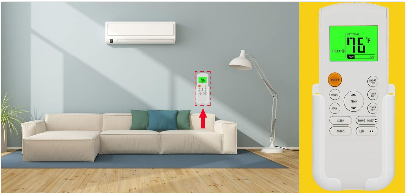
Image 2.2: The remote control being used to operate an air conditioner unit.