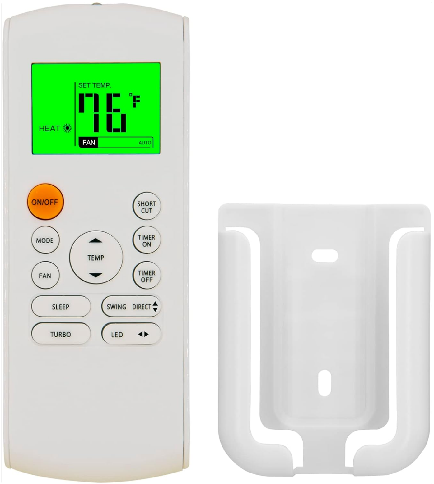
Image 2.1: The replacement remote control and its accompanying wall mounting bracket.