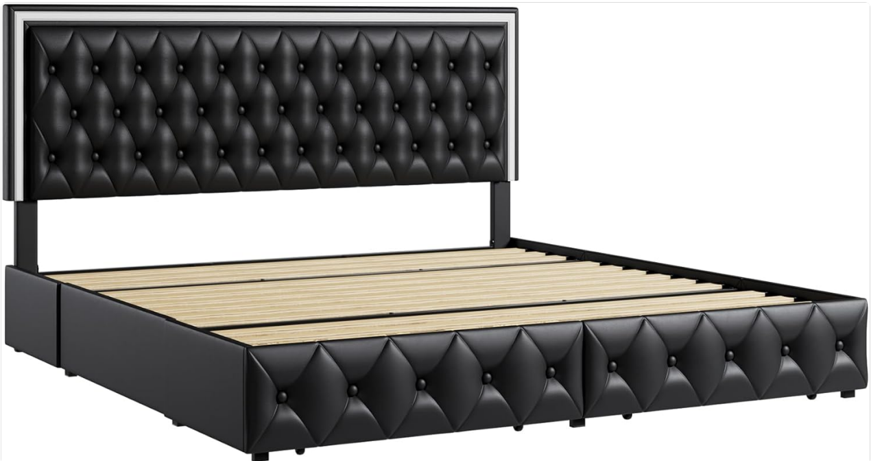
Figure 4.2: Solid wooden slats provide strong support without a box spring.