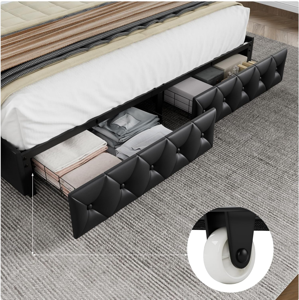
Figure 5.3: Drawer wheels ensure smooth and silent operation.