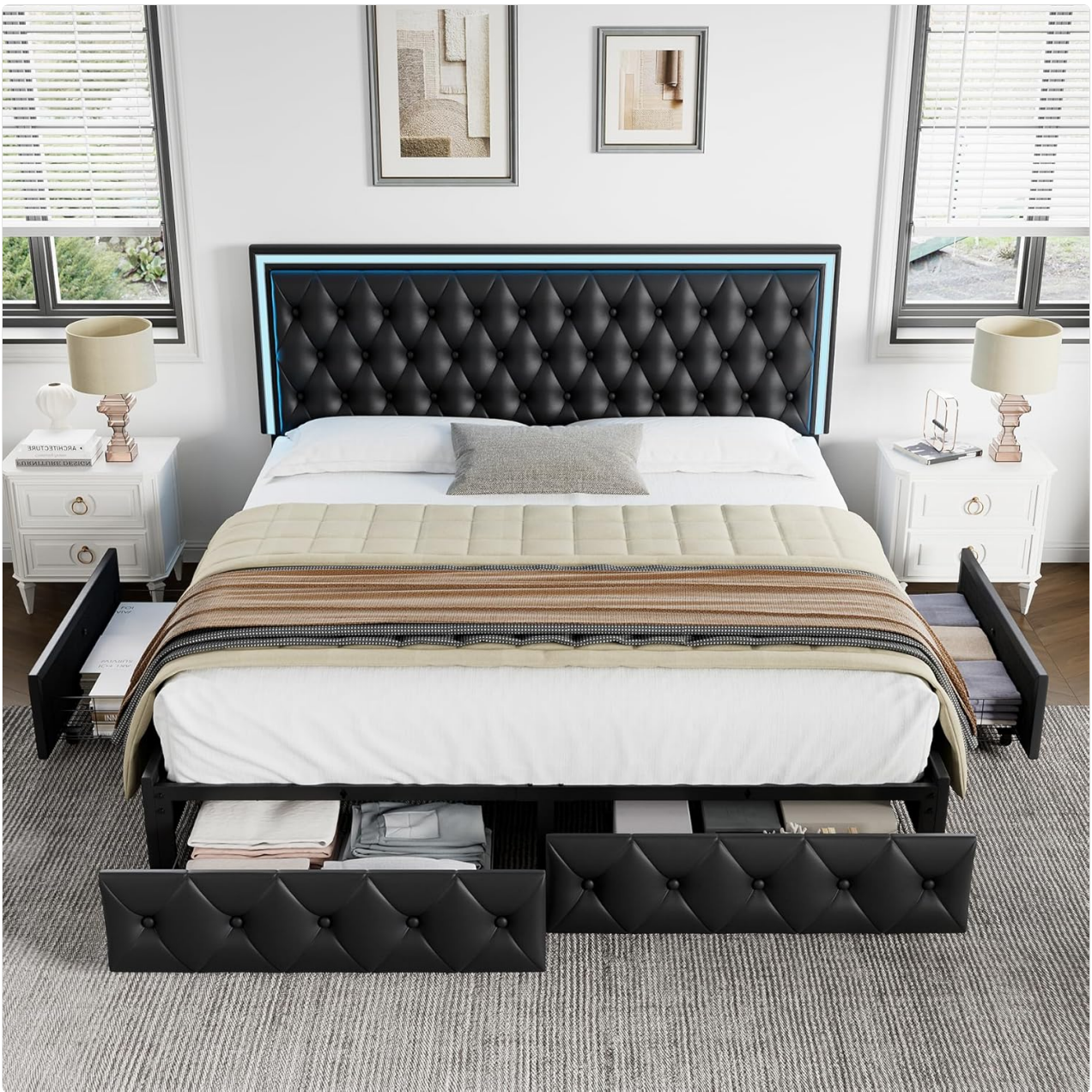
Figure 5.2: Four large storage drawers provide ample space.