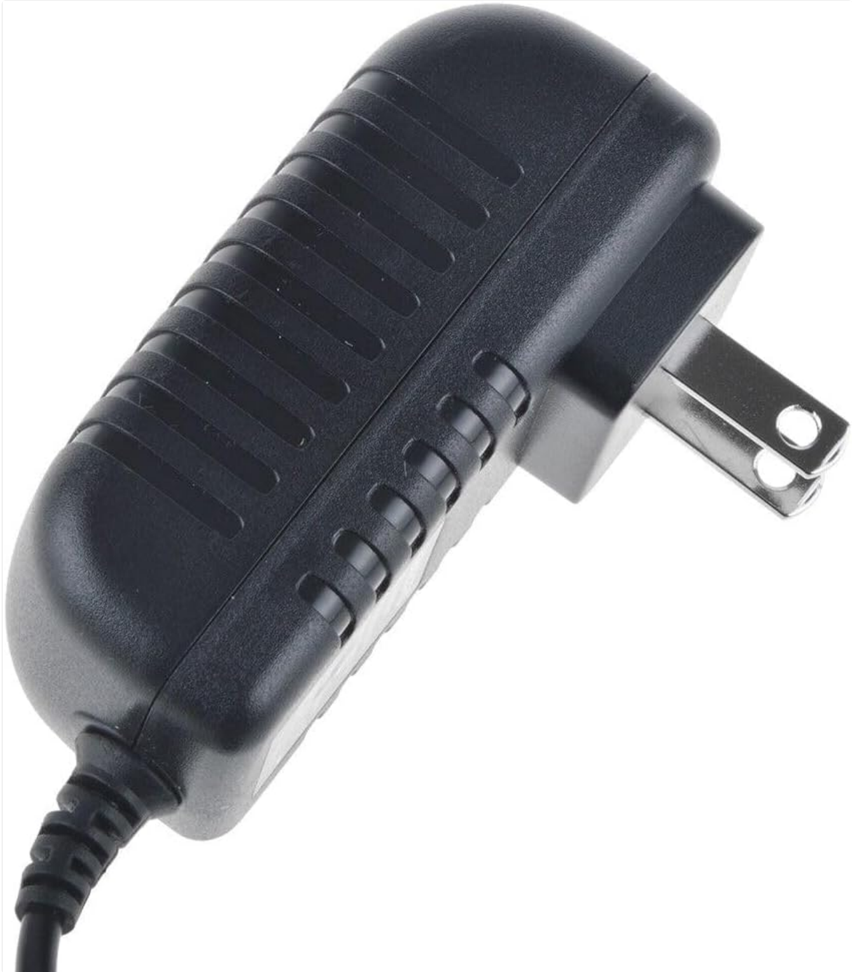
Image 2: Marg 9VDC 1A AC Adapter showing the DC output connector. This image displays the adapter with its cable and barrel connector, ready to be plugged into a device.