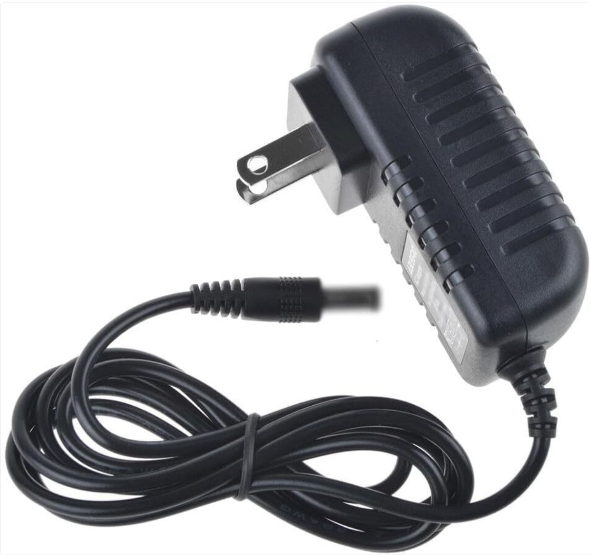
Image 1: Marg 9VDC 1A AC Adapter with coiled cable. This image shows the Marg 9VDC 1A AC Adapter with its power cable neatly coiled, illustrating its compact design for storage and portability.