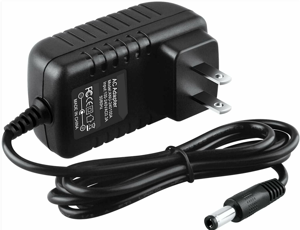
Image 3: Marg 9VDC 1A AC Adapter showing the US plug. This image highlights the compact design of the adapter, featuring the two-prong US-style plug.

Simply connect the adapter as described in the "Setup" section. The adapter will automatically provide power to your device when plugged into a live outlet.