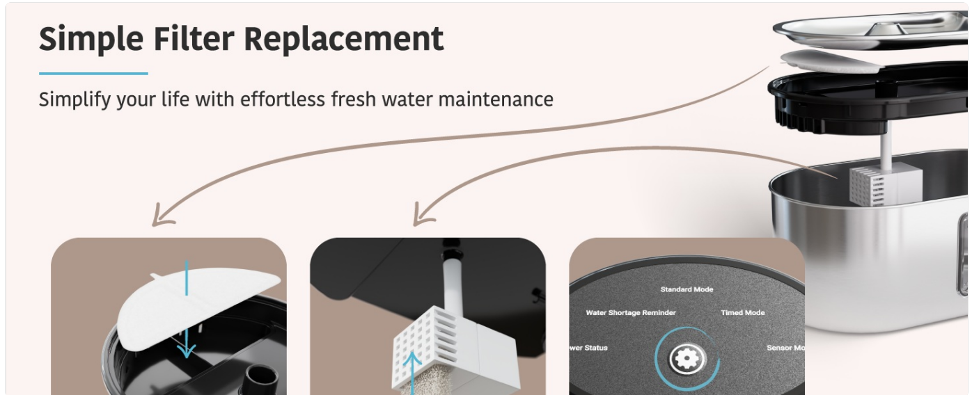
Image: This image illustrates the simple filter replacement process, showing how to remove the old filter and insert a new one, and how to reset the filter life cycle by pressing the "Settings" button.

Each filter is designed to last up to a month under normal usage conditions.