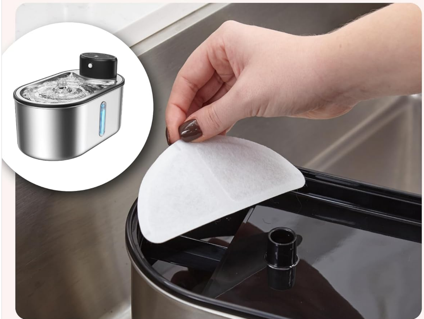
Image: This image illustrates the compatibility of the filter with the Veken 3L Wireless Battery Cat Fountain. A hand is shown carefully placing a new filter into the designated slot of the fountain, emphasizing the ease of replacement.