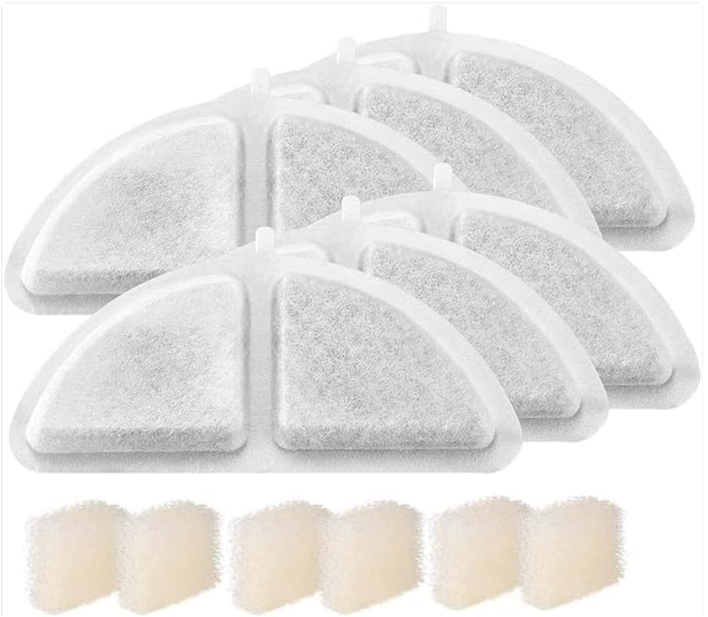
Image: This image displays the complete set of Veken replacement filters and pre-filter sponges, designed for the Veken 3L Wireless Cat Fountain. The filters are white, semi-circular, and the sponges are small, rectangular, and light-colored.