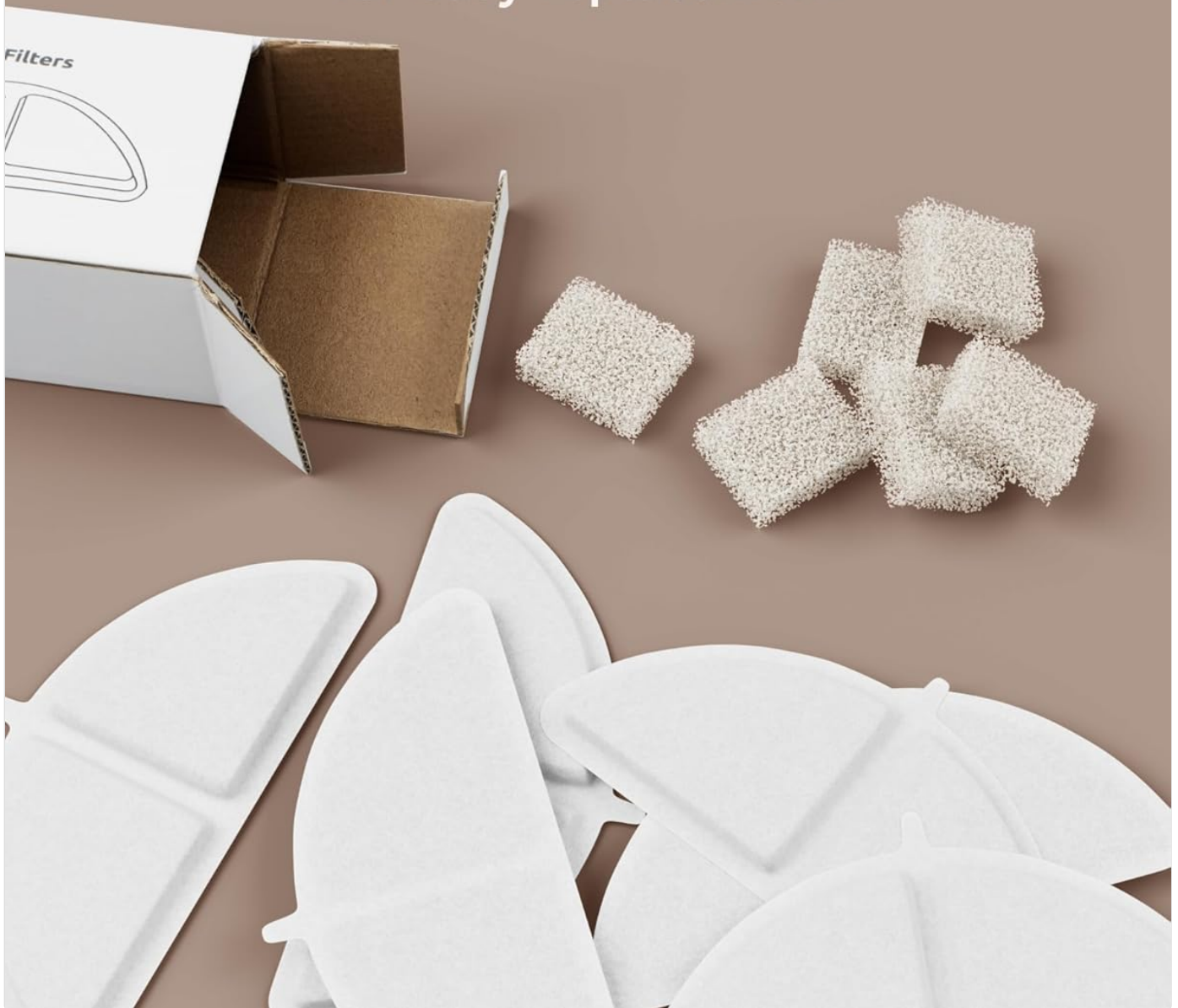
Image: This image shows the Veken 6-piece replacement set, including both the filters and pre-filter sponges, some still in their box and others laid out, demonstrating the complete package for easy maintenance.

6 filter & 6 pre-filter sponges for easy replacement