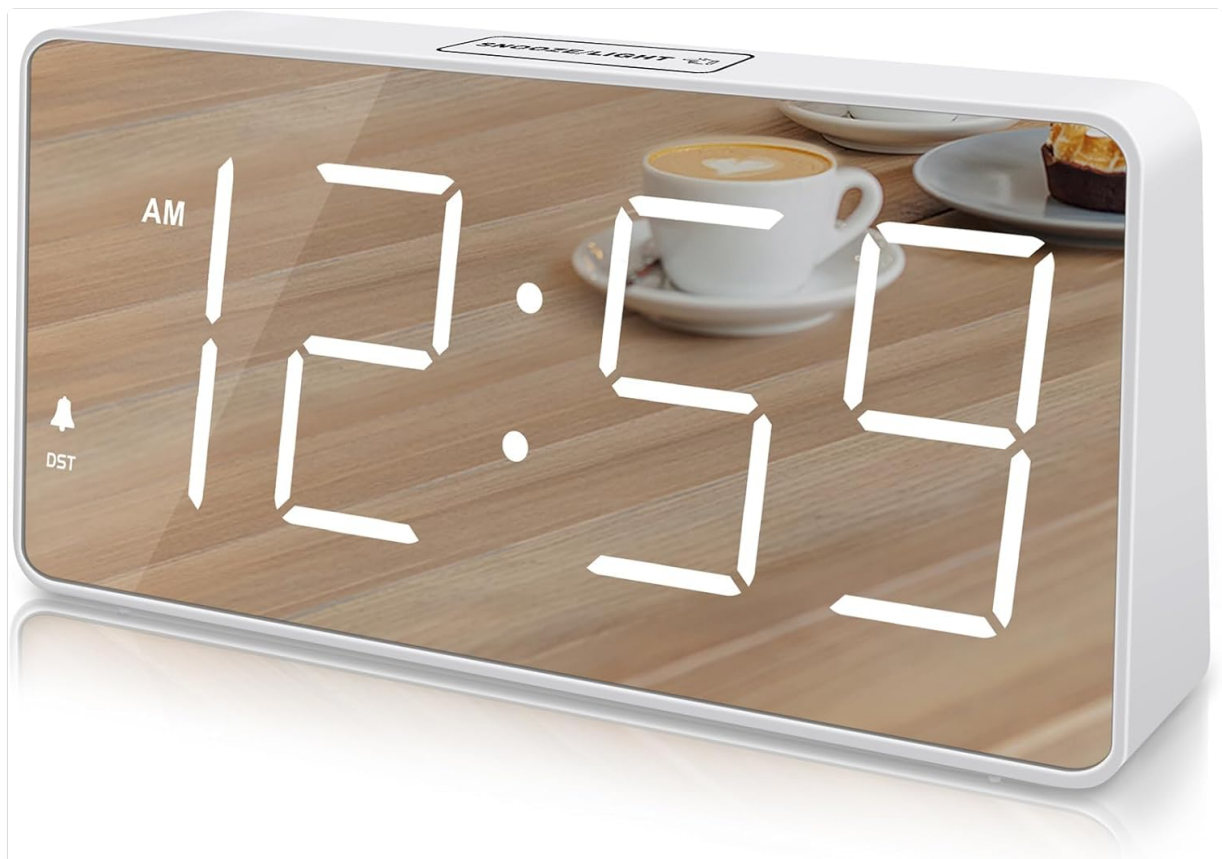
Figure 1: Peakeep Digital Alarm Clock (White-mirror)

This manual provides comprehensive instructions for the Peakeep Digital Alarm Clock, Model MHP6010. This alarm clock is designed for bedrooms, offering a mirror face with large numbers, adjustable brightness, and a super loud alarm for heavy sleepers. It features a dual power supply system with battery backup to ensure reliable operation even during power outages.