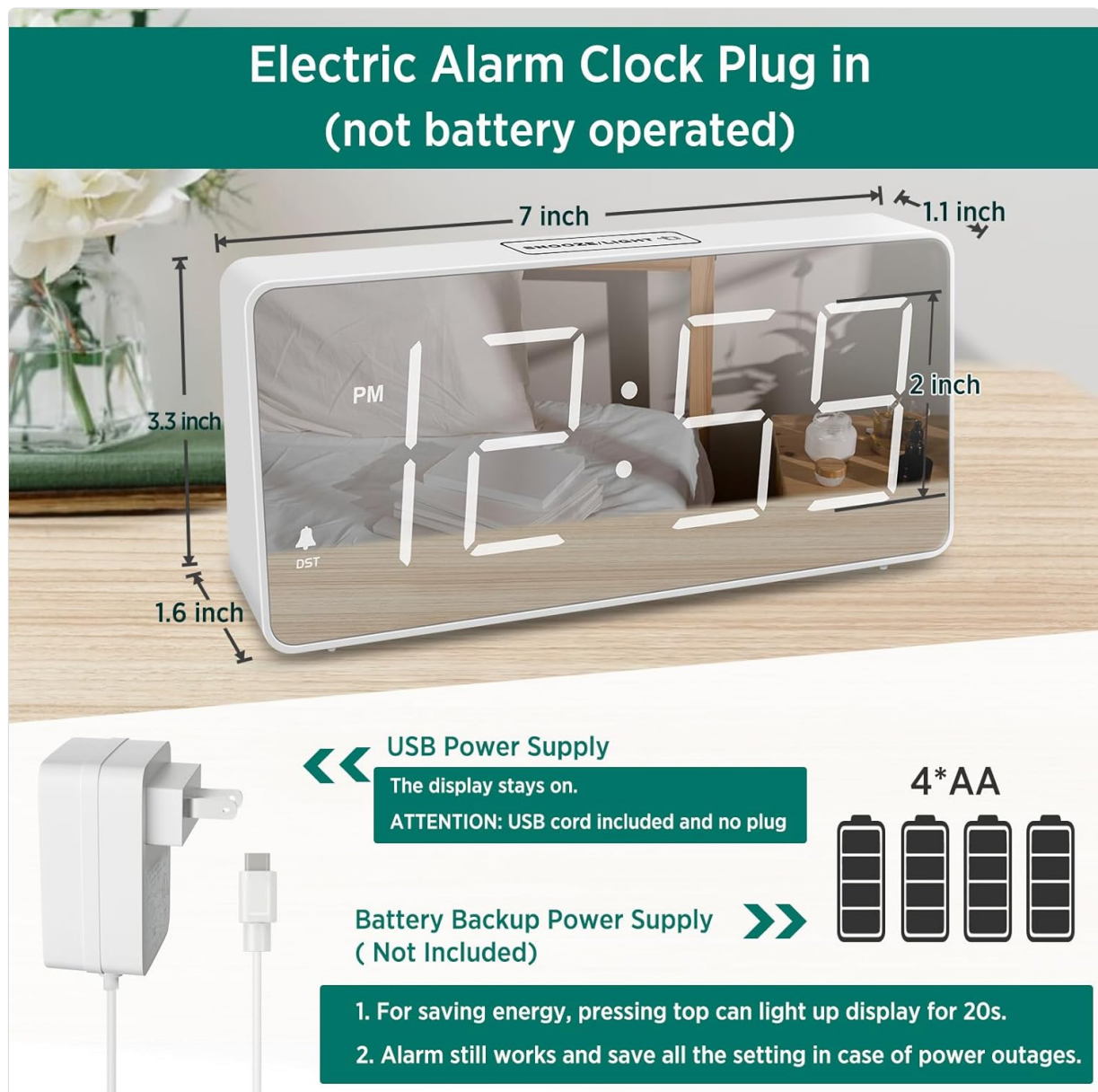
Figure 2: Included items and power options. Note: 4 AA batteries are required for backup but are not included.