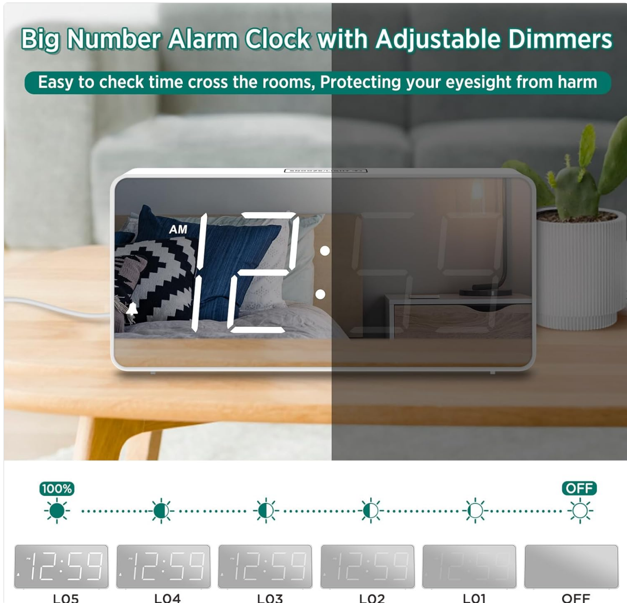
Figure 4: Adjustable brightness levels for optimal viewing.