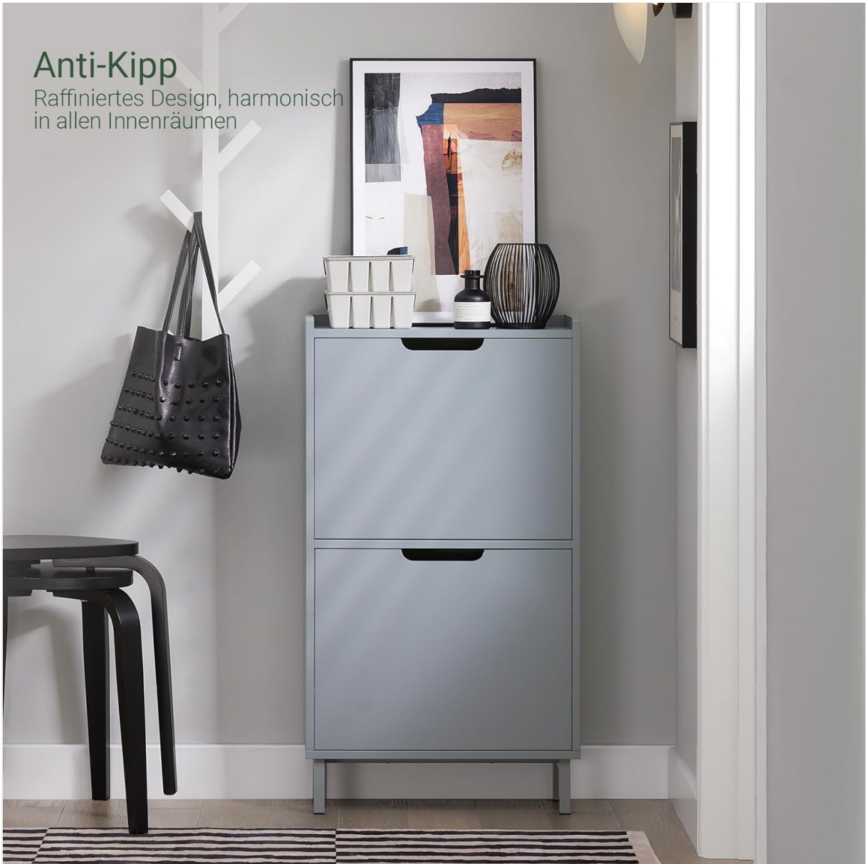
Figure 4: Detail of the integrated hollow handle, which facilitates opening and closing while providing ventilation.

Raffiniertes Design, harmonisch in allen Innenräumen