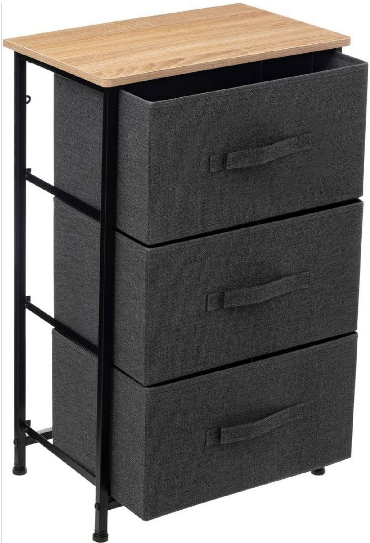
Image 3: Assembled unit highlighting dimensions and adjustable feet.