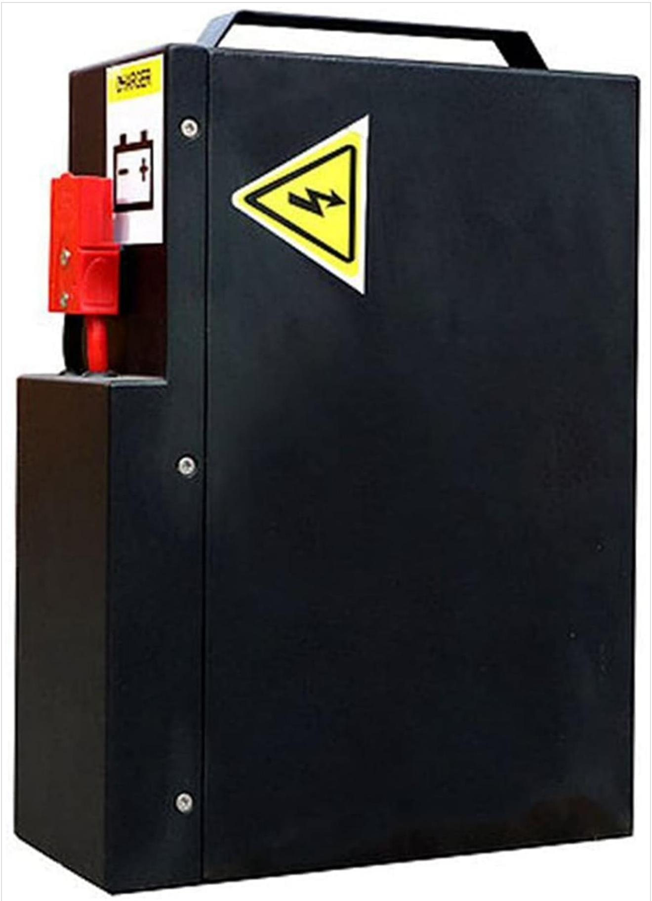
Image: Extra Lithium Battery. The pallet jack includes an extra lithium battery to ensure continuous operation.

plug it in directly without removing the battery.