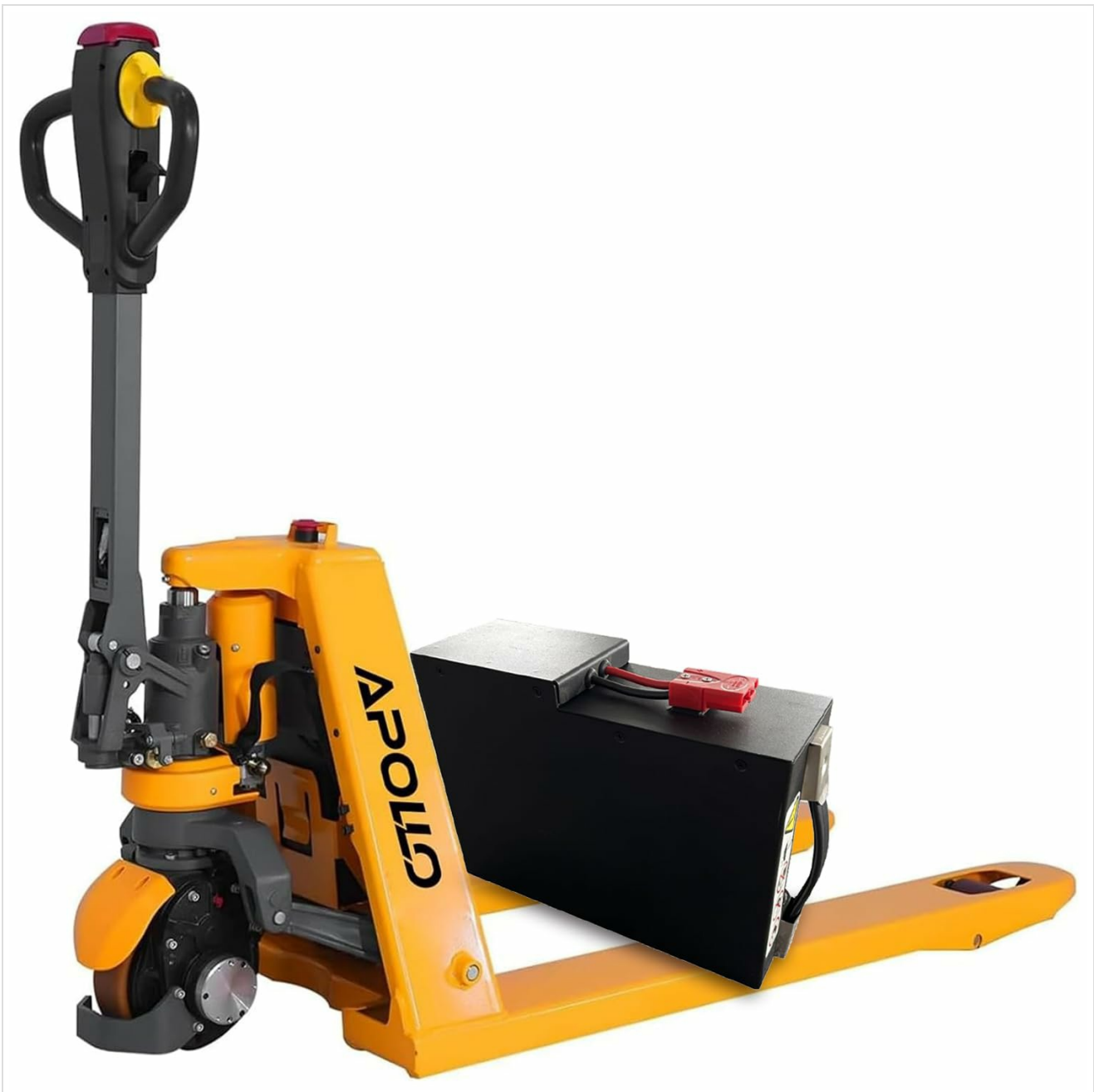
Image: APOLLOLIFT AB-1034 Pallet Jack Dimensions. This image provides an overview of the pallet jack's key dimensions, including overall height, fork length, and overall length.