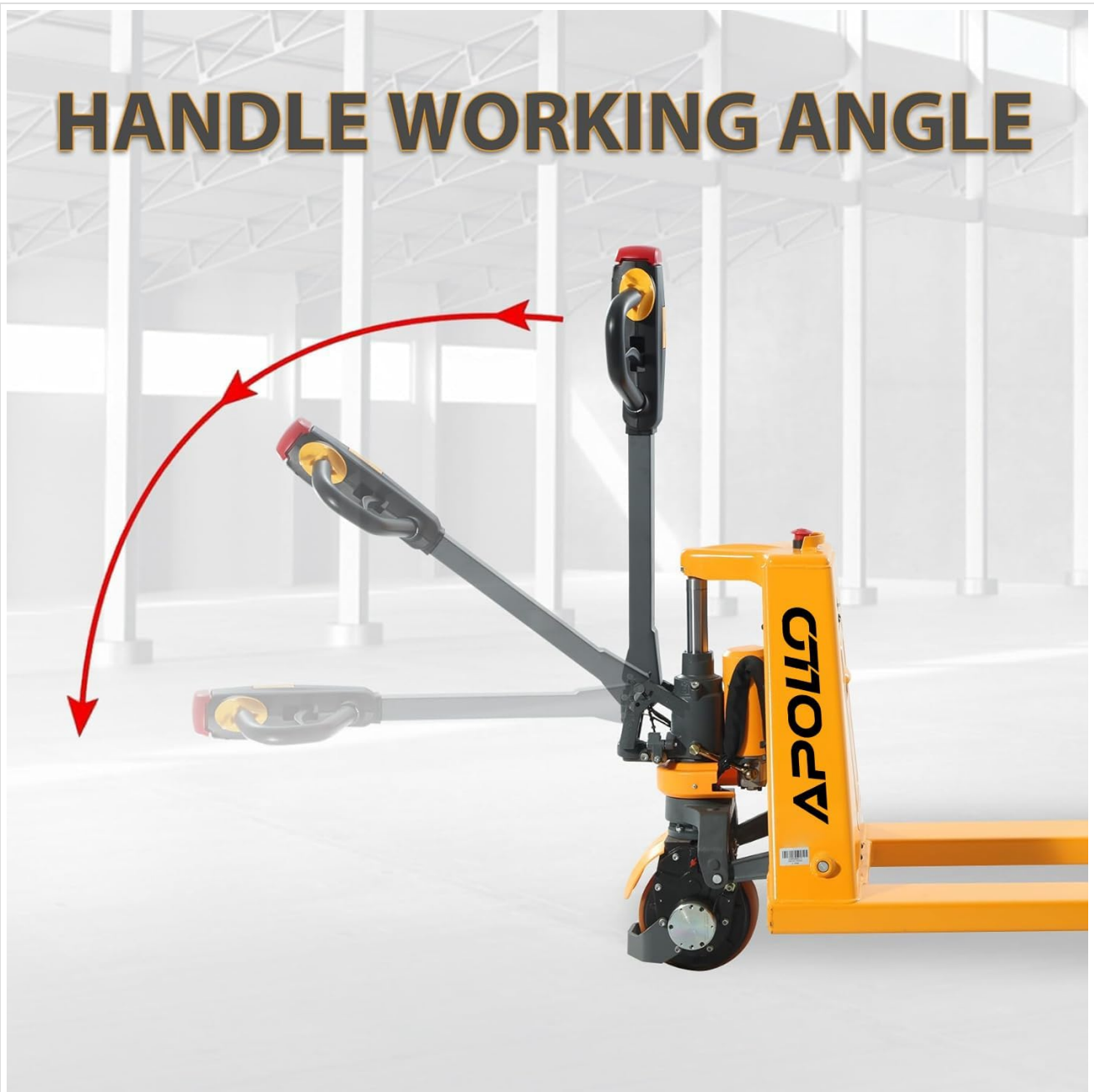
Image: Multi-Function Handle. The handle provides one-finger lift/lower control with speed adjustment via the accelerator knob.