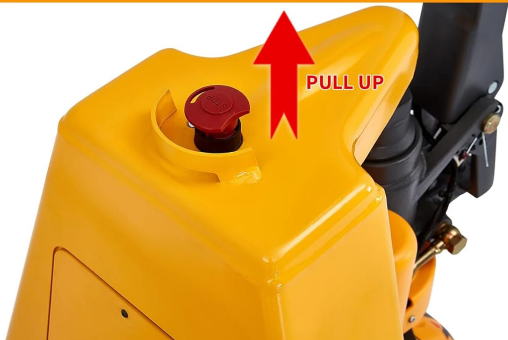
Image: Emergency Stop Button. Pull up the red emergency stop button to turn on the power. This button also serves as an immediate shutdown mechanism when pressed down.