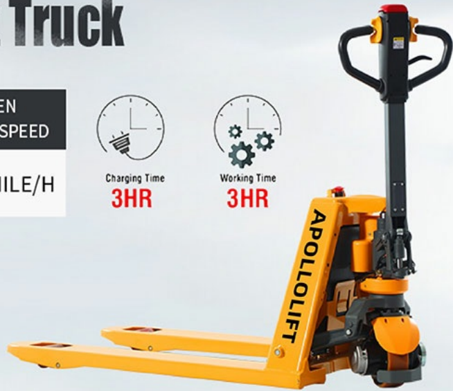
Image: APOLLOLIFT AB-1034 Key Specifications. Displays the model number, max load capacity, max lifting height, laden travel speed, charging time, and working time.