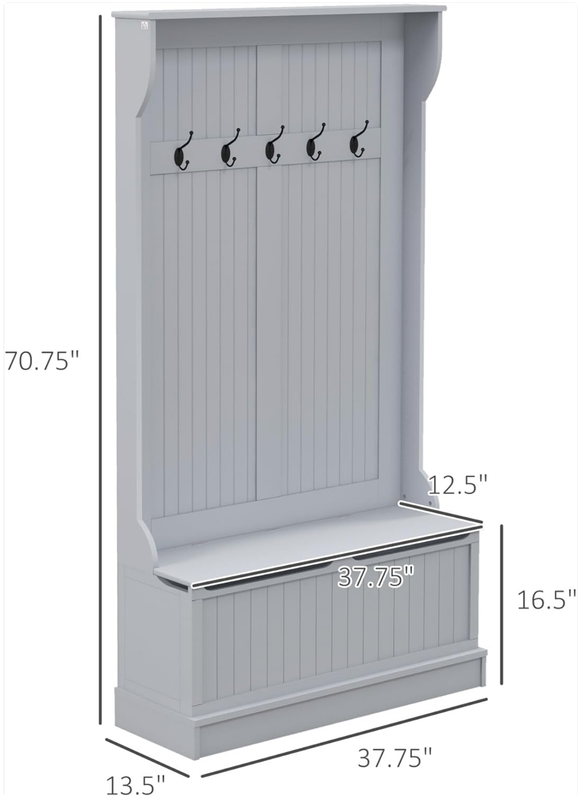
Figure 7: Detailed dimensions of the HOMCOM Hall Tree.