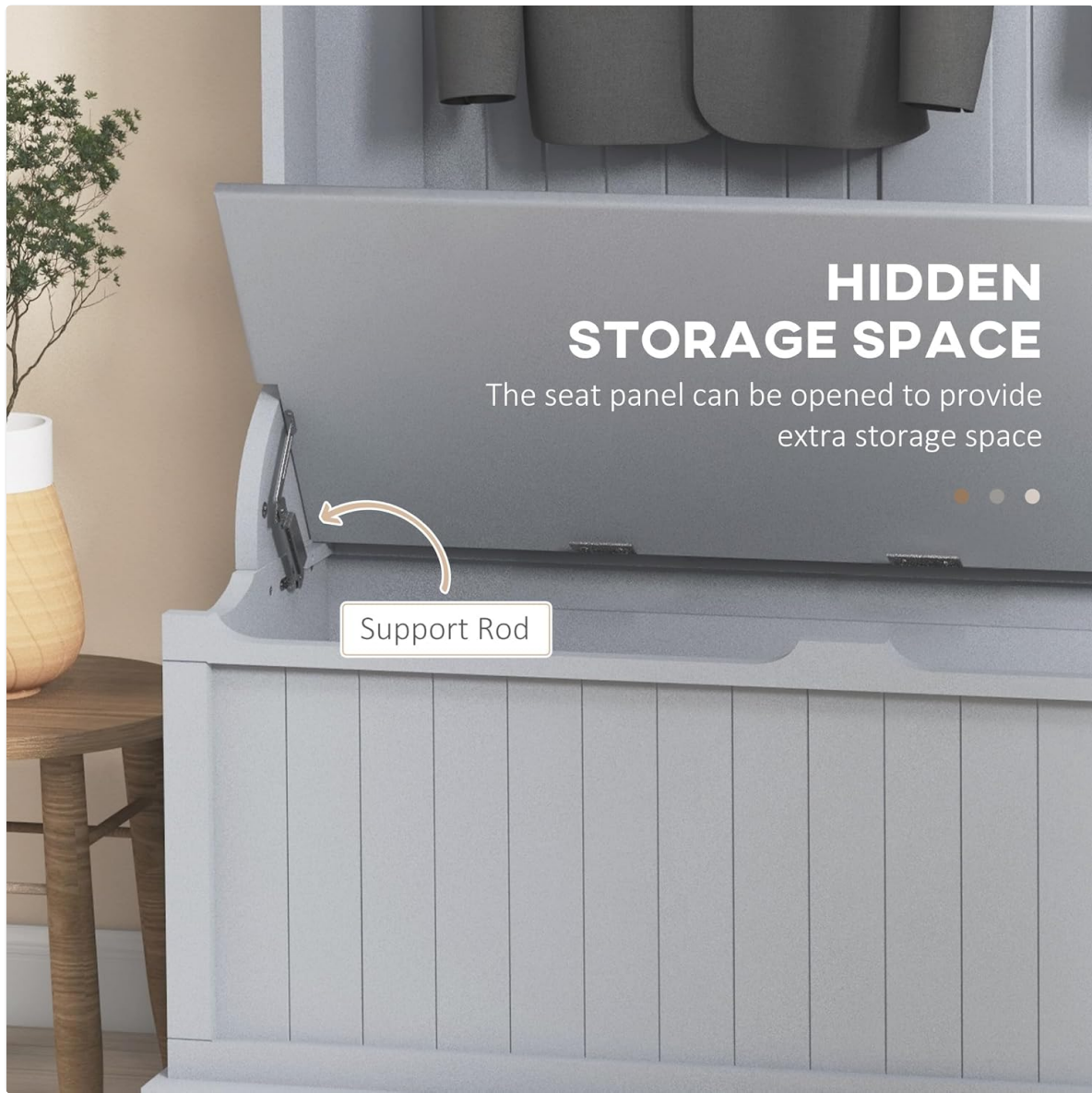
Figure 5: The hidden storage space beneath the bench, accessible via a flip-top panel with a support rod.