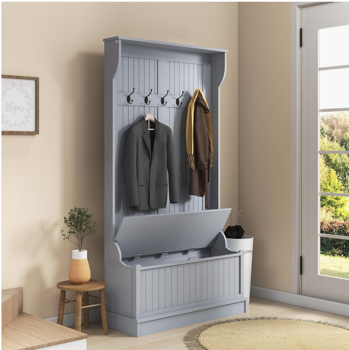
Figure 6: The hall tree with its bench storage compartment open, demonstrating its capacity for shoes and other items.