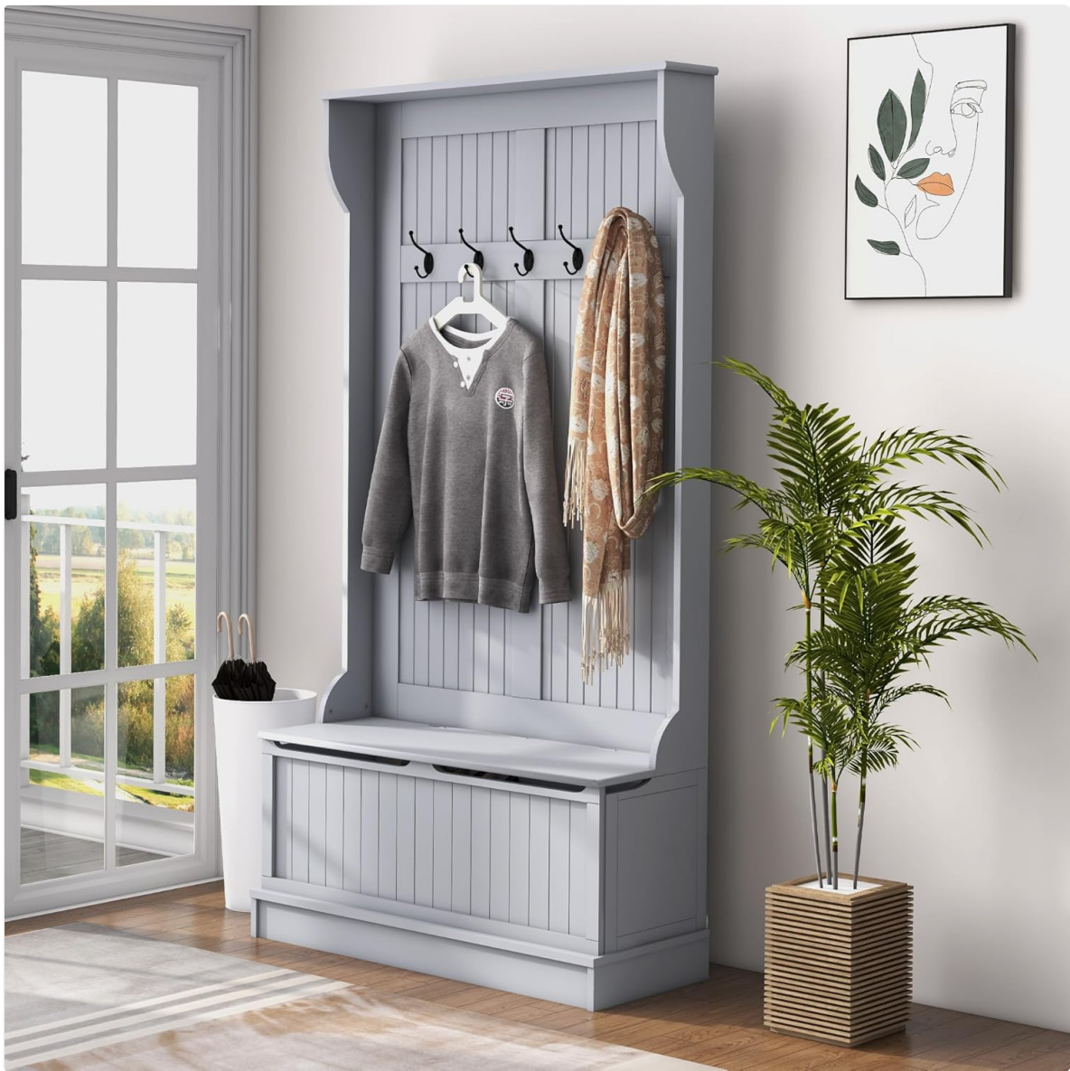
Figure 1: The HOMCOM Hall Tree in a typical entryway setting, showcasing its elegant design and functional elements.