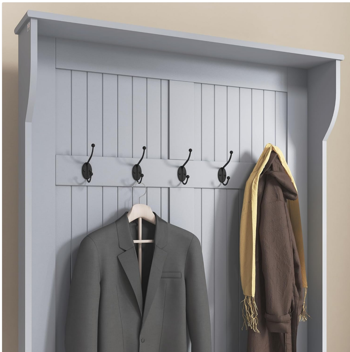
Figure 4: Detail of the durable metal hooks, suitable for various garments and accessories.