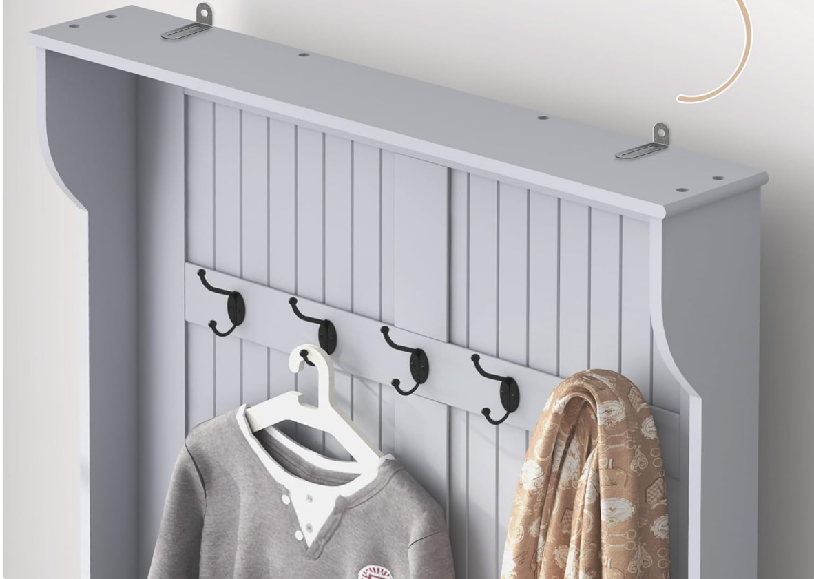
Figure 2: Illustration of the anti-toppling device and its proper wall attachment for enhanced stability.