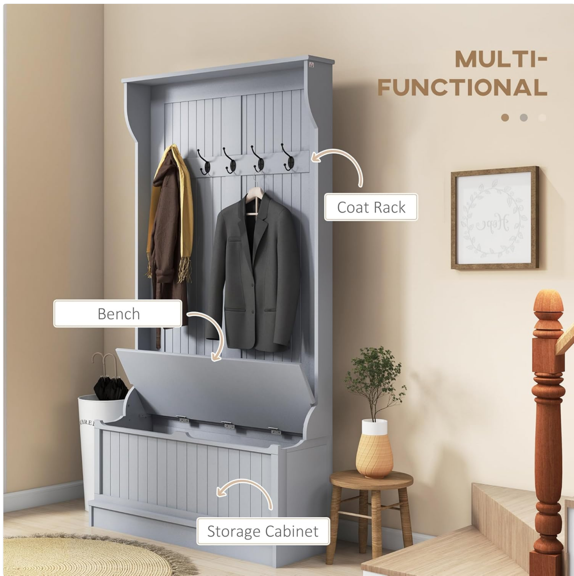
Figure 3: Visual breakdown of the hall tree's multi-functional components: coat rack, bench, and storage cabinet.