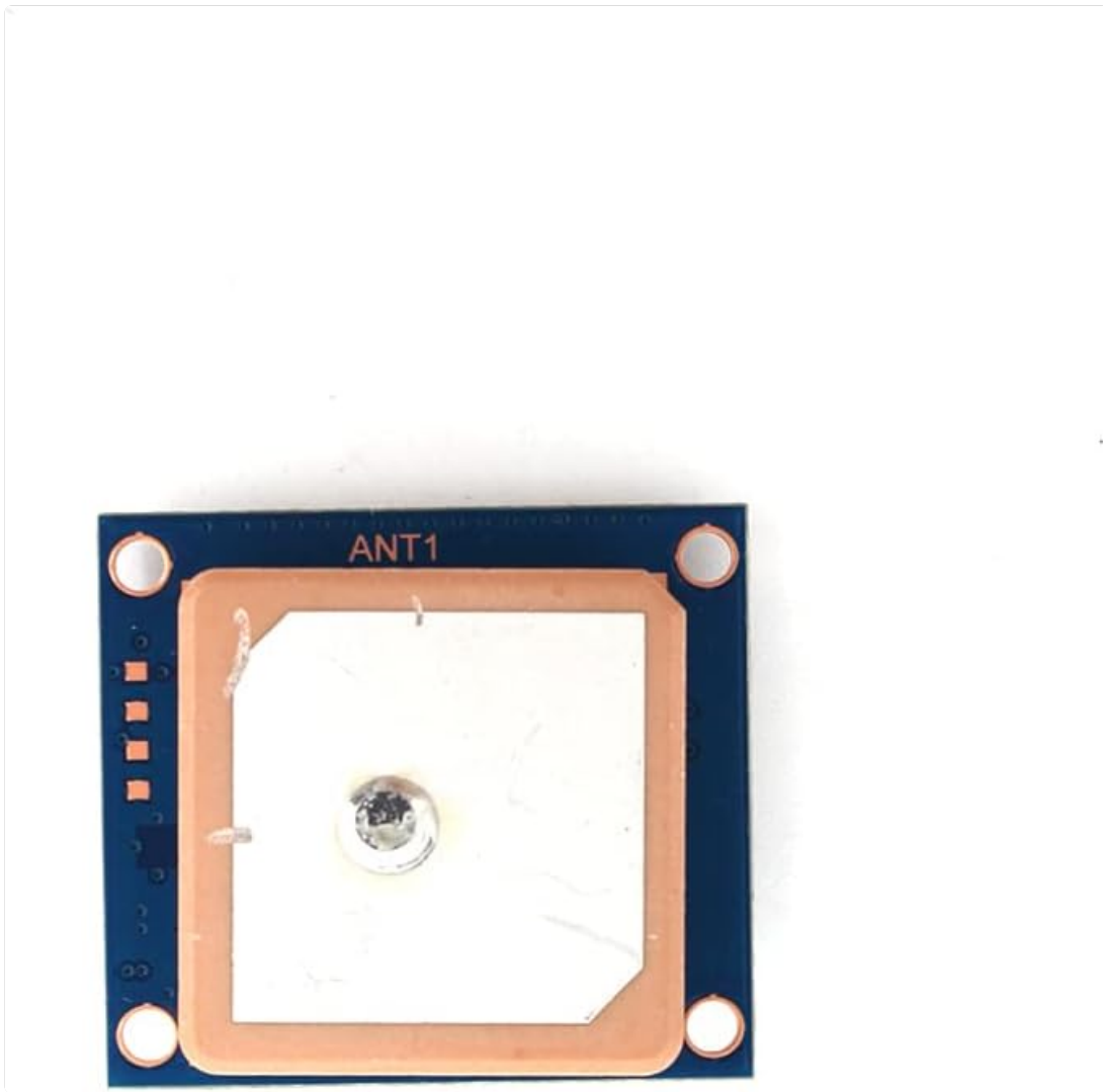
Figure 3.3: Back view of the GPS module, highlighting the integrated antenna labeled ANT1.