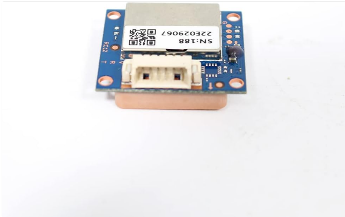
Figure 3.2: Front view of the GPS module showing the connector port and serial number. The serial number is SN:188 22E029067. More info on 22E029067