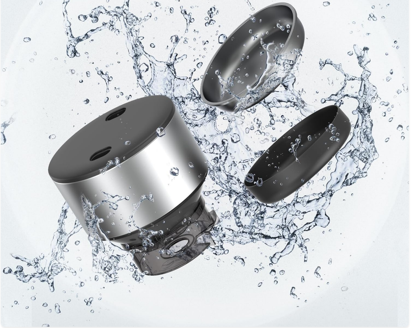
Image: The feeder's components, including the stainless steel bowl and the main unit's top, are shown being cleaned with water splashes, illustrating the ease of cleaning.

Important Note: Some internal plastic components are not removable and may trap water if submerged. Clean these areas carefully with a damp cloth and ensure they are thoroughly dried to prevent mold growth, as noted in customer feedback.