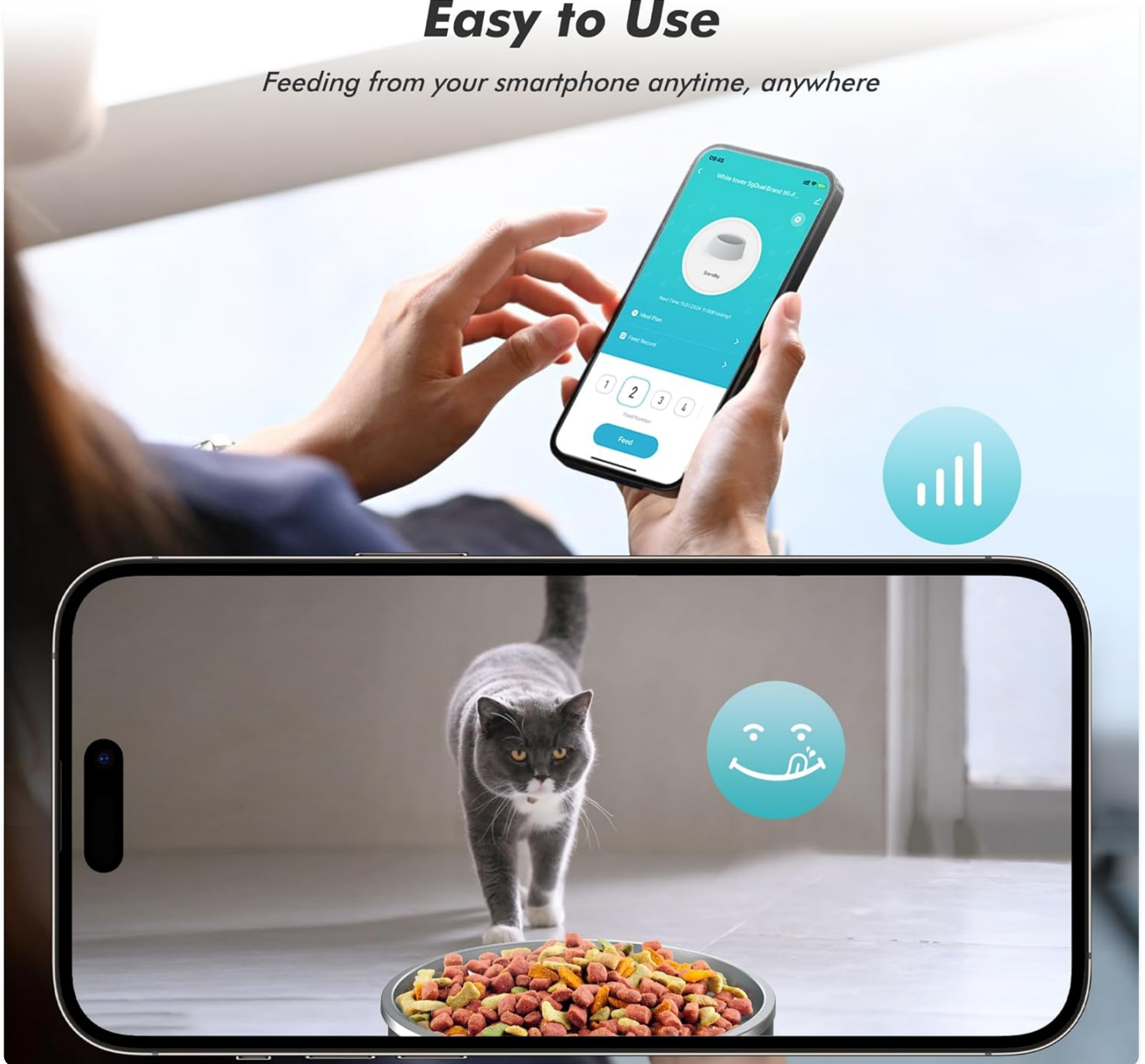
Image: A person's hands holding a smartphone, remotely controlling the feeder. A grey cat is shown eating from the feeder's bowl, highlighting the "Easy to Use" app functionality.

Feeding from your smartphone anytime, anywhere