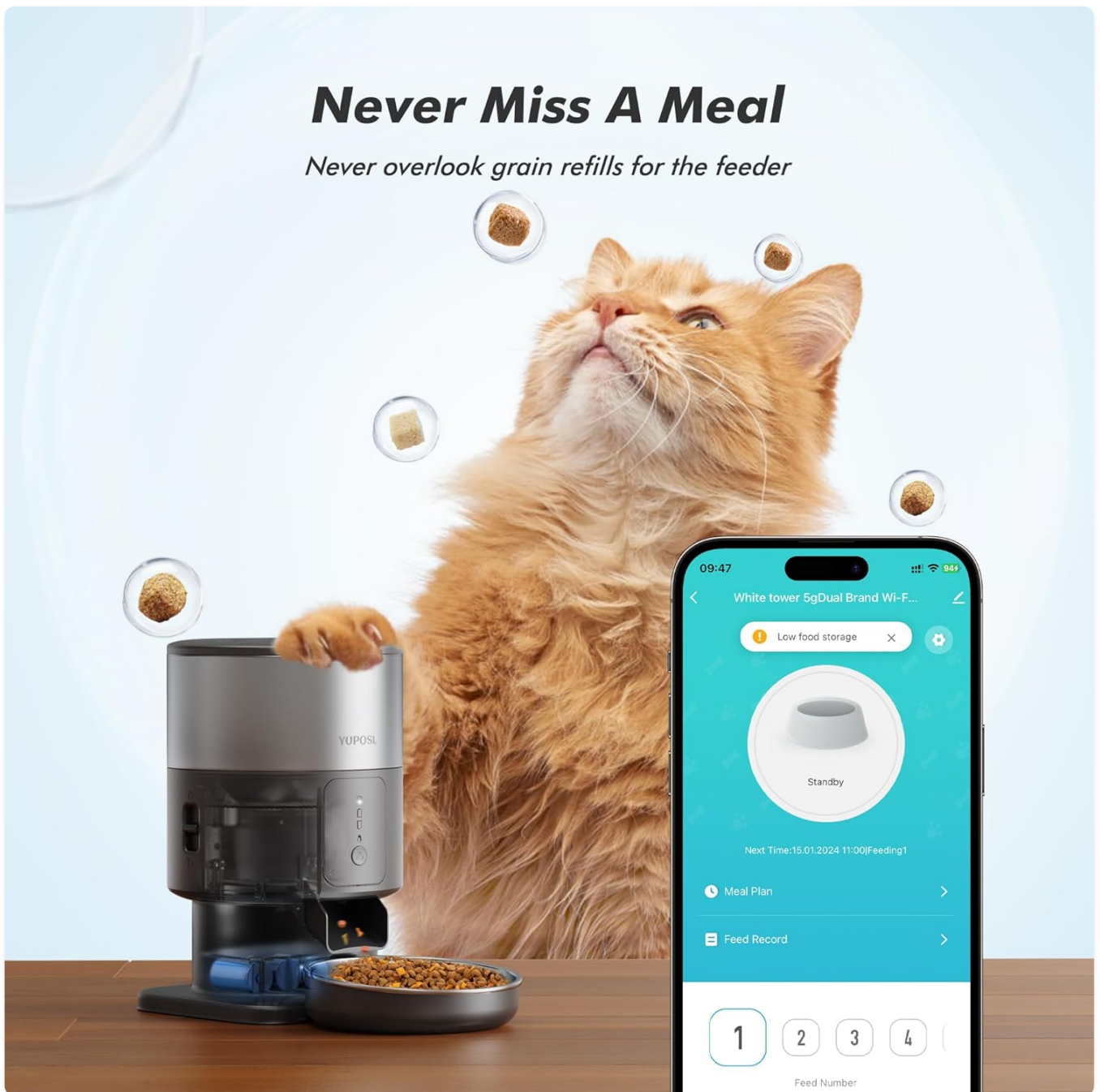
Image: An orange cat looking expectantly at the feeder, with floating food pellets, symbolizing the feeder's ability to ensure pets never miss a meal.

Never overlook grain refills for the feeder