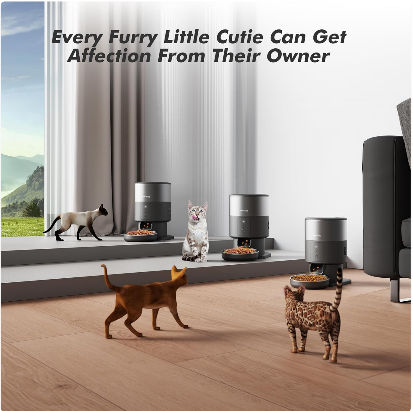
Image: Several cats are depicted in a home environment, each near a Yuposl Automatic Cat Feeder, demonstrating the product's suitability for multi-pet households.