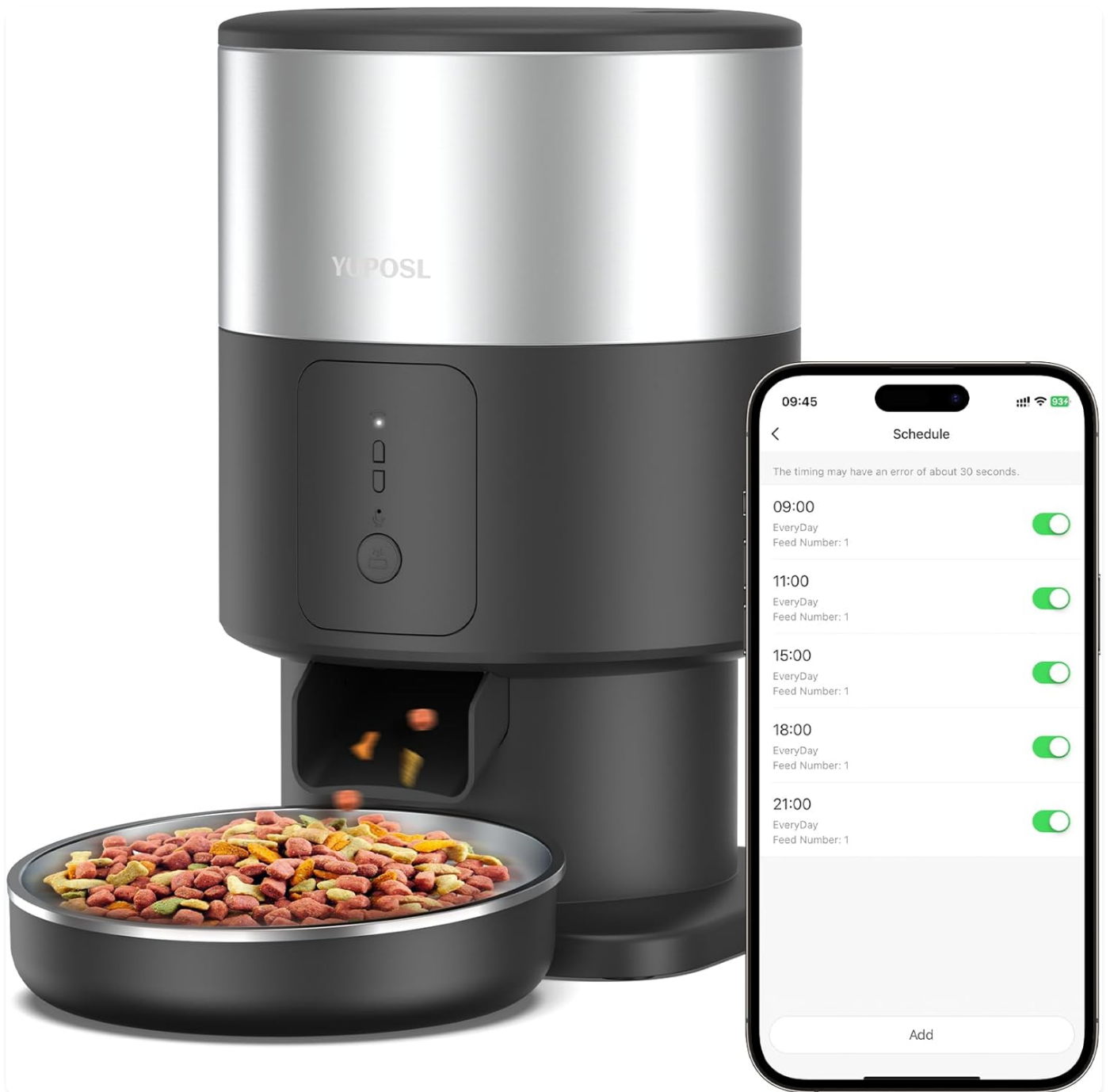
Image: The Yuposl Automatic Cat Feeder in Midnight Black, shown alongside a smartphone displaying its scheduling interface. The feeder features a stainless steel top and a black base, with a bowl of kibble in front.