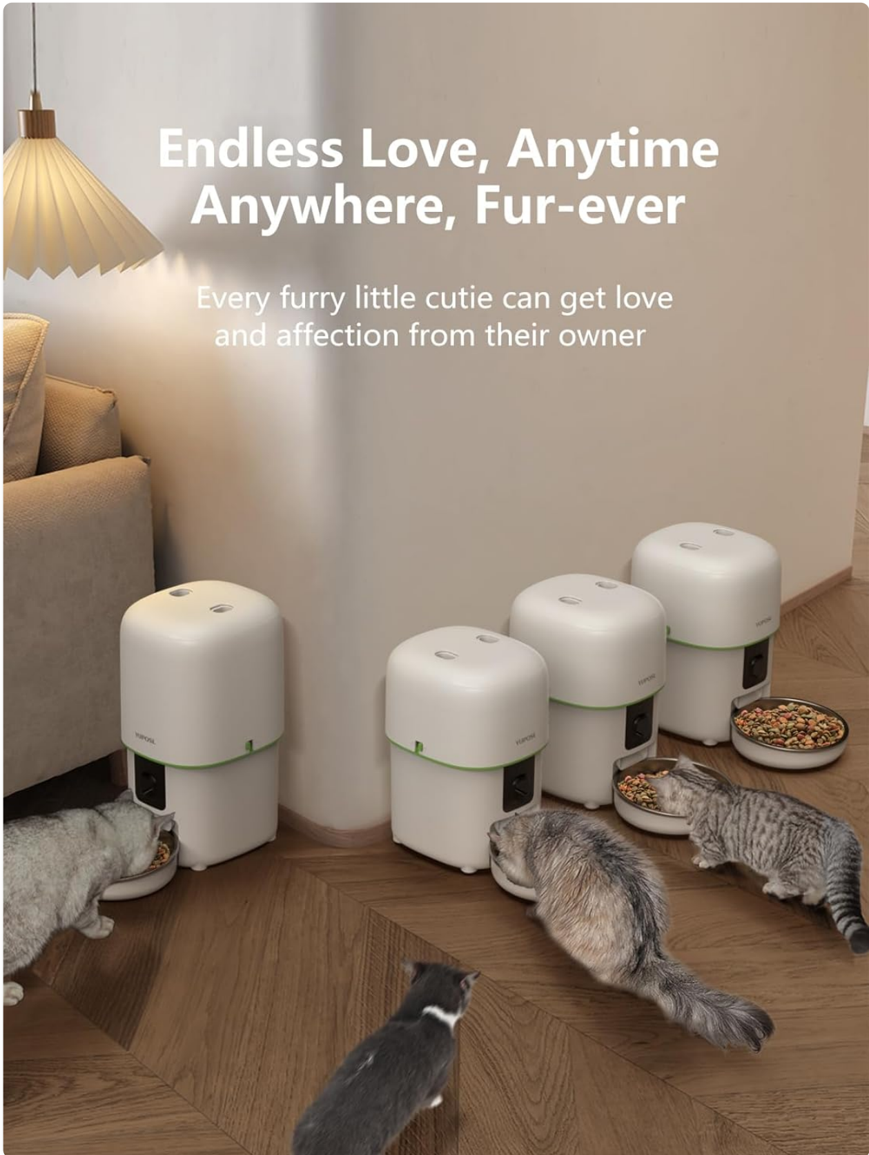
Image: Several Yuposl Automatic Cat Feeders placed around a room, with multiple cats eating from them, demonstrating how multiple feeders can be used to feed several pets simultaneously and prevent food fights.

If you have multiple Yuposl feeders, the app allows for synchronization of feeding times, ensuring all pets are fed simultaneously. This is useful for households with multiple pets to minimize food disputes.