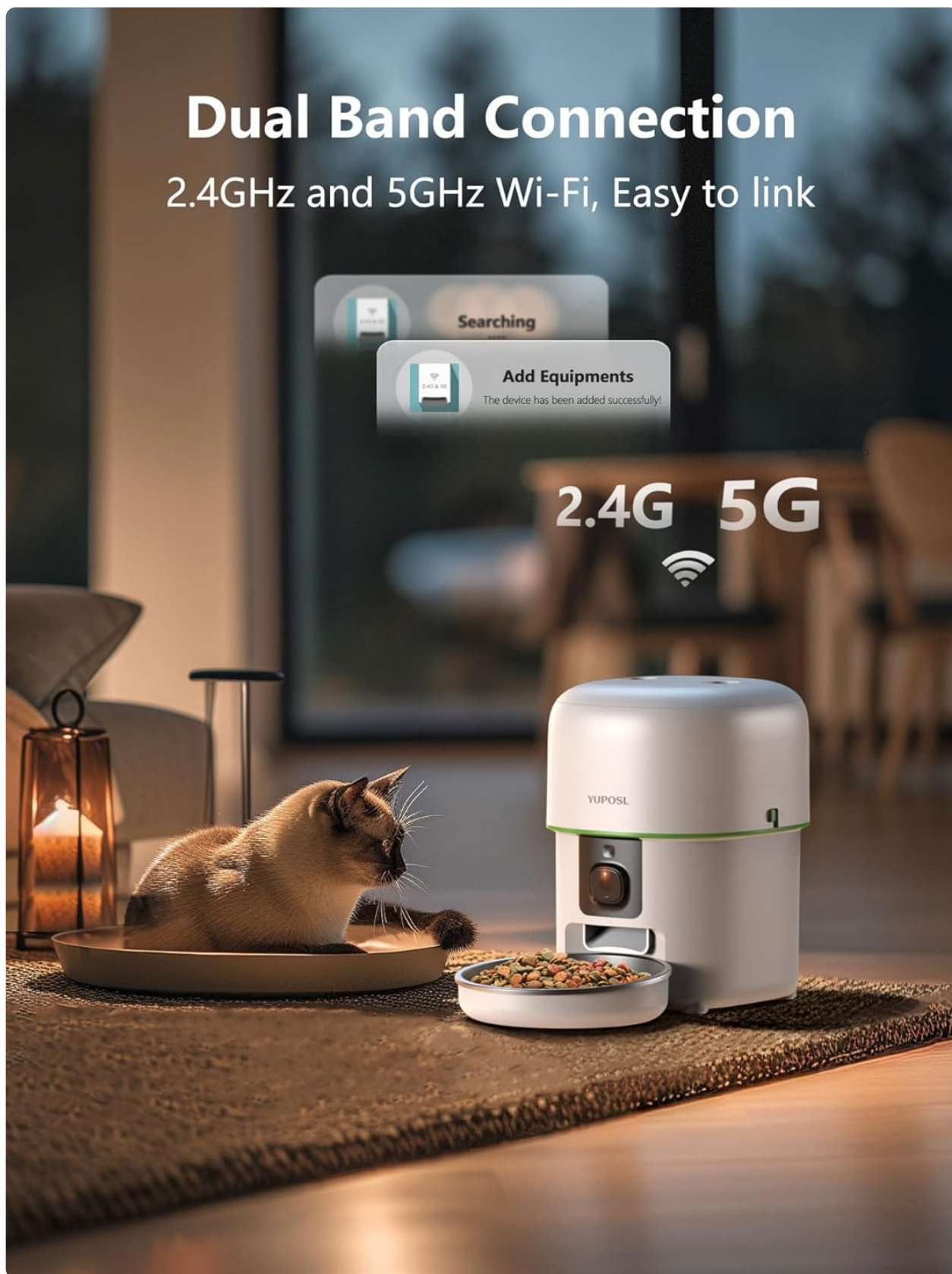
Image: A Yuposl Automatic Cat Feeder next to a cat, with a smartphone displaying the app's WiFi connection interface, highlighting compatibility with both 2.4GHz and 5GHz networks.

your WiFi network, entering the password, and confirming the device's status light.