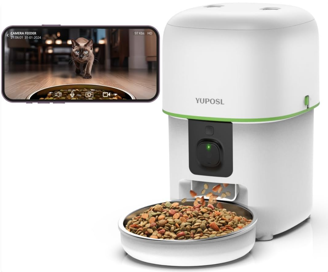
Image: The Yuposl Automatic Cat Feeder, a white device with a stainless steel bowl, dispensing food. A smartphone screen overlays the image, showing a live view of a cat eating from the feeder, demonstrating the integrated camera feature.