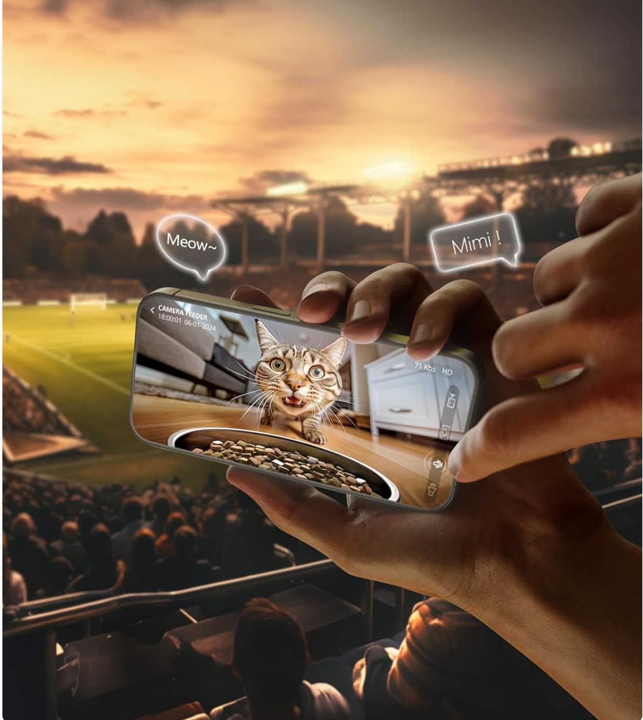
Image: Hands holding a smartphone displaying a live view of a cat from the feeder's camera, with speech bubbles indicating two-way audio communication, allowing users to "talk" with their pets.