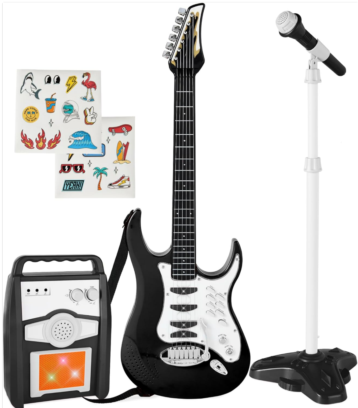
Image: All components of the Kids Electric Musical Guitar Play Set, including the black guitar, amplifier, microphone with stand, and sticker sheets.