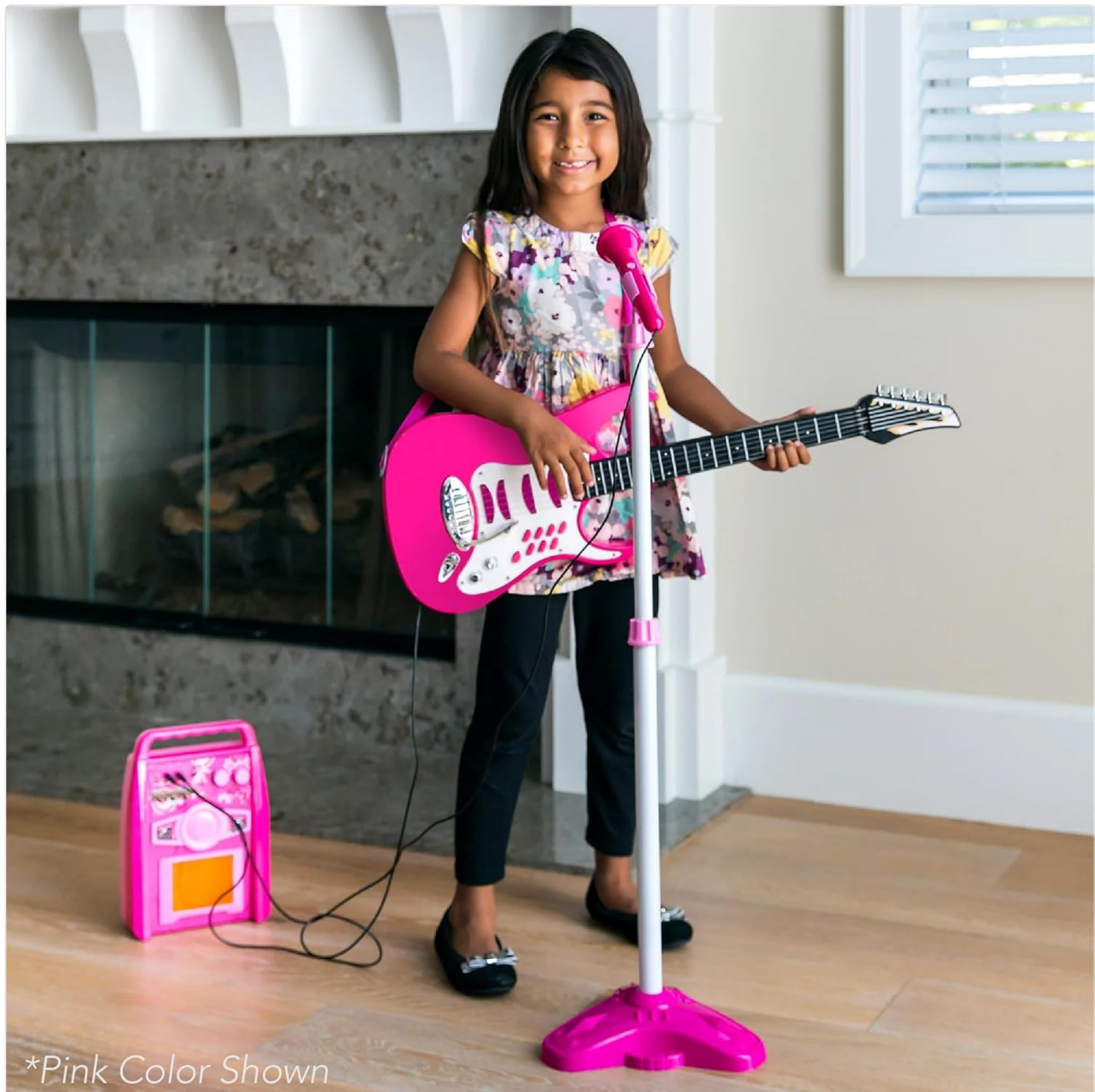
Image: A child happily playing with the pink version of the electric guitar and microphone set, demonstrating its size and interactive nature.