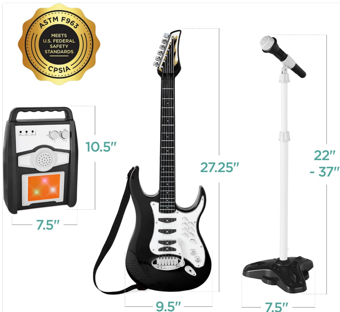
Image: The microphone attached to its adjustable stand, ready for use.