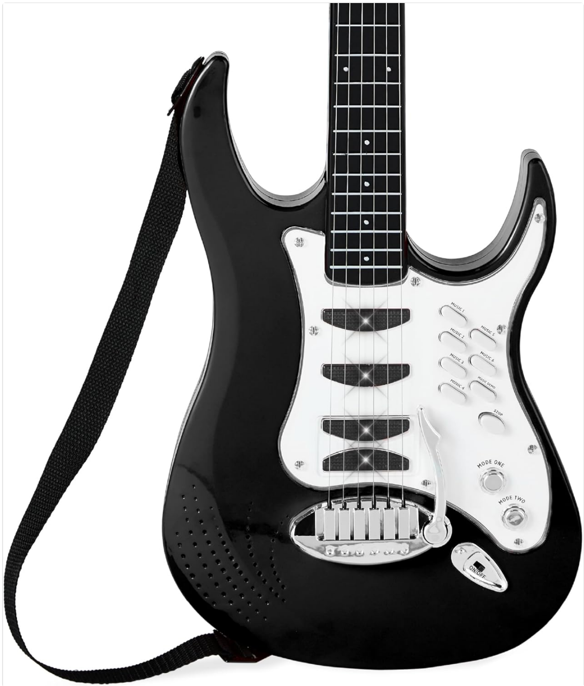
Image: A detailed view of the toy guitar's body, showing the strings, whammy bar, and control knobs.