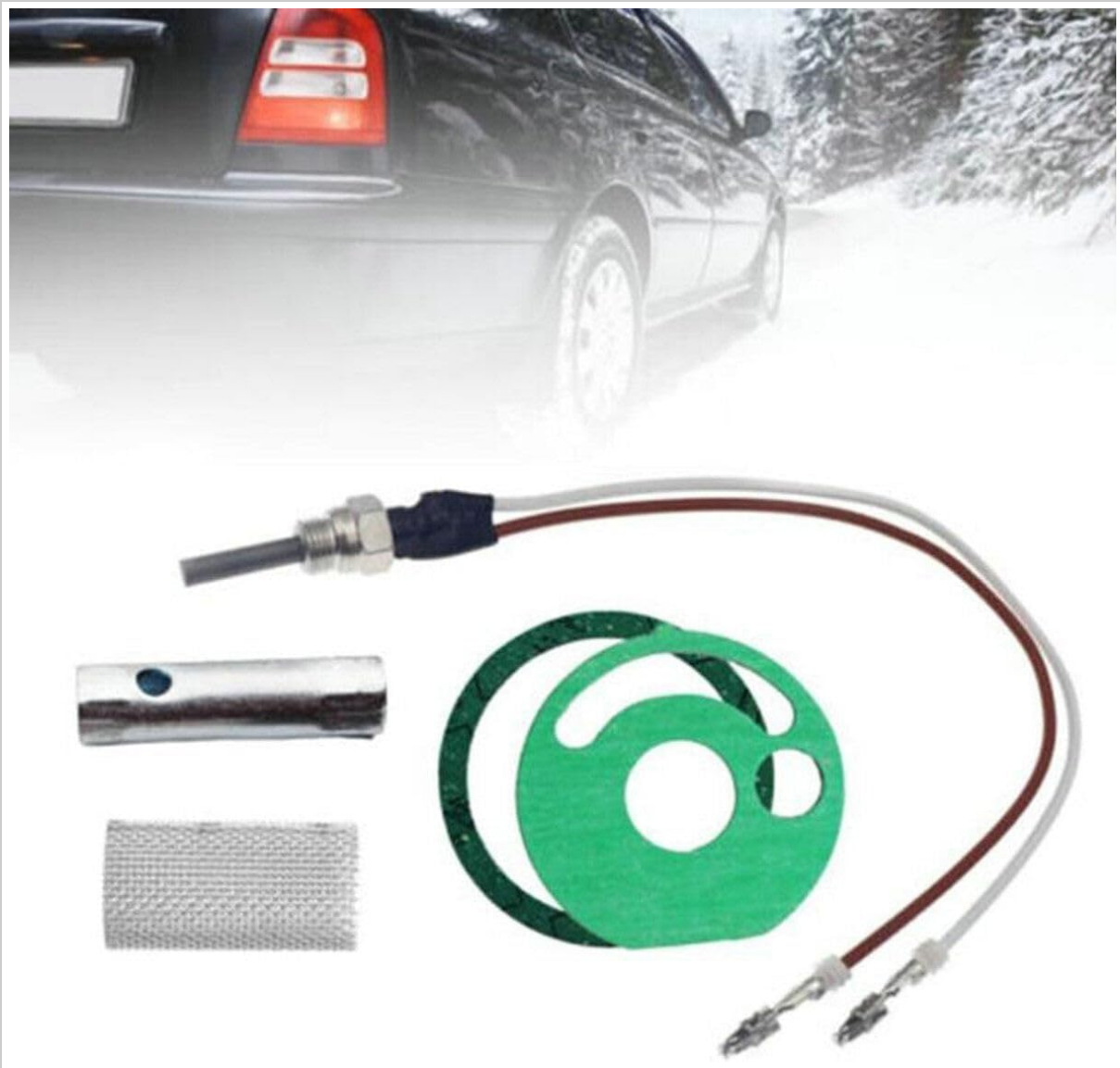
Image 1: Overview of the Bayyee Diesel Parking Heater Service Kit components.