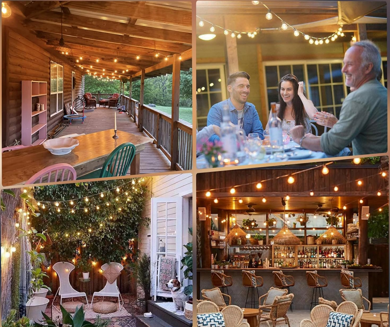
Image: Examples of the four lighting modes for different scenes.