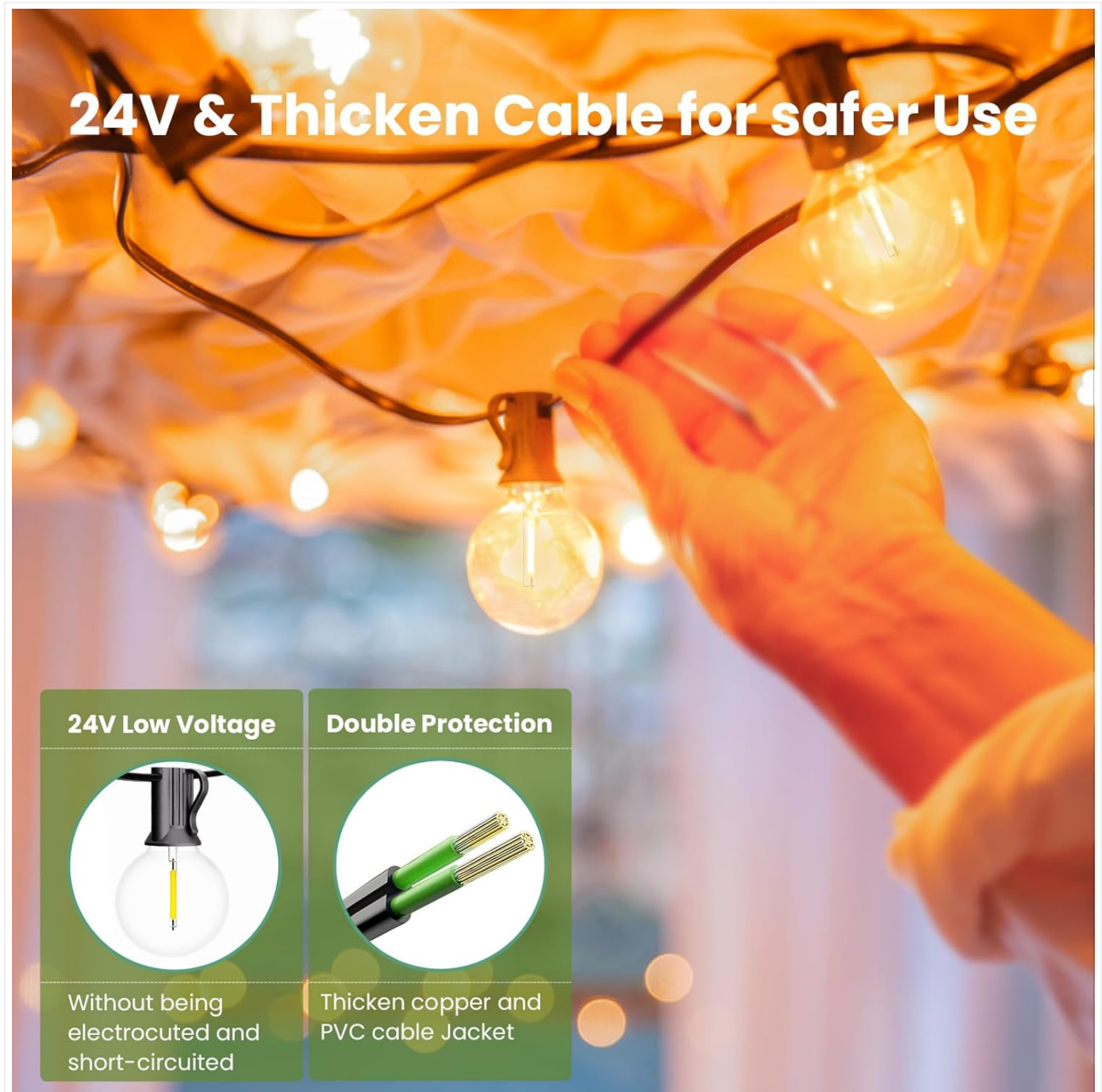
Image: Illustration of the 24V low voltage and double-protected cable design for enhanced safety.