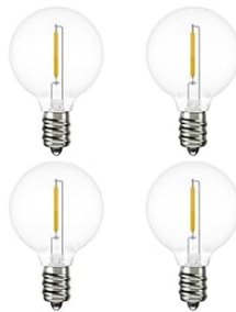
4 Spare Bulbs