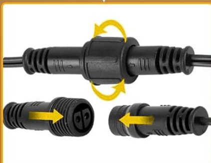
End to End Connection