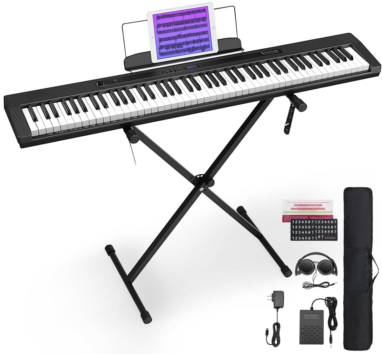
Image: The Starfavor SP-88S digital piano keyboard displayed with all its included accessories, such as the stand, sustain pedal, headphones, music holder, carrying bag, and power adapter.