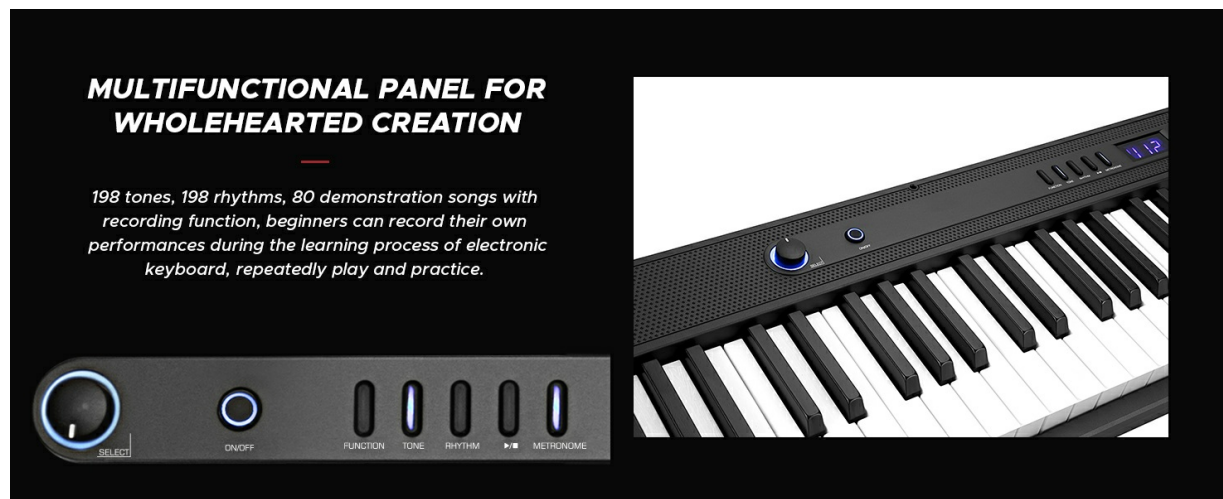
Image: A close-up view of the Starfavor SP-88S digital piano's control panel, showing the various buttons and display for functions like tone, rhythm, metronome, and power.

Connect the keyboard to a computer or other MIDI-compatible device using the USB cable. The keyboard will function as a MIDI controller, allowing you to use music software for recording, composing, and learning.