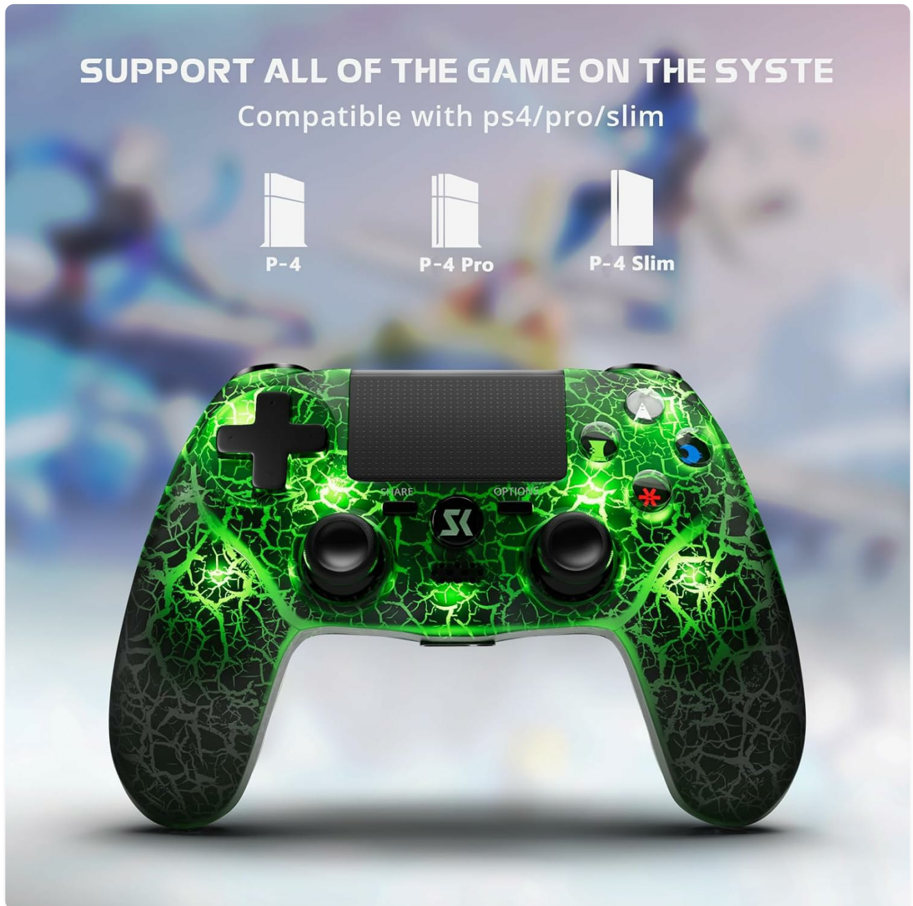
Image: The Boowen wireless controller is compatible with PS4, PS4 Pro, and PS4 Slim models, offering versatile gaming options.

These controllers are compatible with various platforms. For PC, iPad, iPhone, Steam, Android, and MacOS, please refer to the specific device's Bluetooth pairing instructions. The controller will appear as a discoverable Bluetooth device.