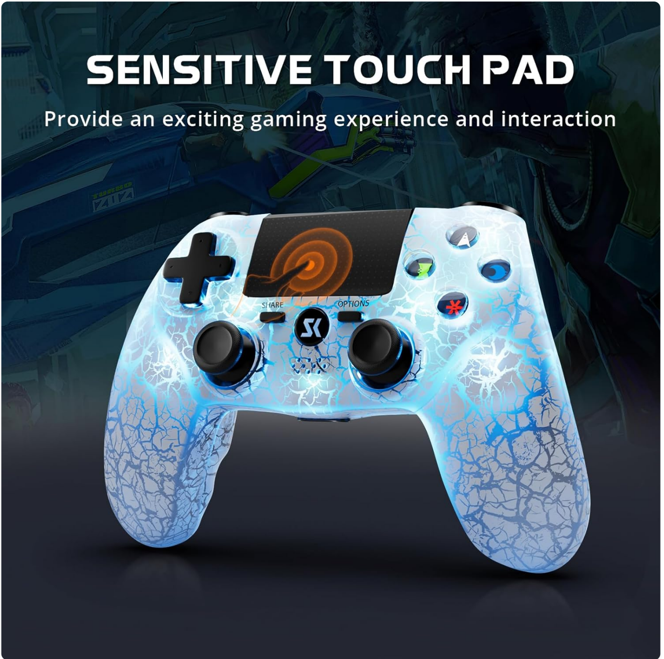
Image: The controller features a sensitive touchpad for enhanced interaction in games.

Provide an exciting gaming experience and interaction