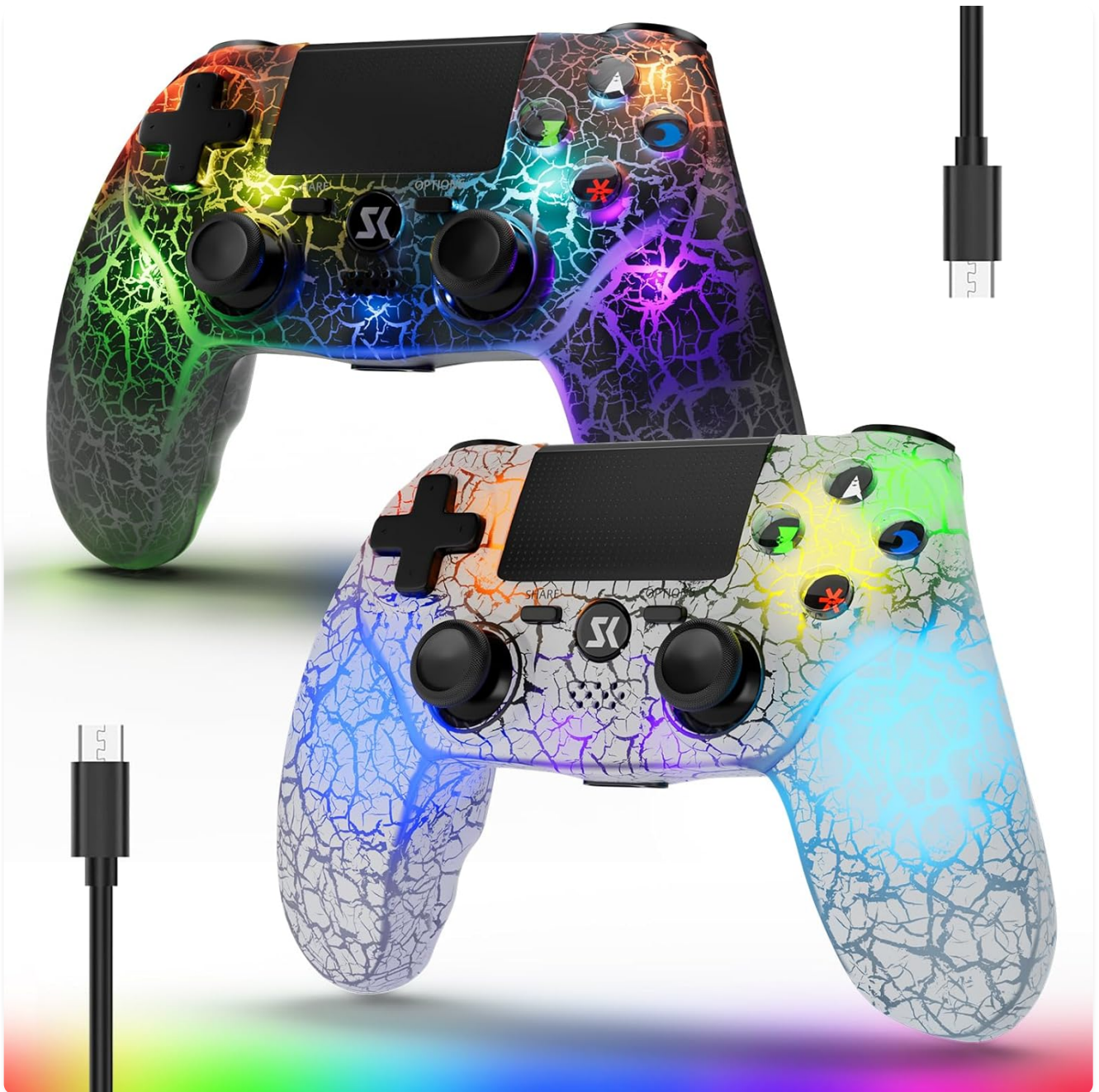
Image: The Boowen wireless controllers feature a unique glacial crack design with adjustable RGB backlighting.