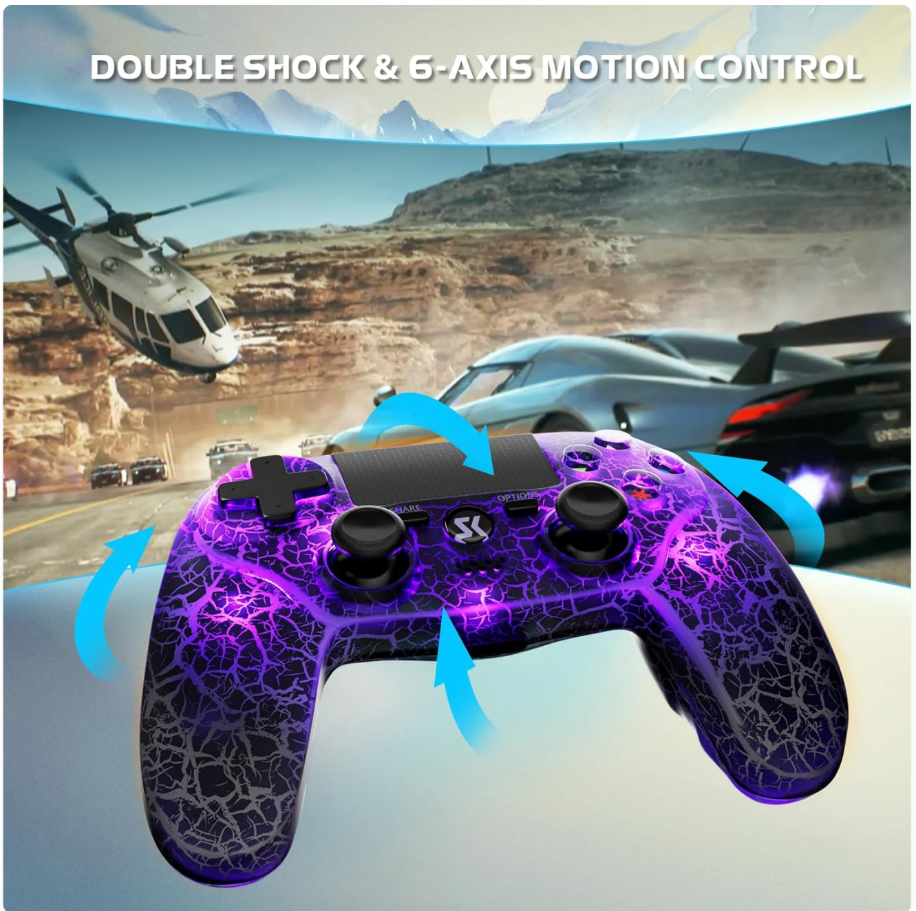
Image: Experience immersive gameplay with built-in dual motors for vibration feedback and a 6-axis gyroscope for motion control.