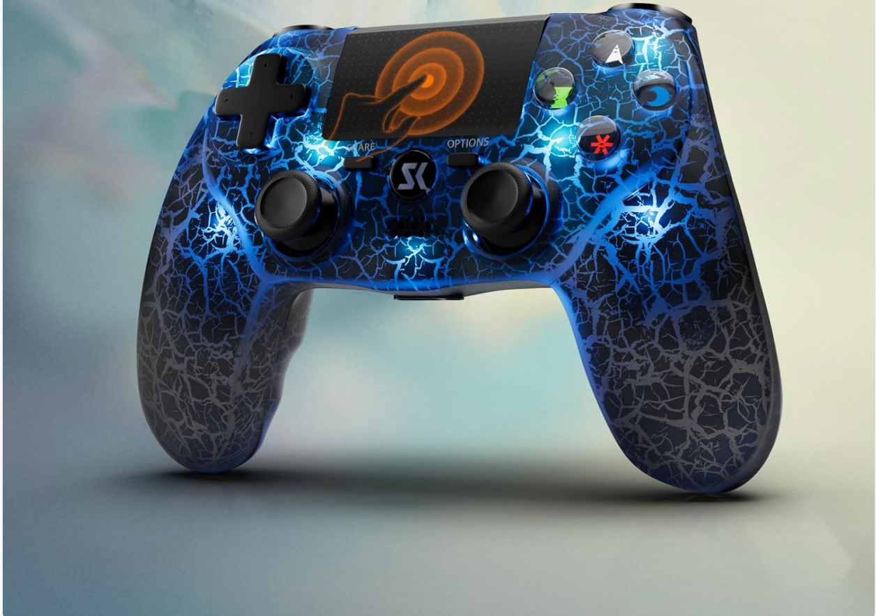
Figure 3: Sensitive Touch Pad. This image highlights the central touchpad on the controller, indicating its interactive capabilities for enhanced gameplay.

Provide an exciting gaming experience and interaction