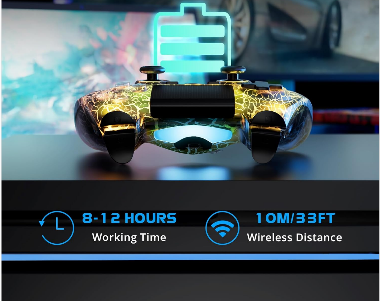
Figure 6: Built-in 1000mAh Rechargeable Battery. This image visually represents the controller's long battery life, showing a battery icon and text indicating 8-12 hours of working time and 10m/33ft wireless distance.