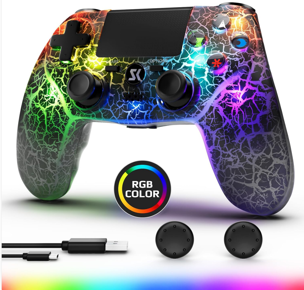
Figure 1: Boowen Wireless Controller. This image displays the front view of the controller, highlighting its unique black crack design with vibrant RGB lighting effects. The controller features standard PS4 button layouts, including a central touchpad, dual analog sticks, and directional pad.