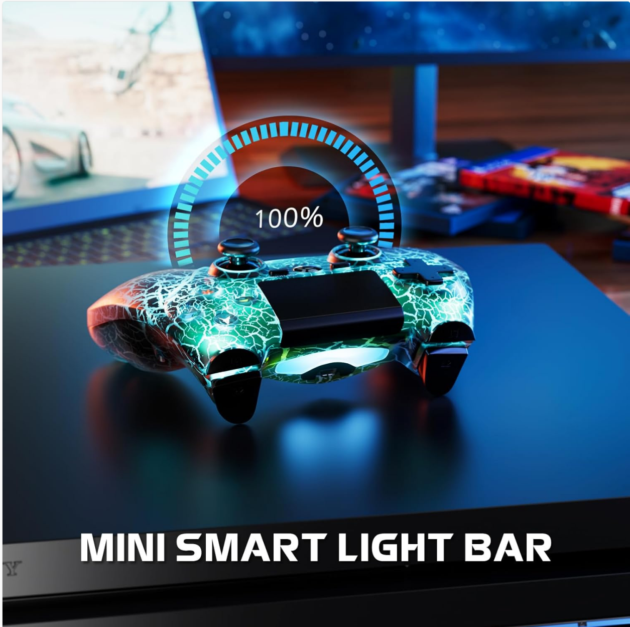
Figure 2: Mini Smart Light Bar. This image shows the controller resting on a console, with its light bar illuminated, demonstrating the customizable RGB lighting feature.